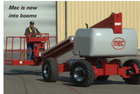
Mec is now into booms

Carry on past the Vertical Press stand - do say hello - and onto the Gold Lot where first stop is Snorkel/UpRight. The two brands now merged will be flying the Snorkel flag since we are in the good old US of A. This will be the first chance for many to meet the senior managers of new owners - Tanfield and learn more about the company's aggressive expansion and development plans. Across the aisle you will find the massive Terex stand and Genie will have a good selection of its booms on display and might yet surprise us with something new?