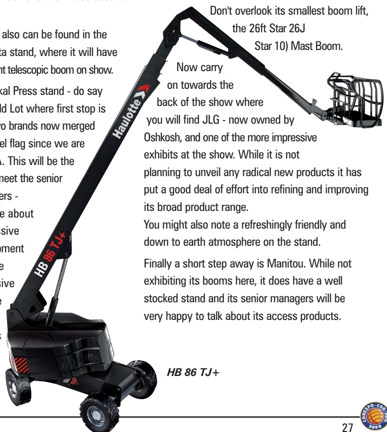
HB 86 TJ+

Finally a short step away is Manitou. While not exhibiting its booms here, it does have a well stocked stand and its senior managers will be very happy to talk about its access products.