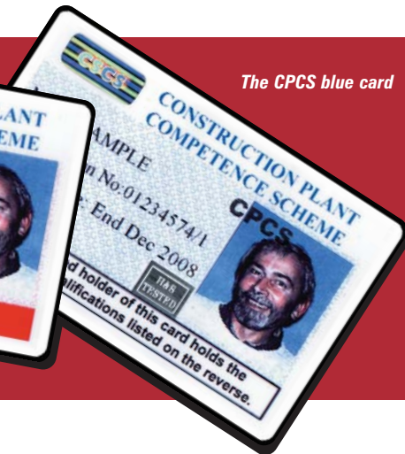
The CPCS blue card

ALLMI Card + ConstructionSkills Health & Safety Touch Screen Test =