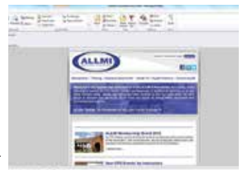
ALLMI's new-look e-newsletter

ALLMI recently released its new-look quarterly e-mail newsletter, designed to keep lorry loader professionals up to speed on industry issues. If you would like to be added to the mailing list, contact the association.