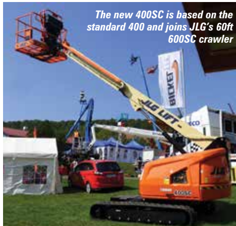
The new 400SC is based on the standard 400 and joins JLG's 60ft 600SC crawler

JLG has launched a new 40ft track mounted telescopic boom lift - the 400SC. Based on the regular wheeled 400 it offers more than 11 metres of outreach with dual platform capacities of 270kg unrestricted or 450kg with restricted outreach. Other features include 360 degree continuous slew, variable engine speed control for improved fuel consumption and quieter operation and Dura Tough covers.