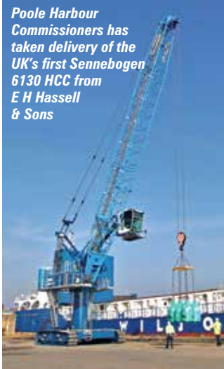
Poole Harbour Commissioners has taken delivery of the UK's first Sennebogen 6130 HCC from E H Hassell & Sons