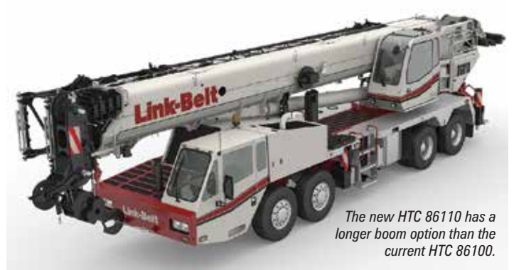
The new HTC 86110 has a longer boom option than the current HTC 86100.

auto idle feature with operator selected ranges for improved fuel economy, automatically reducing engine speed to idle if no function is used for 10 seconds, resuming the pre-set speed once any function is re-engaged.