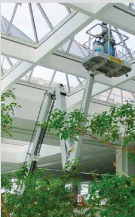
Falcon spider lifts can now be ordered with lithium battery power.

The package is being sold as an upgrade over the regular 24 volt battery system. In addition to the higher speeds and gradeability matching that of the IC powered models, the lithium batteries are also recharged in a substantially shorter time and offer a much longer working life with less maintenance. As with the regular batteries it can also be combined with the IC diesel gas power packs. The company plans to make the lithium battery pack available on other Falcon models in the near future.