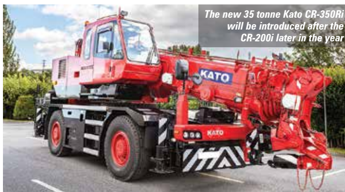
The new 35 tonne Kato CR-350Ri will be introduced after the CR-200i later in the year

Rivertek says that it is planning to open a dedicated Kato Crane Centre in the UK in 2016.