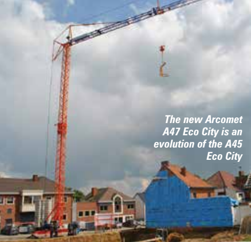
The new Arcomet A47 Eco City is an evolution of the A45 Eco City