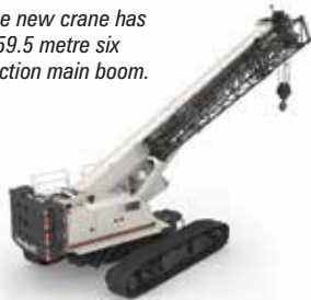
The new crane has a 59.5 metre six section main boom.

New features include an electronic inclinometer providing a digital readout of the cranes angle, a new