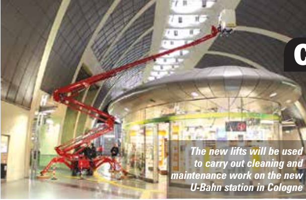
The new lifts will be used to carry out cleaning and maintenance work on the new U-Bahn station in Cologne

Italian spider lift manufacturer Bluelift has unveiled a version of its 22 metre SA22 spider lift fitted with fully certified 1,000 volt insulated basket. Transportation company Kölner Verkehrsbetriebe has taken the first two units for cleaning and maintenance work on a new U-Bahn station in the city of Cologne, Germany. The SA22 takes its 250kg maximum platform capacity to an outreach of 9.9 metres and can reach 10.9 metres with 200kg. The machine weighs just under three tonnes when fully equipped with standard Honda power unit.