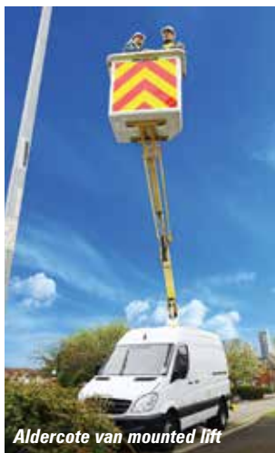
Aldercote van mounted lift

The move follows APS's recent success with the distribution of the Isoli 3.5 tonne truck mounted range - its first major venture into vehicle mounted platforms. The company is investing in new workshops and personnel at its base in Telford, Shropshire to mount the Aldercote boom kits to vans, including the Ford Transit and Iveco Daily. Employees at the company's parts and service affiliates, IPS and PSR are being fully trained on the Aldercote products, along with APS sales staff with the objective to win a solid share of the market. The new range will be formally launched in October.