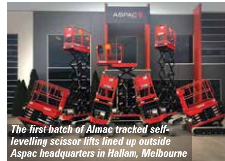
The first batch of Almac tracked self-levelling scissor lifts lined up outside Aspac headquarters in Hallam, Melbourne

The first Almac tracked scissor lifts from Italy have arrived in Australia, where they are being distributed by Melbourne-based Aspac under the Athena brand. The units are all painted in the Aspac colours of deep red and join a range that includes Winlet glazing robots, Hinowa tracked chassis and 'Zeus' branded spider lifts. The units will be available nationally through Aspac's dealer network. The move follows the recent launch of Almac tracked scissor lifts in North America with the appointment of TCA/Bluelift/Dinolift/Galizia distributor ReachMaster.