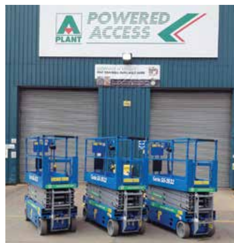
A-Plant has spent £4 million on 200 Genie aerial lifts.

All booms are equipped with electronic secondary guarding and are telematics ready, allowing access to real-time information online, including the exact location of the machine and utilisation while incorporating the capability for remote machine disabling. The telematics system is also programmed to require an IPAF PAL card to operate, assuring that only trained operators use the machines.