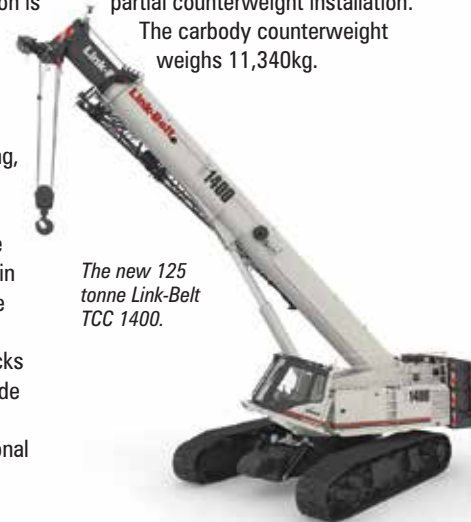
The new 125 tonne Link-Belt TCC 1400.

the 22,680 kg six piece upper counterweight is easily installed and load charts are included for partial counterweight installation. The carbody counterweight weighs 11,340kg.