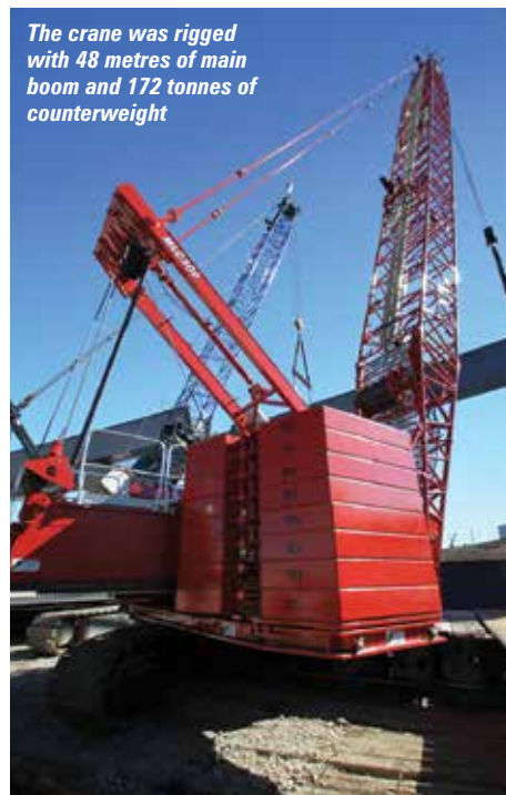
The crane was rigged with 48 metres of main boom and 172 tonnes of counterweight