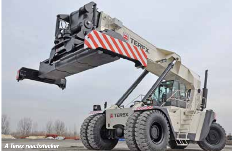
A Terex reachstacker

In the week following the merger announcement, several securities lawyers filed investigative actions contesting the deal on the basis that it undervalued Terex stock.