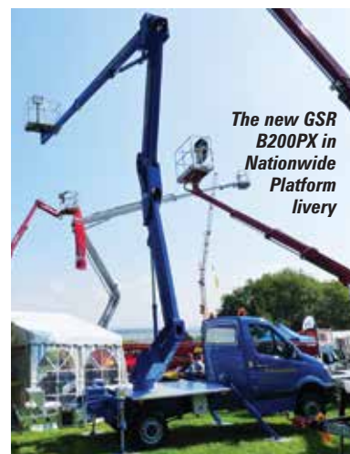
The new GSR B200PX in Nationwide Platform livery

GSR has unveiled a new 20 metre B200PX, articulated truck mounted lift on a 3.5 tonne chassis, with 300kg platform capacity and a true 3,500 kg GVW with occupants, fuel and equipment. GSR says that it has not only reduced weight but also improved the rigidity or 'feel' in the platform, managed 8.7 metres of unrestricted outreach, 140 degrees of platform rotation and nine metres up and over height. It is available on Mercedes or Nissan/Renault chassis with Nationwide Platforms in the UK being a lead customer. The machine was unveiled at the recent Platformers Days in Germany when the company also celebrated 10 years partnership with Rothleher.