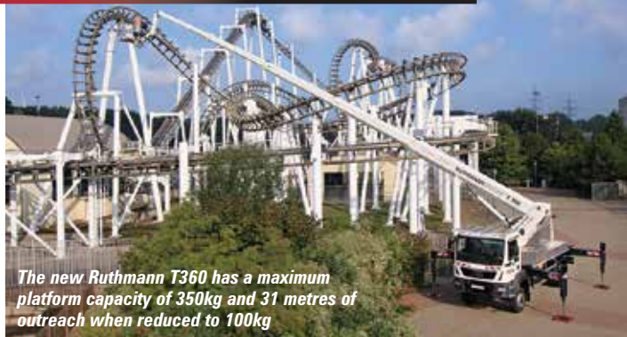
The new Ruthmann T360 has a maximum platform capacity of 350kg and 31 metres of outreach when reduced to 100kg