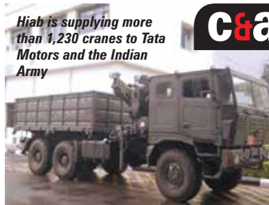
Hiab is supplying more than 1,230 cranes to Tata Motors and the Indian Army

trials in various environmental conditions for more than two years before being selected. The Hiab 088 was designed for tough operations and the cranes delivered for Tata Motors have been adapted to meet