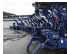
The first of 50 Maeda crane for German rental company Beyer.