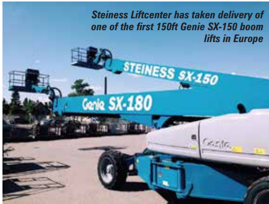
Steiness Liftcenter has taken delivery of one of the first 150ft Genie SX-150 boom lifts in Europe

Sharing the same chassis and principal components as the 180ft SX-180 and ZX-135, features include a rotating three metre articulated jib, a 7.5kW on-board generator for power tools and a Deutz Tier 4 final engine without the need for Diesel Particulate Filters.