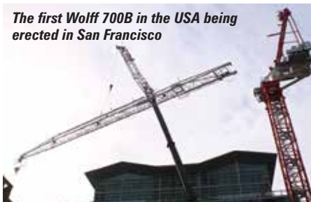
The first Wolff 700B in the USA being erected in San Francisco