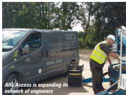
Alfa Access is expanding its network of engineers