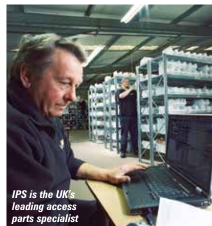
IPS is the UK's leading access parts specialist