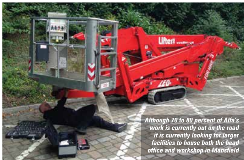
Although 70 to 80 percent of Alfa's work is currently out on the road it is currently looking for larger facilities to house both the head office and workshop in Mansfield