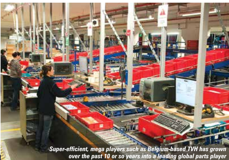
Super-efficient, mega players such as Belgium-based TVH has grown over the past 10 or so years into a leading global parts player

For companies such as IPS which already has the infrastructure in place, both the customer and the