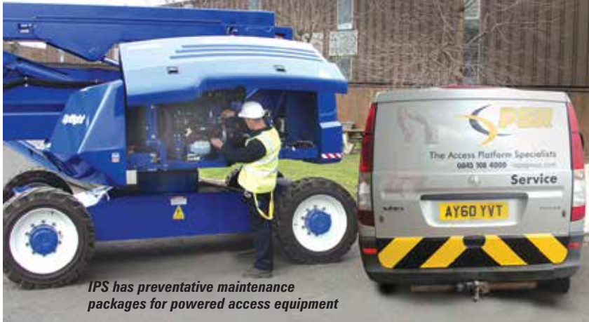
IPS has preventative maintenance packages for powered access equipment

IAPS has also won UK parts distribution contracts with several OEMs including Genie, Hinowa, Omme Lift, Isoli, Youngman BoSS, Grove Manlift, Manitou and MEC. It has a sophisticated parts database which includes significant cross-referencing of parts that are common to several major manufacturers' machines, so that it can also supply parts for other brands. It also offers a wide range of after-market parts for lesser-known brands and obsolete machines, sourced directly from the component manufacturers.