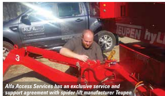
Alfa Access Services has an exclusive service and support agreement with spider lift manufacturer Teupen