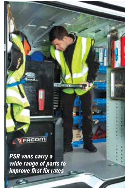
PSR vans carry a wide range of parts to improve first fix rates

"Owners of used equipment refurbished to Gold Standard by PSR can also now purchase a one-year extended warranty for these machines, which again is