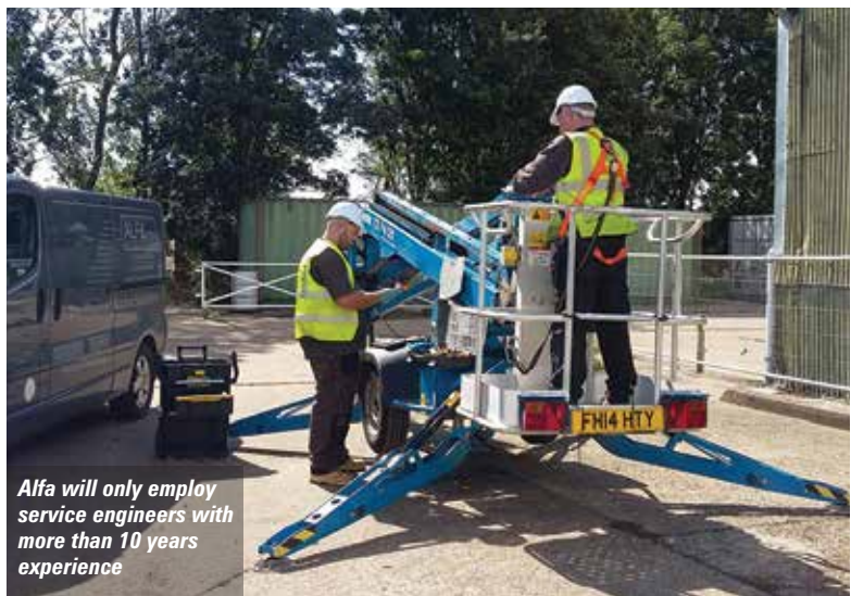
Alfa will only employ service engineers with more than 10 years experience

live, web-based individual tracking system that gives minute by minute updates on the position of all the vehicles allowing the most efficient fleet coverage."