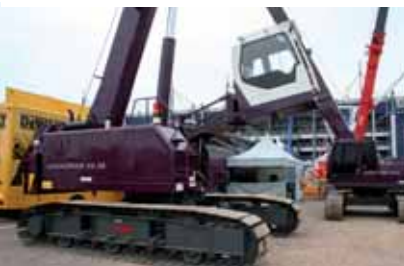
SED first-timers Cranebusiness BV.