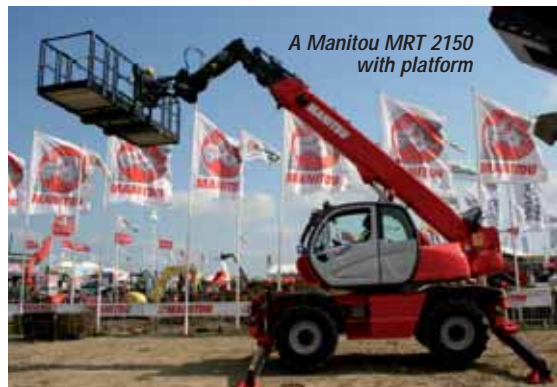
A Manitou MRT 2150 with platform