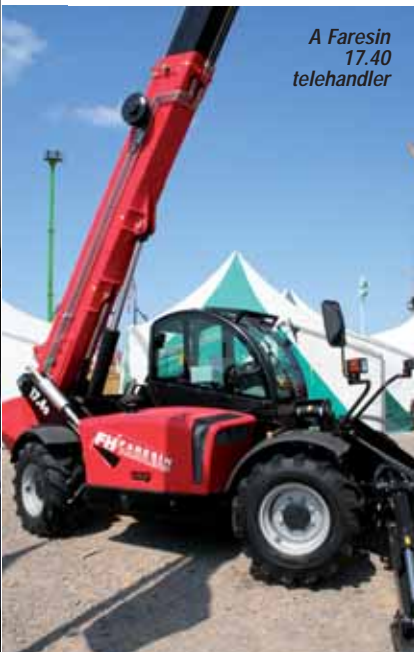
A Faresin 17.40 telehandler