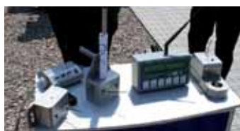
The wireless LSI load indicator system.