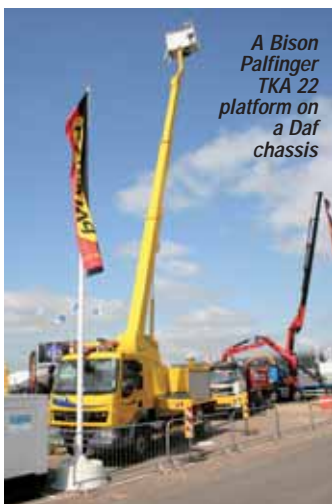
A Bison Palfinger TKA 22 platform on a Daf chassis