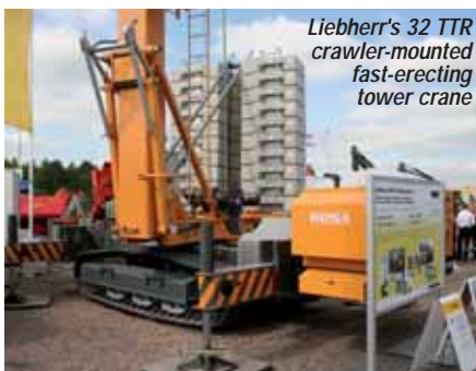
Liebherr's 32 TTR crawler-mounted fast-erecting tower crane