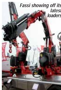
Fassi showing off its latest loaders