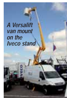
A Versalift van mount on the Iveco stand