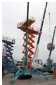
Maeda machines on the Kranlyft stand.