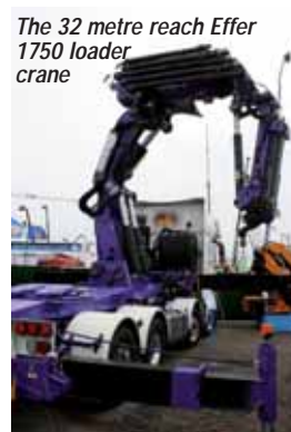
The 32 metre reach Effer 1750 loader crane