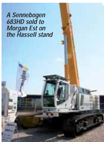
A Sennebogen 683HD sold to Morgan Est on the Hassell stand