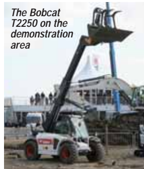
The Bobcat T2250 on the demonstration area