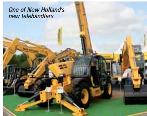
One of New Holland's new telehandlers