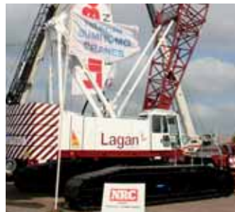
The Hitachi Sumitomo SCX15000-2 made its UK launch.