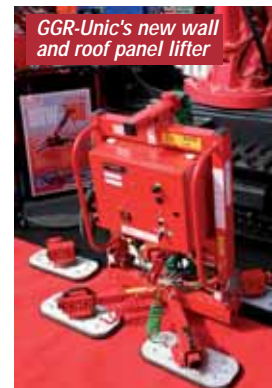
GGR-Unic's new wall and roof panel lifter