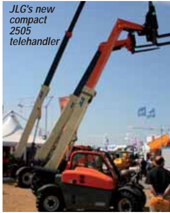
JLG's new compact 2505 telehandler