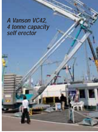
A Vanson VC42, 4 tonne capacity self erector