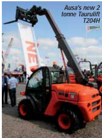
Ausa's new 2 tonne Taurulift T204H