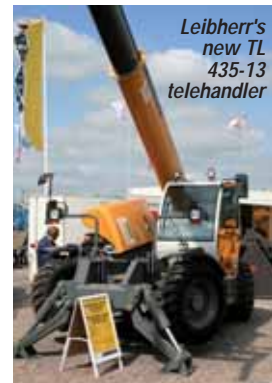
Leibherr's new TL 435-13 telehandler