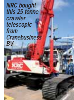
NRC bought this 25 tonne crawler telescopic from Cranebusiness BV