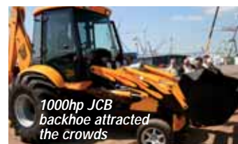
1000hp JCB backhoe attracted the crowds