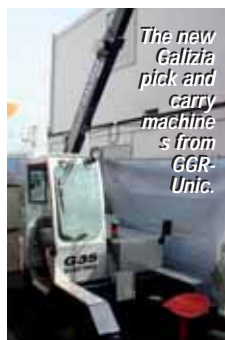
The new Galizia pick and carry machines from GGR-Unic.