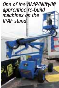
One of the AMP/Niftylift apprentice re-build machines on the IPAF stand