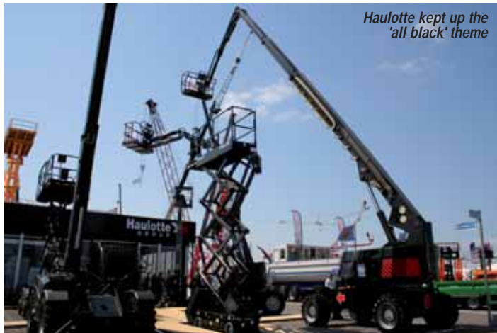
Haulotte kept up the 'all black' theme