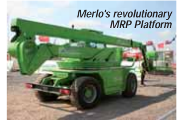
Merlo's revolutionary MRP Platform