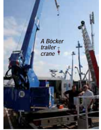
A Böcker trailer crane