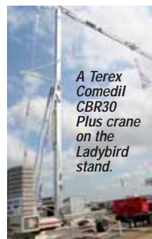
A Terex Comedil CBR30 Plus crane on the Ladybird stand.