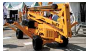
Promax Access was showing a Bil-Jax 45XA.