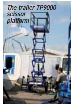
The trailer TP9000 scissor platform