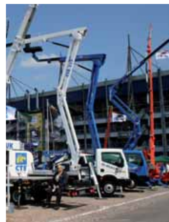
From Power Tower upwards on the CTE UK stand.