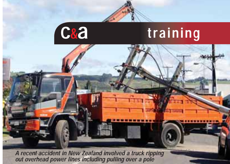
A recent accident in New Zealand involved a truck ripping out overhead power lines including pulling over a pole