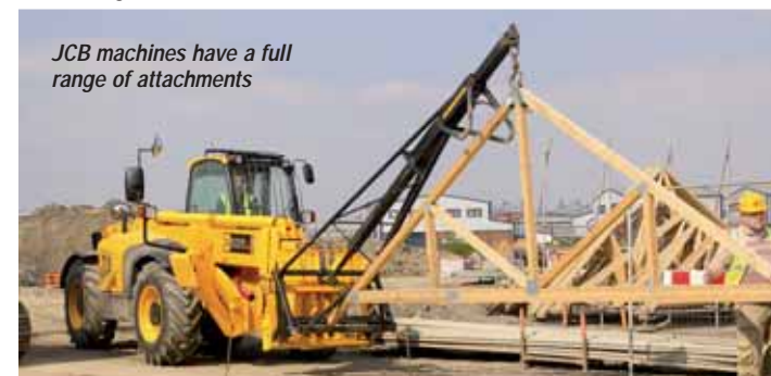
JCB machines have a full range of attachments

used the same basic components as larger models, it just did not make sense financially. As with many innovations it was probably ahead of its time. The smallest models currently in the company's range are the P28.8 and P32.6 compact machines, originally introduced to satisfy demands for a low, narrow machine for the construction and