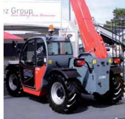
The more purposeful looking SZ306 seen for the first time at Conexpo.

Another Spanish manufacturer MZ Imer already has rigid mast forklifts but has also launched a good looking, compact machine the MZ-2706 Lift. Built at