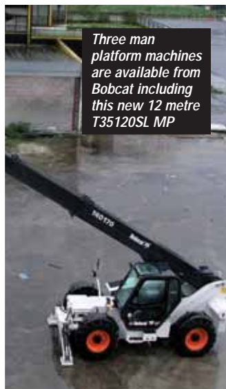
Three man platform machines are available from Bobcat including this new 12 metre T35120SL MP

Manitou's 30 metre, 360 degree MRT 3050 is now starting to attract the attention of rental fleets in the UK. However its significant price premium compared to the 25 metre models, not to mention the greater challenges of transporting it, all add to a rental rate about 40 percent higher than an MRT 2540 - means that most customers will opt for the smaller machine. Even so, 360 degree models are still not as popular in the UK as mainland Europe. Although this is beginning to change with Merlo, which leads the 360 degree market in the UK, reporting its best year ever for Roto sales into the UK market.