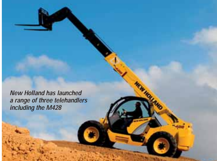
New Holland has launched a range of three telehandlers including the M428

Merlo intrigued many last year with its telehandler-based self propelled, high speed articulated booms however its telehandlers are still its primary product and the company is without question the leading producer of 360 degree models. In fact its 360 degree nomenclature Roto has virtually become the generic word for 360 degree telehandlers. Its latest model is the Roto 40.26 - an upgraded 40.25 - with increased lift height and a redesigned boom which gives more performance for the same weight.