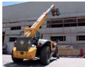
Liebherr machines have entered the UK market through its own rental operation.

launch in Spain that 'the company was now global market leader having produced 13,500 telehandlers in 2007 and was clear UK leader with sales of 5,000 units giving it a 60 percent UK market share. Its main markets after the UK include