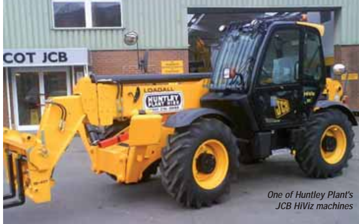
One of Huntley Plant's JCB HiViz machines