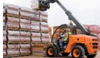
Ausa Taurulift T204H features an extending arm, tilting cab and hydrostatic transmission.

growth in this sector of the market by looking at telehandlers again. Its new machine fits into the 'under 1,600mm wide, 2,000mm high' compact category and can lift 2,000kg to 4.2 metres. In the compact telehandler table we have included machines up to 2,000mm wide and about 2,000mm high. The Taurulift has a good standard specification and includes hydraulic quick hitch, beacon, anti-vandal and security systems as well as the tilting cabin which gives excellent service access.