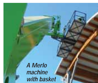
A Merlo machine with basket

used the same basic components as larger models, it just did not make sense financially. As with many innovations it was probably ahead of its time. The smallest models currently in the company's range are the P28.8 and P32.6 compact machines, originally introduced to satisfy demands for a low, narrow machine for the construction and