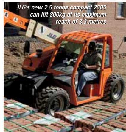
JLG's new 2.5 tonne compact 2505 can lift 800kg at its maximum reach of 3.3 metres

Its new 2.5 tonne five metre compact 2505 can lift 800kg at its maximum reach of 3.3 metres. JLG says it spent a lot of time gathering