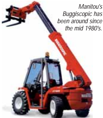
Manitou's Buggiscopic has been around since the mid 1980's.

With brownfield developments and space-restricted sites becoming the norm rather than the exception, many new builds are forced to use underground car parks and parts of the building for material storage. This means the demand for low height, narrow manoeuvrable machines with good lift performance is growing. Combine this with the continued growth in worldwide telehandler sales (in spite of the recent dip in North America) and it is not surprising that more manufacturers are looking for a slice of the action.