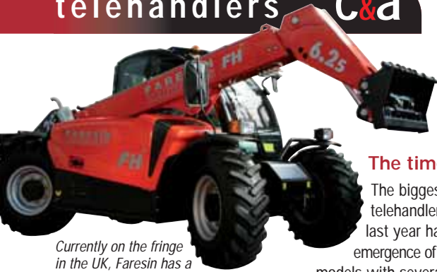
Currently on the fringe in the UK, Faresin has a good range of machines including its compact 6.25.

So while the giants argue it out for the number one spot, they should be very careful not take their eye off the market for a second, particularly with the raft of new entrants trying to muscle in. Ausa, Saez, MZ Imer and Galmax have all now added compact products while the more established manufacturers continually update and improve their offerings with Italian 'newcomers' such as Dieci and Farasin continuing to make strides in the UK and Ireland. Fortunately the global market is still growing allowing everyone to sell and enticing others into the sector.