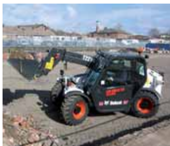
The Bobcat T2250 is said to offer the features and benefits of a skid steer, artic wheel loader and telehandler all rolled into one.

Masters of the compact equipment - Bobcat - has also recently entered the compact telehandler market