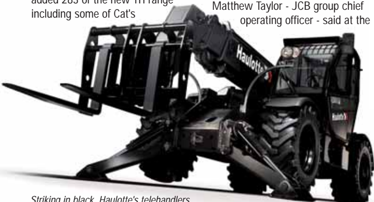
Striking in black, Haulotte's telehandlers are just starting to appear in the UK.