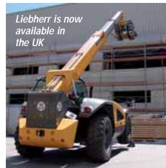
Liebherr is now available in the UK

New Holland is another company that having dabbled on the edge of the telehandler market for some time, is now trying to become a