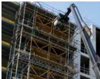
One of the Manitou MRT 2540 telehandlers placing materials on the upper floor.

combination of mastclimbers and two, 25 metre Manitou MRT 2540 360 degree telehandlers supplied by Easi UpLifts, Midlands depot for access and handling duties. With the frame now fully erected, there is also the possibility that the site will take the latest 30 metre, Manitou MRT3050 - one of which is due to join the Easi UpLift fleet shortly - to give easier reach to the upper floors. Because of the lack of access to the rear of the building, all materials have to be loaded onto three landing stages at the front of the building and then 'rolled' through the building to the rear.