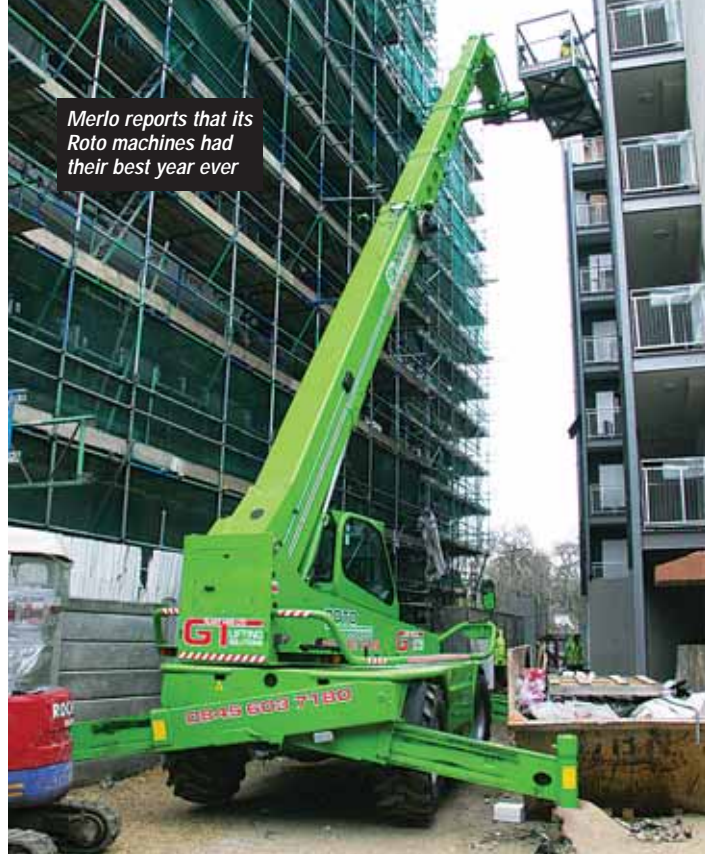
Merlo reports that its Roto machines had their best year ever

An electronically regulated hydrostatic transmission, a standard feature on all Bobcat telescopic handlers, enables the operator to choose between two driving modes - direct drive, where priority is given to travel speed, or soft drive, where priority is given to hydraulic power and torque.