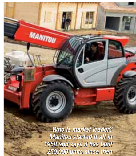
Who is market leader? Manitou started it all in 1958 and says it has built 250,000 units since then

Until recently, Manitou has always been accepted as the global telehandler leader. In fact it is now