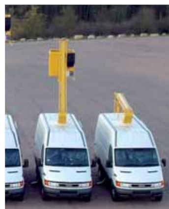
A Skyking 125RA