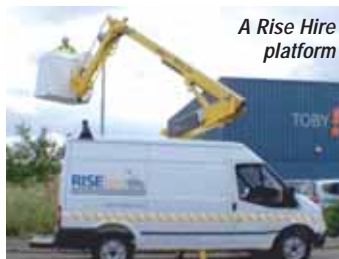
A Rise Hire platform