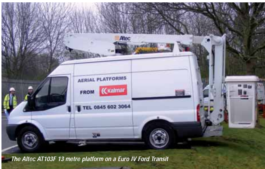
The Altec AT103F 13 metre platform on a Euro IV Ford Transit