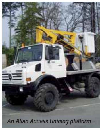
An Allan Access Unimog platform

The company has recently completed a 2,300 square metres (25,000 sq ft) extension to add to its 3,250 square metre (35,000 sqft) facility to be able to cope with the ongoing growth in after sales services.