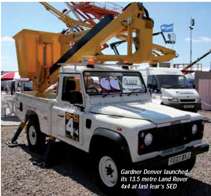
Gardner Denver launched its 13.5 metre Land Rover 4x4 at last year's SED

"Today BT still has a major impact on the van market and if it does not place an order, then we are looking at a shortfall of over 100 units," says Couling. "We sell about 70 to 80 units direct to BT and another 20 to 30 to contractors involved with BT work. Over the last 12 months we have sold 85 BT connected units."