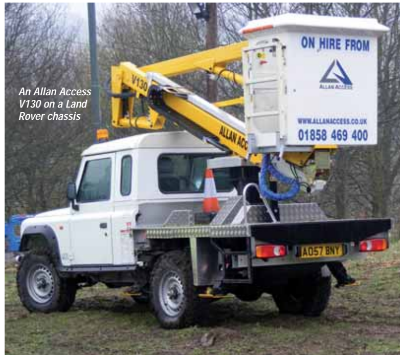
An Allan Access V130 on a Land Rover chassis

Altec is also a specialist in fully insulated boom lifts, and is naturally looking to muscle in on Versalift's domination of this market in the UK. Versalift says that about 25 percent of the units it produces are insulated machines - up to 46kV or an optional 69kV. "With outage (when the system is down) costs of £200,000 for just four hours without power, contractors need to have machines that can work on live cables," says Couling. "And with the UK pylons placed across the countryside many opt for platforms mounted on Unimog U3000 7.5 or 8.5 tonne chassis or 10 or 12 tonne Unimog U400."