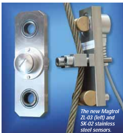
The new Magtrol ZL-03 (left) and SK-02 stainless steel sensors.

Magtrol, the Swiss-based specialist in force measurement has introduced a new range of load measuring sensors. The all stainless steel cable-tension strain gauge type sensor SK-02, has been designed for quick installation without any mechanical modification to an existing installation. It can handle cables with a diameter from eight to 22 mm. The stainless steel ZL-03 traction type sensor simply measures the weight of suspended loads. The new sensor is designed to withstand long-term dynamic loadings, as well as cope with hostile environments. It is available in a range of sizes from 10 to 100 kN and offers a large overload capacity and a high level of precision.