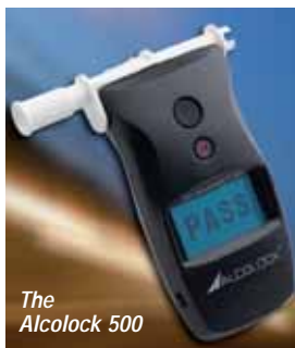
The Alcolock 500

The system which can be retrofitted to almost any vehicle, has been developed and manufactured by PFK Electronics in South Africa and Lion Laboratories in the UK. Some 7,000 units are said to be in daily use in Europe. In the UK Coopers, a company managing a fleet of over 100 refuse trucks has just fitted all of its trucks with the device.