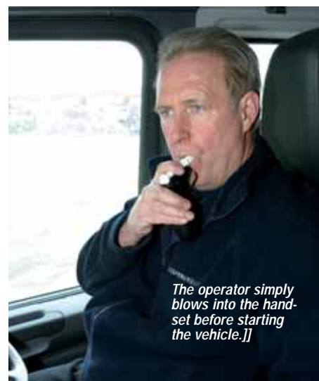
The operator simply blows into the hand-set before starting the vehicle.]]