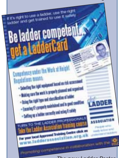
The new Ladder Poster available from the Ladder Association.

The Ladder Association PO Box 183 Leeds LS11 1AG Tel: 0845 260 1048 Fax: 0845 260 1049 Email: info@ladderassociation.org.uk Web: www.ladderassociation.org.uk