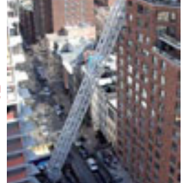
The main tower leans precariously against a building