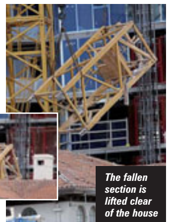
The fallen section is lifted clear of the house