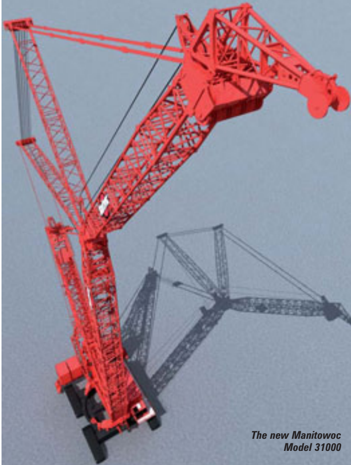
The new Manitowoc Model 31000