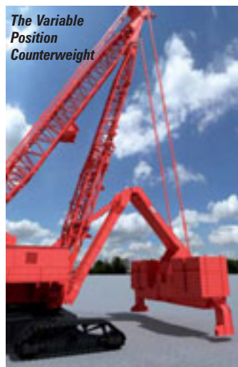
The Variable Position Counterweight

By introducing a new hydraulically Variable Position Counterweight (VPC) it says it will keep the crane's centre of gravity over its four trunion mounted tracks. These tracks will allow greater pick-and-carry capacities while keeping the machine's footprint relatively small at 17 metres by 20 metres when the counterweight is retracted.