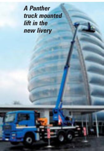
A Panther truck mounted lift in the new livery