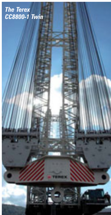
The Terex CC8800-1 Twin

The deal for the world's largest crawler crane is reported to be worth more than RMB200 million ($28.5 million). CNEC is a state-owned enterprise based on former China National Nuclear Corporation companies and administered by the central government.