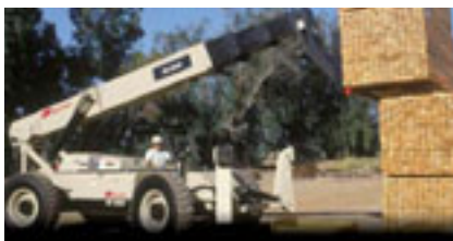
The VR1056 is the largest of the units Skyjack is hoping to acquire

Linamar, has also released its 2007 results. The industrial division, which is largely made up of Skyjack aerial lifts and more recently Carelift, saw revenues climb by almost 26 percent to around C$477 million ($482 million).