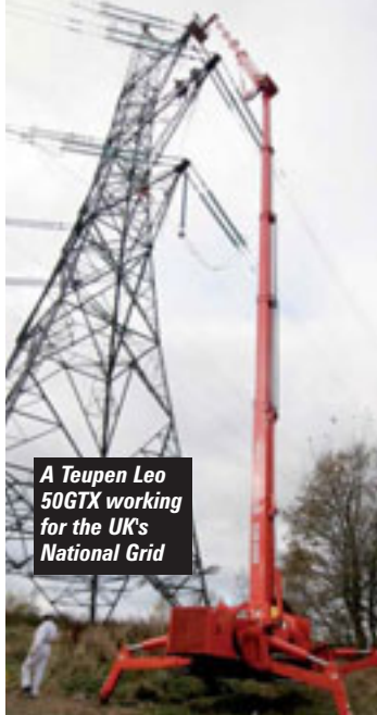
A Teupen Leo 50GTX working for the UK's National Grid

The company is also recruiting additional service staff in order to keep pace with demand and is also scheduled to take on the Dinolift product line.