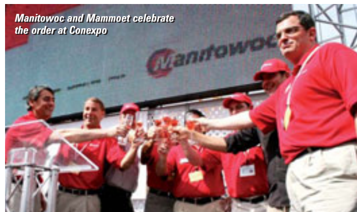
Manitowoc and Mammoet celebrate the order at Conexpo

While the 31000 follows the Model 21000 with its four crawlers, the 31000 uses four single tracks, rather than the dual crawlers on the 21000. And in place of regular slew bearing it uses a 12 metre roller path slewing ring - reminiscent of some of Manitowoc's earlier Ringer attachments - to keep loads evenly distributed over the four track assemblies.