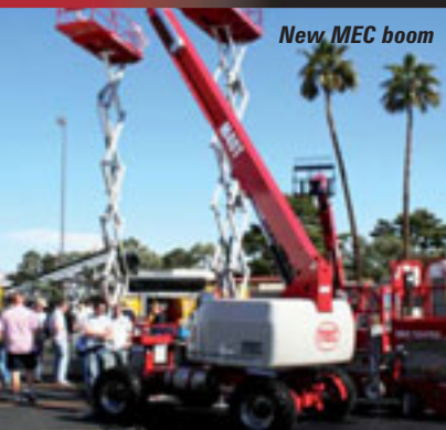
New MEC boom

and Ireland. The star of the Haulotte stand was its new 26 metre HA28TJ telescopic boom lift, featuring compact dimensions, five metre telescopic jib, big platform and a tight tailswing.