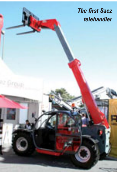
The first Saez telehandler

Saez also launched its three model telehandler range which comprises of a 3 tonne 6 metre SZ306, the quite dissimilar looking 2.7 tonne 5.5 metre SZ255 with a 4 tonne, 17 metre machine to be announced at a later date.