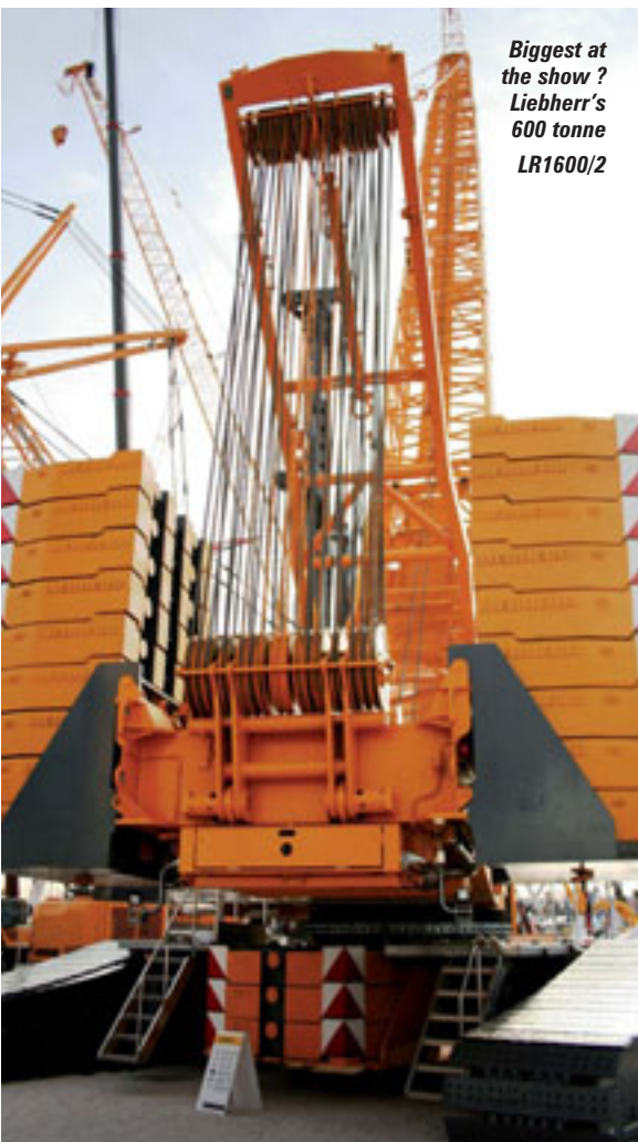
Biggest at the show? Liebherr's 600 tonne LR1600/2