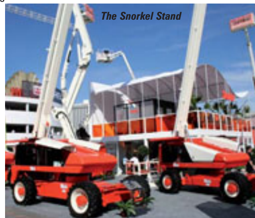
The Snorkel Stand

shows means that only a few are used by the major manufacturers as a focus for product launches. Bauma has clearly established itself as THE global show. Conexpo however has cemented its position as the number one heavy equipment show for the Americas. Put it in your diary for 2011.