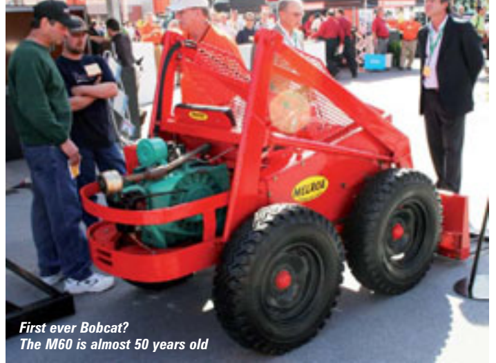
First ever Bobcat? The M60 is almost 50 years old

Another compact telehandler was shown by Ausa , the Taurulift