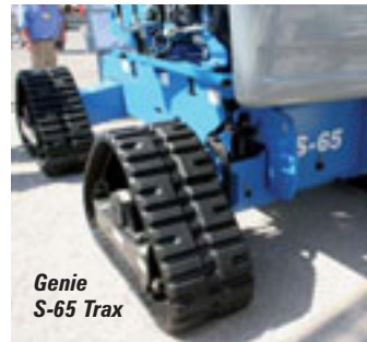
Genie S-65 Trax

Star crane exhibit was the 110 tonne RT1120 - with its Demag boom and Terex Waverly RT base. The main boom, bi-fold swingaway extension and two 7.9 metre inserts provide a maximum tip height of 83 metres.