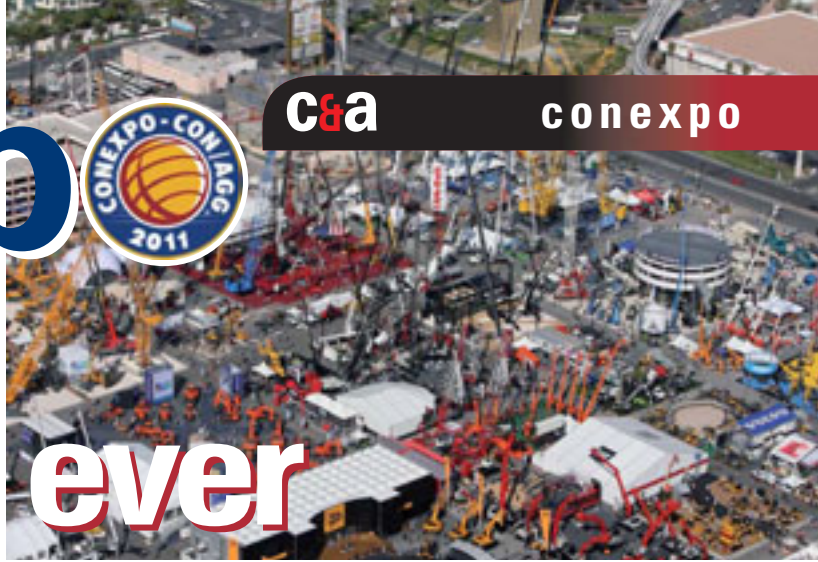
Opening day crowds