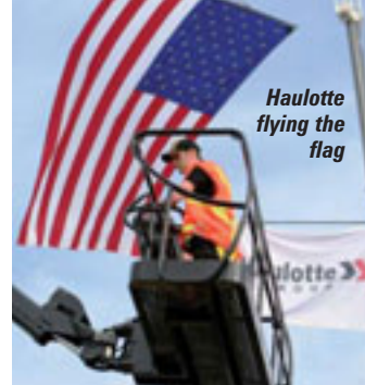
Haulotte flying the flag

shows means that only a few are used by the major manufacturers as a focus for product launches. Bauma has clearly established itself as THE global show. Conexpo however has cemented its position as the number one heavy equipment show for the Americas. Put it in your diary for 2011.