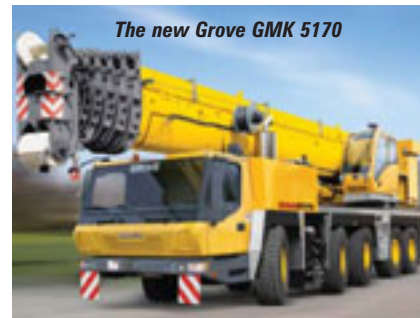
The new Grove GMK 5170

Link Belt also had lots to talk about, including its largest ever crawler crane - the 500 tonne capacity HC548 - aimed at petrochemical and wind energy work. Designed with the latest CE regulations in mind, the HC548 has a 42 to 108 metre main boom plus 84 metre heavy duty jib. A luffing jib option is due to begin testing along with a heavy-lift attachment with 'supermast'.