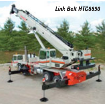
Link Belt HTC8690

tower cranes. The VC27 can take 2,200kg to 12.13 metres radius and 850kg at a 27 metre radius. Hook height with jib horizontal is 23 metres rising to 31.4 metres at