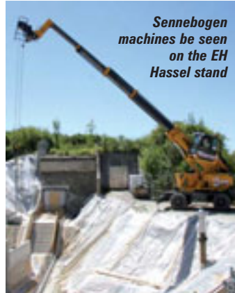
Sennebogen machines be seen on the EH Hassel stand