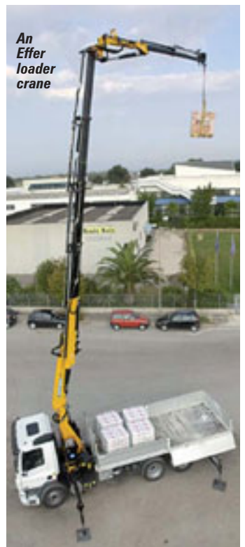
An Effer loader crane

The Vertikal team will of course be out in force and looking forward to meeting as many of you as possible. Cranes&Access is the official publication for the crane and access village so we will be reporting on events and news during the show. Do stop by and say hello.