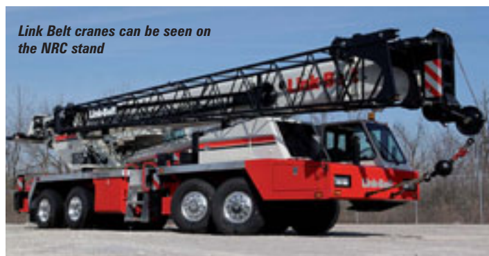
Link Belt cranes can be seen on the NRC stand

Universal Cranes, a division of Peterborough-based Crowland Cranes, will be showing a Zoomlion QY30V truck crane sold to Marsh Plant. The company has started importing the Chinese company's crawler crane line and will show the first 70 tonne QU70 crawler in the UK. A 10 tonne Ormig pick and carry crane will also be featured on the stand. See face to Face page 62.