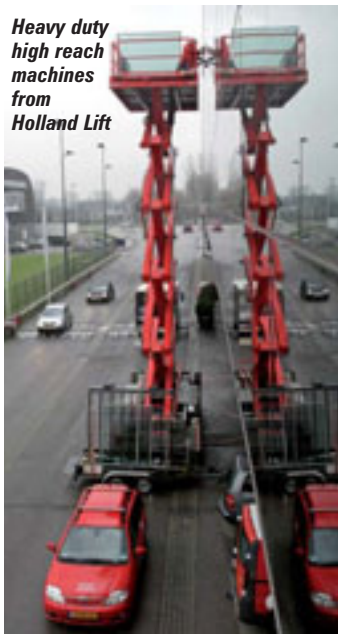
Heavy duty high reach machines from Holland Lift

SED will also be the first exhibition for Russon Access since Holland Lift purchased a 25 percent holding in its UK distributor. The Dutch-