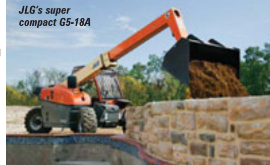
JLG's super compact G5-18A

updated E series scissor lift range on show but will be concentrating on its telehandler range showing off its recently launched super compact G5-18A which has a 5.5 metre lift height and 2,500kg lift capacity. Caterpillar will also show its version of this model built under the