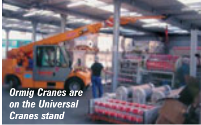
Ormig Cranes are on the Universal Cranes stand

Vanson is stressing reduced operating costs this year and showing its two latest self erecting