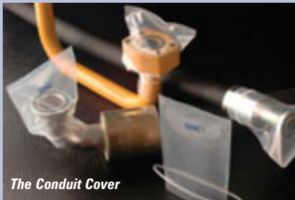
The Conduit Cover

Moore Industries has launched a new patented product for protecting open hydraulic hoses and tubes