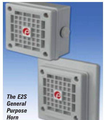
The E2S General Purpose Horn

The device is manufactured from high-grade, fire resistant polycarbonate with CE and UL approvals. It can be surface or flush mounted and is protected to IP66 (UL Type 4/4X/13) when used with the weatherproof back box, making it suitable for use in harsh environments.