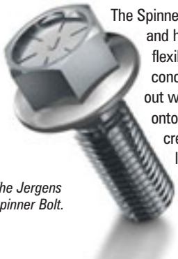
The Jergens Spinner Bolt.

treatments in its resistance to vibration. The benefits of the Spinner hardware includes: