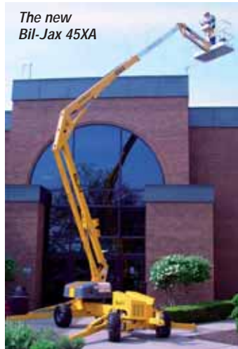
The new Bil-Jax 45XA

The new Skyjack booms will build on the SJ45T concept