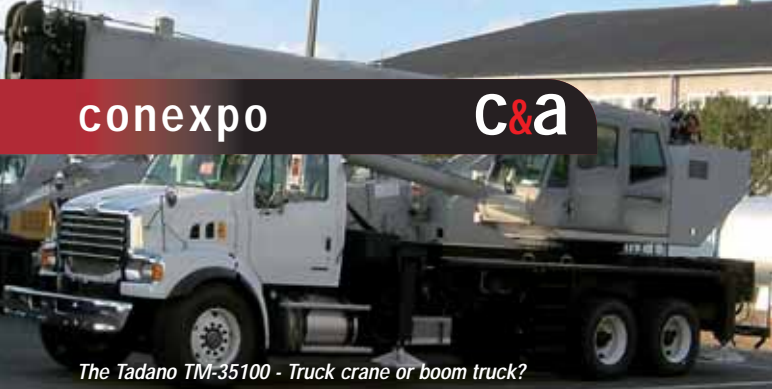
The Tadano TM-35100 - Truck crane or boom truck?