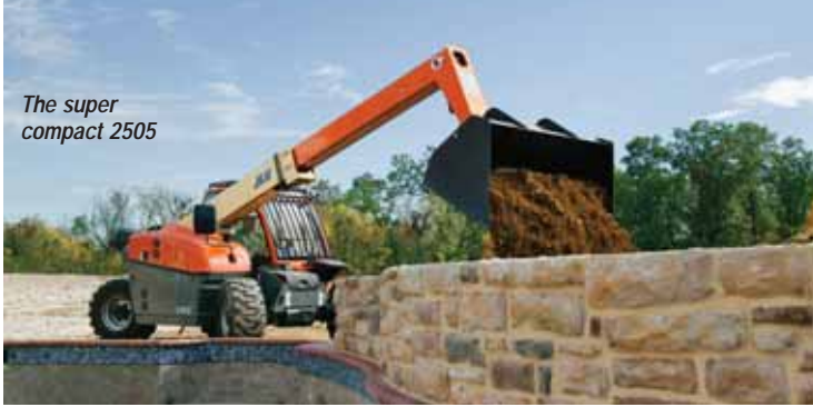
The super compact 2505