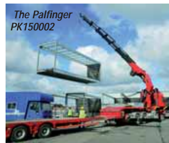
The Palfinger PK150002

National crane will have its new 25 tonne 900H with 48 metres of boom and jib.