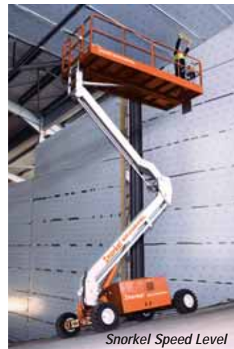
Snorkel Speed Level

Snorkel/UpRight Most products on the stand will be sporting Snorkel livery. This is one of the first chances to see the merged product line up. Look out for the UpRight Speed Level which has been updated with a number of detailed improvements. The group is also launching its Aerial based TL37 and TL49K trailer lifts in North America under the UpRight brand.