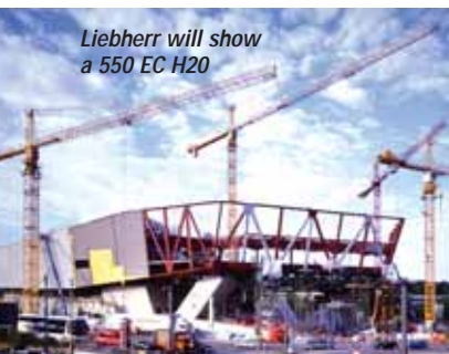
Liebherr will show a 550 EC H20

Grove will have a lot to talk about with two new All Terrain cranes, the five axle 170 tonne GMK5170, which boasts a 64 metre boom and up to 100 metres tip height and the 95 tonne GMK5095 first seen at Bauma last year. Two new truck cranes for North America - the 35 tonne TM500E-2, replaces the TMS500E and is mounted on a three axle commercial chassis, offering a top speed of 65 mph and the 100 tonne TMS9000E, with 43 metre pinned boom.