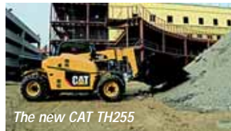
The new CAT TH255

CAT is also launching a worldwide machine, the super compact TH255, essentially the Caterpillar version of the JLG 2505 produced by the Cat JLG Alliance.