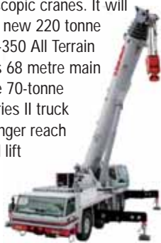
The Link Belt ATC-350

Tadano is also indicating some possible surprises on its stand and will show two new North American truck mounted cranes, the GS-300XL GT-900XL and a crane that it refers to as a boom truck, but which looks more like a truck crane, the TM-35100.