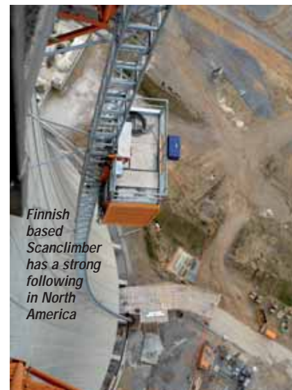
Finnish based Scanclimber has a strong following in North America

Alimak-Hek is using Conexpo to launch its L-350 - Light and M450 Medium mast climbers from its new modular range on the North American market. Canadian producer Fraco is also likely to have something new while Spanish producer Camac is making its Conexpo debut with a broad range of product.