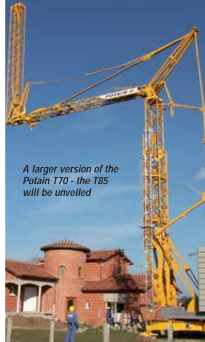
A larger version of the Potain T70 - the T85 will be unveiled

The USA is still the land of the boom truck, rather than the articulated loader crane, and this will be more than evident with the cranes on display. You can expect National Crane, Manitex, Altec and others will be focusing on their larger models including the new 50 ton Manitex 50110S with almost 50 metres of reach on board.