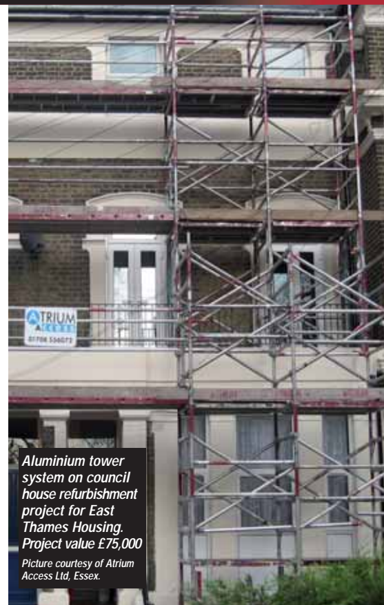
Aluminium tower system on council house refurbishment project for East Thames Housing. Project value £75,000.