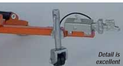
Detail is excellent

Built in its more recent 1/32 scale the T-350 model is extremely well executed and detailed. Unlike some of the company's larger models it is very much a scale model for collectors and not at all suitable for