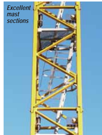
Excellent mast sections

instruction guide makes the building required very easy.