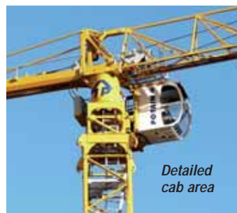
Detailed cab area

The operator's cab has opening doors and windscreen wipers on the windows. Electrical cabinets have realistic cabling which connects to the various motors and really enhances the quality feel of this model. The Potain MDT 178 has distinctive styling and the scale model copies this perfectly with the counter jib and counterweights being just like the original. The main jib is an excellent piece of model engineering being true and straight over its one metre length.