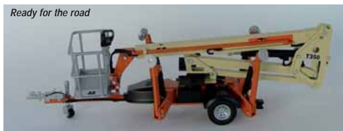
Ready for the road