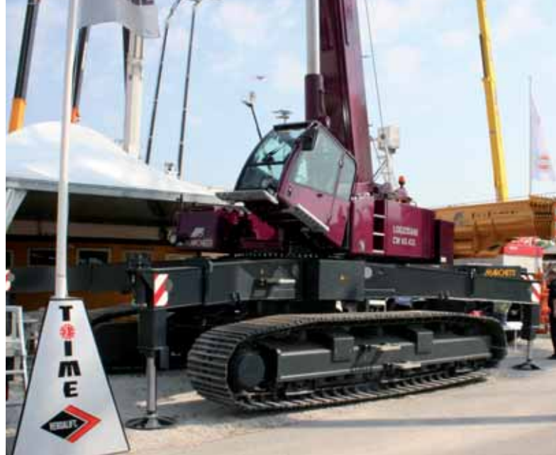
The 65 tonne capacity Marchetti Sherpa Logicrane has radial outriggers allowing self leveling.

One company that offers nothing else is US-based Mantis cranes which produces the Spandeck line up. While the company has looked at the European market a number of times, demand in North America is currently keeping the company's production facilities humming. Mantis takes a different approach with its cranes developing booms that can cope with side and shock loadings that would quickly ruin a regular telescopic lift crane boom. The company argues that with its heavy duty undercarriages its cranes are often used off-level, while pick and carry on uneven ground creates all sorts of dynamic loads that are transferred to the cranes boom and other components.