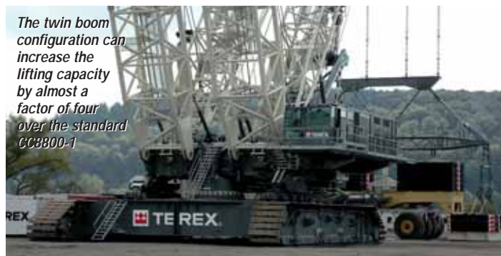
The twin boom configuration can increase the lifting capacity by almost a factor of four over the standard CC8800-1

Terex - Demag had in fact first had the twin boom idea in 1999 based on the CC2800, but it was too costly and the capacity too small.