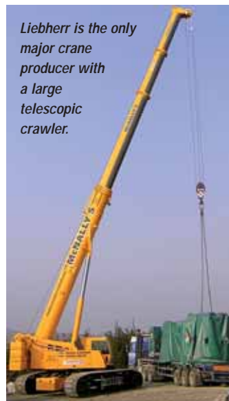
Liebherr is the only major crane producer with a large telescopic crawler.

offering that has changed little over that period - low overall operating weight, compact width and height dimensions, lifting capacities to about eight tonnes and a lift and carry facility that gives them a significant advantage over the growing mini spider crane sector.