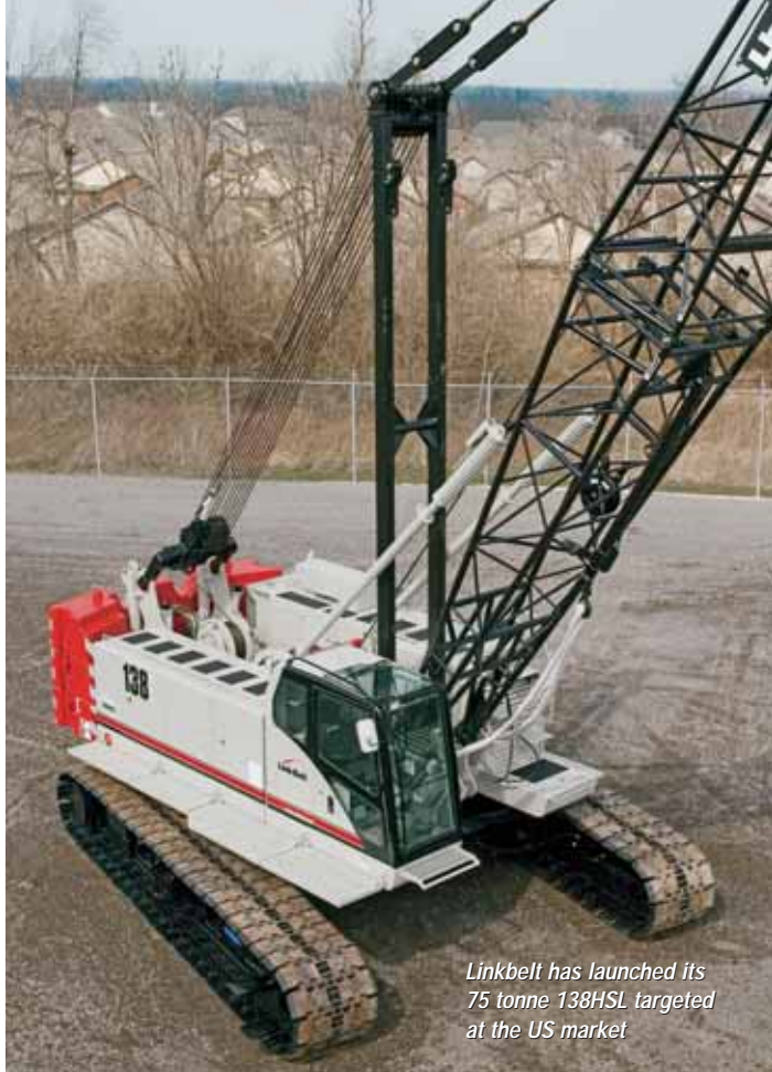
Linkbelt has launched its 75 tonne 138HSL targeted at the US market

Like many Chinese cranes, prices are competitive and delivery times are relatively short but quality and reliability are yet to be proven. However all Sany machines have Cummins engines and hydraulics system from either Rexroth or Kawasaki. The Sany marque looks set to become much more popular. It has already sold three excavators, three truck mounted concrete pumps and a trailer mounted concrete pump in the UK. Crowland Cranes is expecting a 70 tonne Zoomlion lattice boomed crawler crane which is currently being tested and modified for the European market. The company also says that a 200 tonne lattice crawler should arrive early next year. In the mean time, Crowland is building a new parts warehouse.