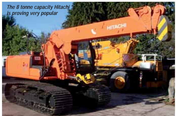
The 8 tonne capacity Hitachi is proving very popular

With a conservative quoted lifting capacity of eight tonnes, the Hitachi 160 LCT weighs nearly twice as much but has a footprint of only 2.49 metres wide by 3.9 metres long with an overall height of 2.9 metres and in the right conditions can lift and carry up to six tonnes.