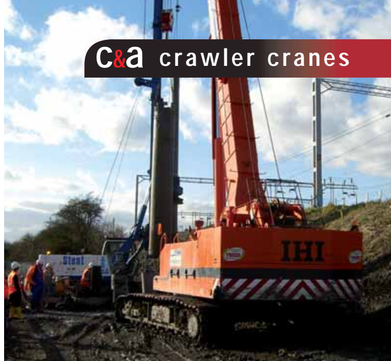
An IHI CCH500T working as a service crane lifting casings for a Stent piling rig working alongside the railway in Rugby. The unit was specified in order to mitigate the risk of the boom falling over the live line and has a slew restrictor fitted in order to stop the operator from inadvertently slewing over the railway.