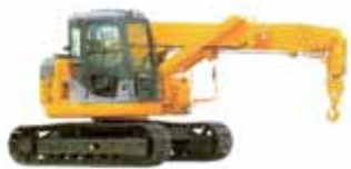
The Maeda LC1385M-2 has a 16 metre boom that can lift 2.6 tonnes to full height.

The introduction of two new Maeda machines including the larger capacity LC1385M-2, which may well have a seven or eight tonne rating at two metres - will help the supply problem a little but there is little else at the moment.