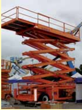
The worlds largest self propelled scissor lift, the Holland Lift G320 with 34 metre working height towered over most of the exhibits. Russon Access also showed a range of models from the Manitou line up.