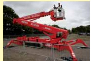
The granddaddy of all spider lifts though was found in the demo area where Ranger had the massive 50 metre working height Teupen Leo 50GT.