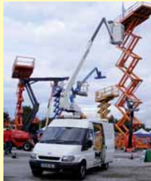
Another all new lift launched at Vertical Days came from Allan Access. The new van mount has more than 12 metres working height, 12 metres outreach and requires no outriggers yet has a cargo carrying capacity of 450kg.