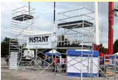
Instant-UpRight, the alloy tower producer used the show to unveil a completely new corporate identity and branding which included the new company name.