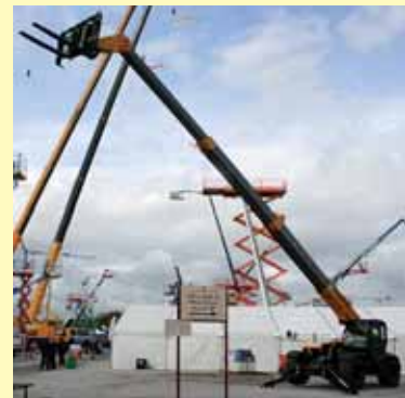
Haulotte had its new 14 metre telehandler on show. The new unit turned quite a few heads, although the preference was for the all black colour scheme seen at Bauma.