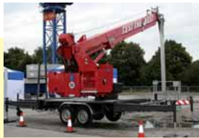
Power Lifting introduced the Bocker range of aluminium cranes. The AHK27/1200 was fitted out as a lift crane while the AHK31/1500 was set up as a 31 metre aerial work platform. The AK32/1500 truck mount was also on show equipped with both lifting and aerial platform options.