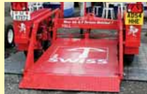
PLC power pads had a range of its nylon outrigger mats on show along with the Telefant hydraulically lowering trailer from Switzerland. The company shared its stand with Vanson cranes, which had one of its more compact self erecting tower cranes on display.