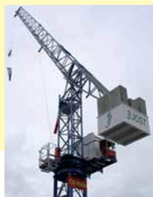
Jost distributor MTI launched the new Jost 68.4 flat top hydraulic luffing jib tower crane. The new crane has a 40 metre jib with a jib tip capacity of 1,500kg and a maximum lift capacity of four tonnes. The unit on show was sold to City Lifting.