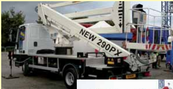
Skyking - the UK distributor for GSR and Wumag truck mounted lifts and Bluelift spider lifts - had a range of product including the 45 metre WT450 from Wumag in Wilson Access colours, a 29 metre GSR E290PX and Bluelift SA16 Compact.