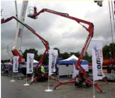
Another new spider lift was to be found on the Promax stand where the company had the new 15 metre Platform Basket 15.75. Designed to pass through a single door the company reported sales from the stand.