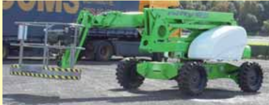
Niftylift showed off its new HR21 4x4 articulated boom lift which is now available with a bi-Energy power pack as well as its most popular models the 12 metre working height HR12 bi-energy and the T120 trailer lift.