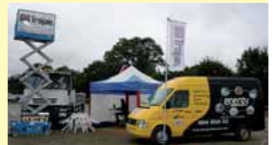
Energy Batteries unveiled the new maintenance free Trojan gel batteries for aerial lifts.