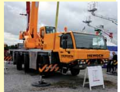
Tadano Faun showed three of its new All Terrain cranes, the 40 tonne ATF40G-2, the 50 tonne ATF50G-3 and the 90 tonne ATF90G-4 all of which were unveiled at Bauma and now beginning to ship.