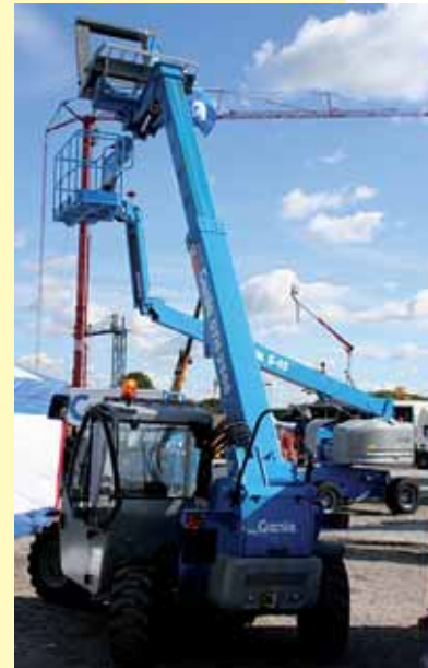
Genie showed its latest telehandler - the compact GTH 2506 with six metre lift height and 2,500kg lift capacity - along with a good selection from its aerial lift line.