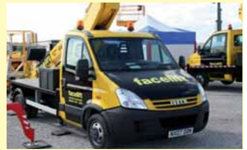
The Ascendant stand sported its all-new 17 metre lift on an Iveco chassis. This new British-built lift incorporates single side outriggers to provide excellent outreach in a small footprint.