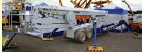
Facelift also had a 28 metre Falck Schmidt spider lift on its stand. Sold to Universal of London the machine can pass through a single doorway and then reach up into high atriums.