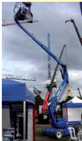
UpRight displayed its range of scissor lifts and several models from the Snorkel boom lift range all branded in UpRight blue. It also announced that IPS the UpRight distributor in the UK and APS the Snorkel distributor have reached an agreement to form a jointly held company to sell and support UpRight products in the UK.