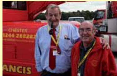
At the larger end of the market local crane rental company Bob Francis (left), showed several cranes including its new Grove GMK2025 and GMK5100.