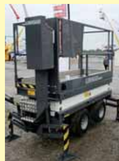
First time seen in the UK, Leguan's skid steer based scissor lift.