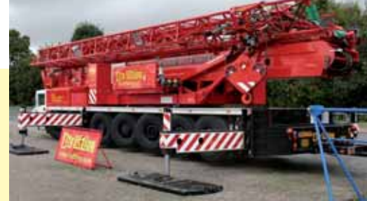
City Lifting showed off its brand new seven axle Spierings mobile self erecting tower crane. With a lifting capacity at height and long radius equal to a 300 tonne plus telescopic, the crane is ideally suited to congested city work. It also had one of its Comansa flat top city tower cranes on display. The unit offers a real alternative to folding self erectors.