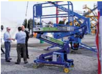
CTE and Planet Platforms launched the new Power Tower, the unique push around powered lift that uses a sigma type linkage to provide a five metre working height with 250kg lift capacity. CTE also showed its new CS179 spider lift and its 19 metre Z19 sigma linkage and telescopic boom truck mount. Planet also displayed the new TP9000 trailer mounted scissor lift.