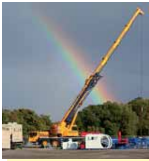
Local crane rental company Ainscough, not only showed off one of its new Liebherr cranes but also showed its easy set up safety nets for flat bed trucks and trailers. The device can be set in minutes and provides a safety net in case anyone should fall.