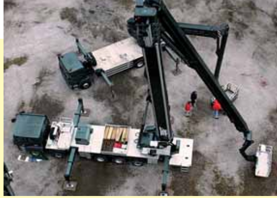
The UK's largest truck mounted lift the 90 metre Bronto S90HLA also made an appearance on the Thursday. Owned by Zenith platforms the machine was one of three large Bronto truck mounts on display.