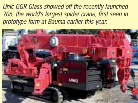
Unic GGR Glass showed off the recently launched 706, the world's largest spider crane, first seen in prototype form at Bauma earlier this year.