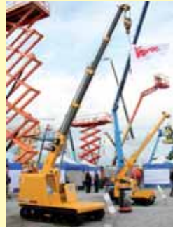
Compact crane specialist Valla cranes, had a selection of electric powered crawler pick and carry models for industry and public authority type work.