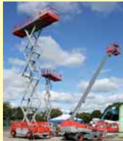
Skyjack used Vertikal Days to show off its new 45ft boom lifts. The new model. The SB45J offers excellent reach and rough terrain performance in a rugged and simple to maintain package.