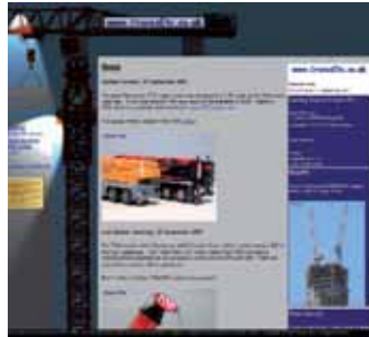
The Cranes Etc home page.

models with the clear emphasis on the 1:50 scale. Cranes and Access has reached an agreement with Cranes Etc to provide regular model reviews in these pages. The first is destined for the November/December issue when we will publish a review of the latest Conrad Liebherr LTM1070 in Mammoet colours.