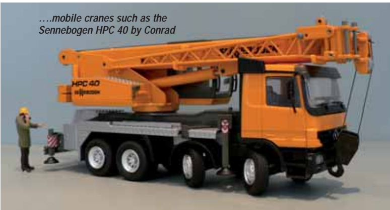
....mobile cranes such as the Sennebogen HPC 40 by Conrad

The website can be found on www.CranesEtc.co.uk .