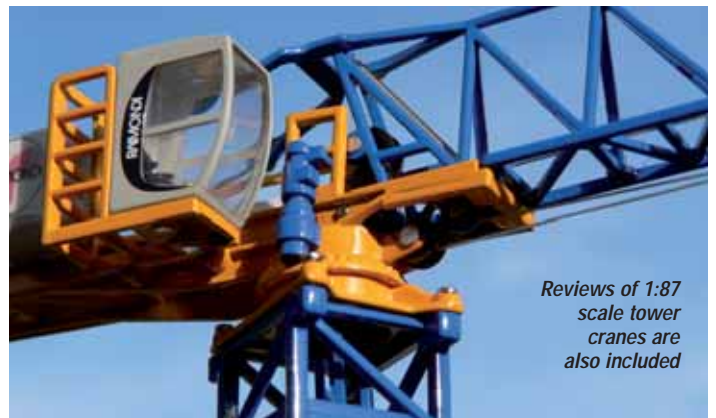
Reviews of 1:87 scale tower cranes are also included