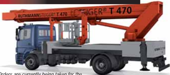
Orders are currently being taken for the new 47 metre Ruthmann T470 for delivery next Spring.

specifications for UK customers. Its latest machine is the 47 metre working height T470 - a replacement for the T450 - mounted on a two axle, 18 tonne GVW chassis which will make its debut at Intermat in Paris next year.