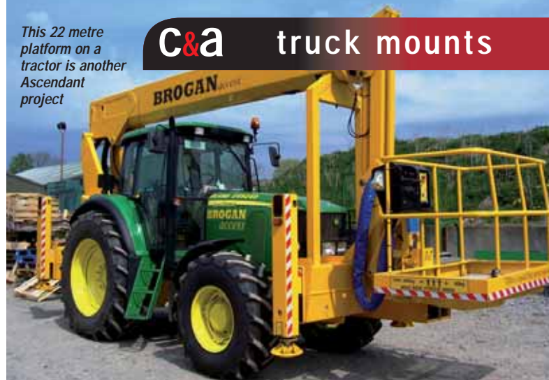
This 22 metre platform on a tractor is another Ascendant project