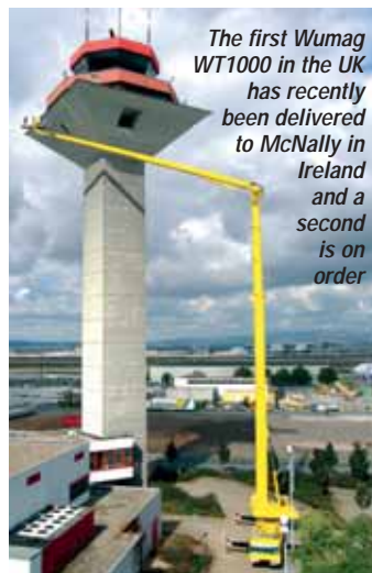
The first Wumag WT1000 in the UK has recently been delivered to McNally in Ireland and a second is on order