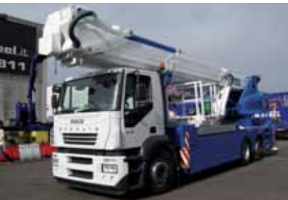
Oil&Steel is another Italian manufacturer with a large range of truck mounted platforms which includes the Eagle range.

Oil&Steel's 12 model Eagle range of truck mounted lifts runs from 26 metres up to 62 metres with plans to extend it upwards slightly, but there is no intention of venturing beyond the 75 metre level.