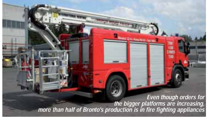
Even though orders for the bigger platforms are increasing, more than half of Bronto's production is in fire fighting appliances

The company says it plans to employ the same formula for success it has used for the past several years and will also consider 'strategic acquisitions and joint-venture possibilities' in the future.