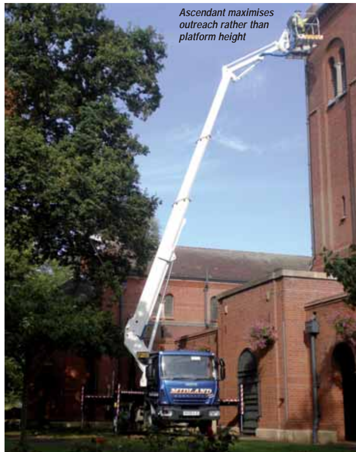
Ascendant maximises outreach rather than platform height

for the first time, two overhead cranes and lots of three-phase electric outlets, and it suits us down