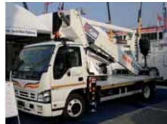
Launched at SAIE, the GSR E270PX has a working height of 26.5 metres and a 13.5 metre outreach.

"Over the past year, our 29 metre double articulated model has been a good seller and we generally have a good order book for this size of platform," said GSR director Stefan Weber. Italian manufacturers have been particularly strong in this market sector. At SAIE in November, several new models were launched on six tonne chassis - the cut-off point for self-drive truck mounted platforms - including the 26.5 metre working height, 13.5 metre outreach GSR E270PX; the Socage Cheyenne DA26 - offering 25.6 metres up and 13.4 metres out - and the CTE 26J - 26 metres up and 14 metres outreach with basket capacities of 220, 200 and 230kg respectively. In most cases the same units can be mounted on a 7.5 tonne chassis with more compact outrigger bases.