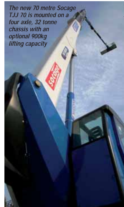
The new 70 metre Socage TJJ 70 is mounted on a four axle, 32 tonne chassis with an optional 900kg lifting capacity

Barin a company best known for its underbridge inspection platforms has a five model range truck mounted range with working heights from 44 to 90 metres. Its 90 metre AP90/34 J2 platform is based on a five axle chassis with a 280kg maximum capacity and basket width of 3.6 metres.