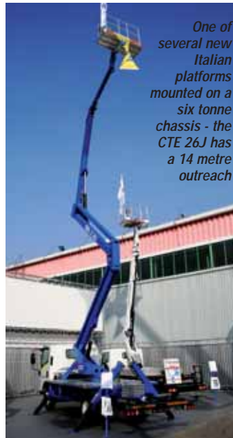
One of several new Italian platforms mounted on a six tonne chassis - the CTE 26J has a 14 metre outreach

In fact a mid-range machine with good outreach will most probably be able to carry out the vast majority of day-to-day access work in many regions. Because of this, manufacturers