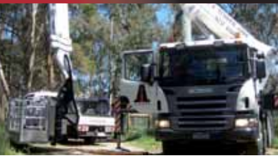
Barin has a range of truck mounted platforms from 44 to 90 metres. This is the 60 metre AP60.

Oil&Steel's 12 model Eagle range of truck mounted lifts runs from 26 metres up to 62 metres with plans to extend it upwards slightly, but there is no intention of venturing beyond the 75 metre level.