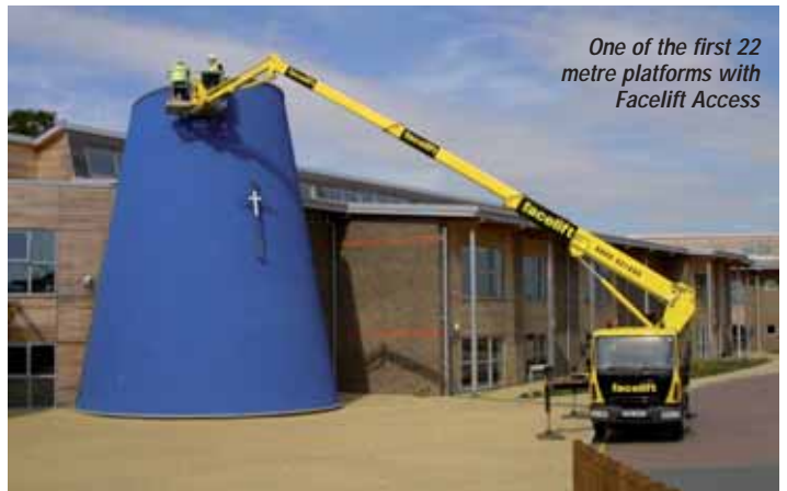
One of the first 22 metre platforms with Facelift Access