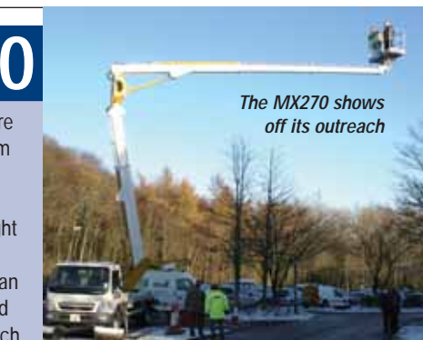
The MX270 shows off its outreach

"There are not too many competitors in the North East and this new platform will give us the capability to carry out work on many more projects."