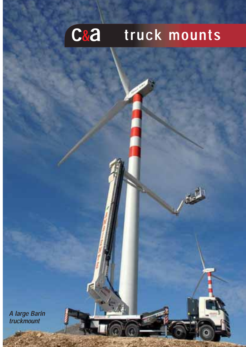
A large Barin truckmount

Wumag generated revenues of €28.2 million over the first nine months, with a net profit of €735,000. Bison was Palfinger's first acquisition in