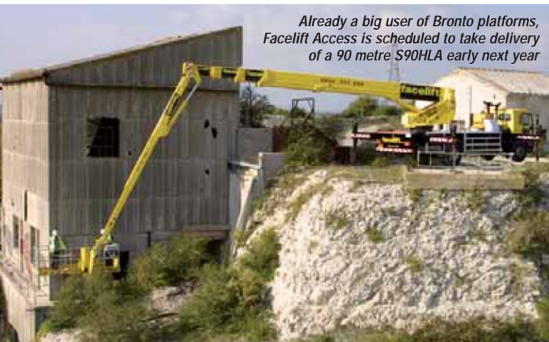
Already a big user of Bronto platforms, Facelift Access is scheduled to take delivery of a 90 metre S90HLA early next year

"The demand for precision-made aerial platforms and special transport vehicles will always remain strong," says Winkelmann. "Our goal is to enhance the existing market here in Germany and to make further market advances abroad."