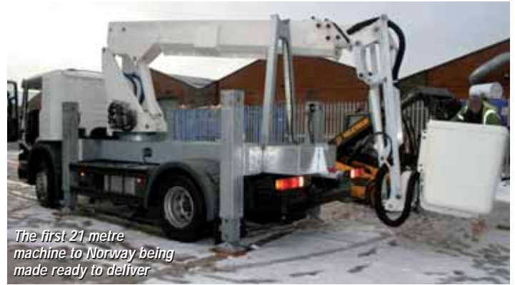
The first 21 metre machine to Norway being made ready to deliver

contractor asked for a platform that could work without jacks up to 16 metres over the back of the machine, Dean created the Ascendant 21. Mounted on a Scania P270 chassis, the fully galvanised unit has a straight boom capable of a maximum platform height of 21 metres. The unit has substantial vertical jacks which can self level on a slope of 12 degrees.