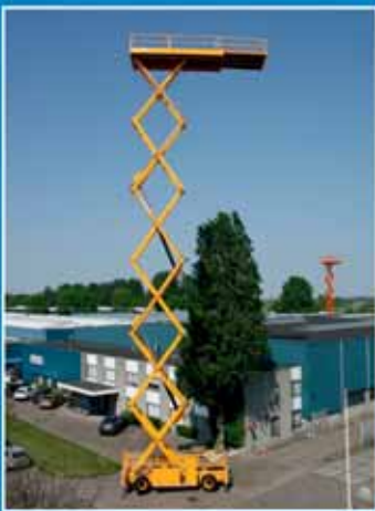
34 metre G-320DL30 4WDS/N

Solutions for difficult terrain, narrow spaces and extreme heights