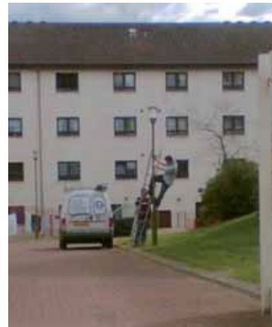
These tradesmen have some ladders but are still struggling to reach the lamp. Clearly some common sense training is required.