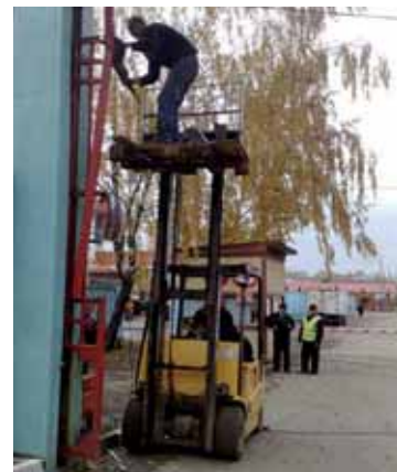
Way too many companies still turn to their forklift and a pallet to carry out work at height, and all too often an accident occurs - look at the observer with his Hi-Viz vest - talk about distorted priorities!