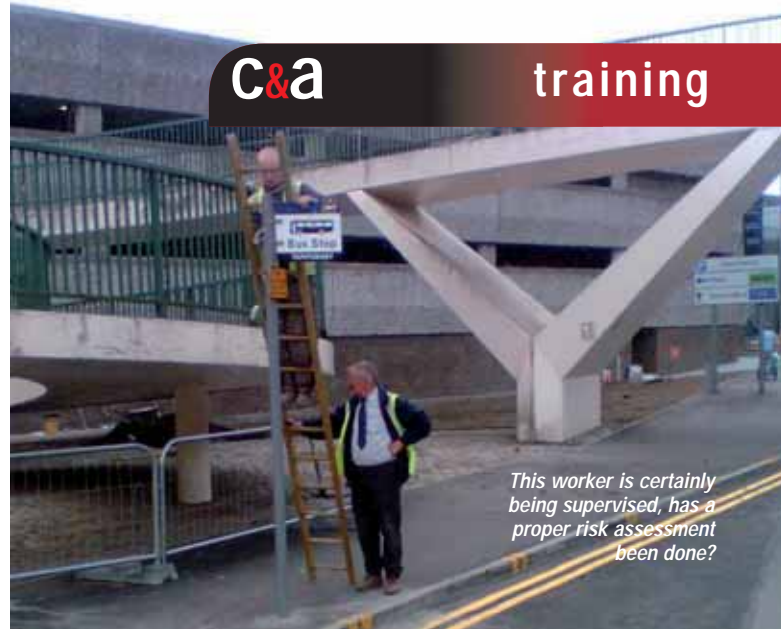
This worker is certainly being supervised, has a proper risk assessment been done?

Participants need a computer with internet access and a registered Genie account. The technician must score at least 80 percent to pass the final exam. A printable certificate of training is then provided for the successful completion of the course. A second online course on hydraulic theory is planned, followed by specific product courses. All online service training will be offered to customers free of charge.