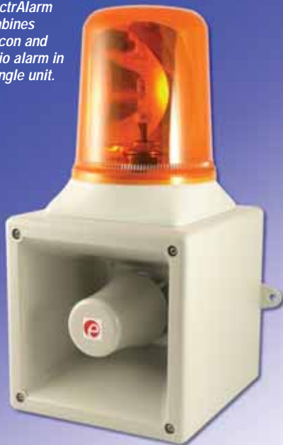
The SpectrAlarm combines beacon and audio alarm in a single unit.

The beacons on the Spectr AB121 for example comes with a choice of 15 Joule Xenon or rotating mirror beacons providing effective signalling in all conditions.