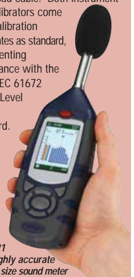
The CEL-621 is a highly accurate pocket size sound meter

enquiries → To contact any of these companies simply visit the 'Industry Links' section of www.vertical.net , where you will find direct links to the companies' web sites for up to five weeks after publication.