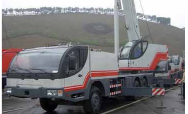
The Zoomlion QY30V

The 34 metre full power main boom can be extended with an eight metre fly jib.