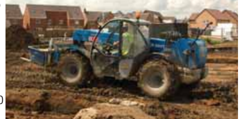
ACF has added 70 Genie telehandlers to its fleet

ACF the Burwell, Cambridgeshire-based telescopic handler rental company has ordered 70 Genie telehandlers - a mixture of compact six metre GTH-2506 and seven metre GTH-3007