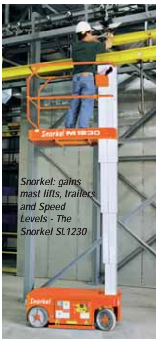
Snorkel: gains mast lifts, trailers and Speed Levels - The Snorkel SL1230

In the dollar orientated regions of the world Snorkel also gains 10 models from UpRight, including the TM12 (as the SL1230), Speed Levels, Mast booms, trailer lifts and the AB38 micro boom. Tanfield has a series of distributor and rental company meetings this month and will announce further details. In the UK UpRight is still talking to IPS the UpRight Distributor and APS, the Snorkel distributor regarding the future development of its UK market coverage.