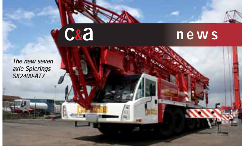
The new seven axle Spierings SK2400-AT7