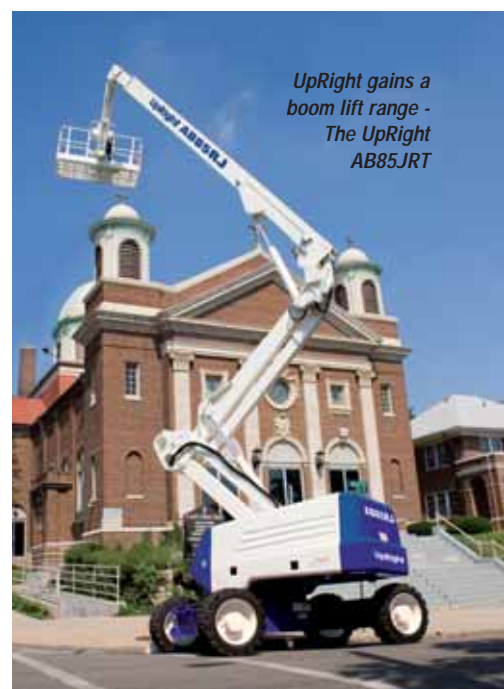
UpRight gains a boom lift range - The UpRight AB85JRT