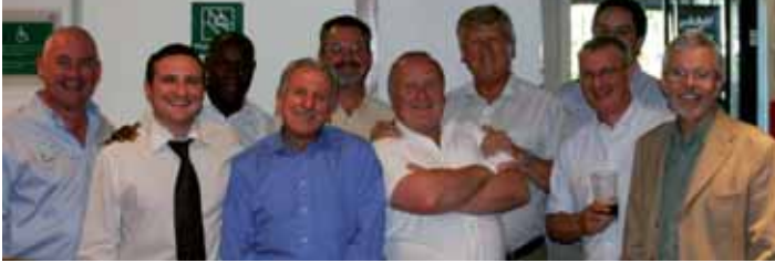
Members of the Access Link at the recent meeting at IPAF headquarters in August.