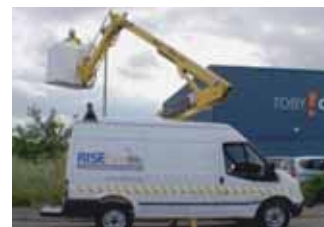
One of the new Versalift ET36NF van mounted lifts ordered by Rise Hire.

The 52 new Versalift van mounts include 12.9, 14.2 and 16.5 metre working height units mounted on Ford Transit and Iveco Daily chassis.