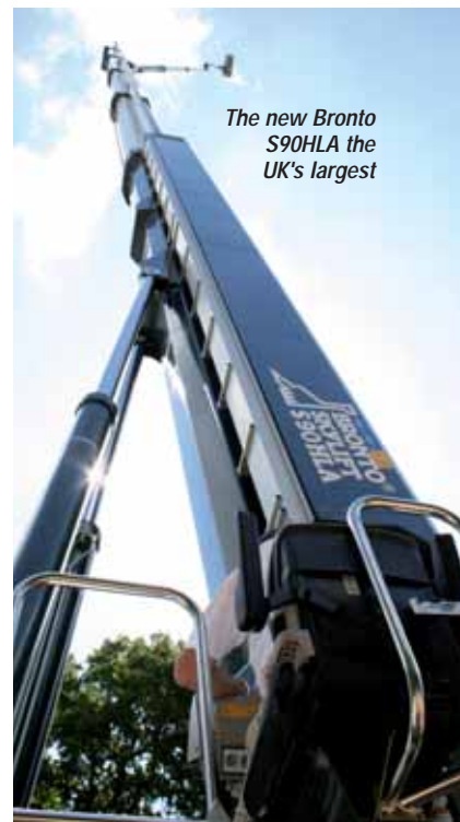
The new Bronto S90HLA the UK's largest