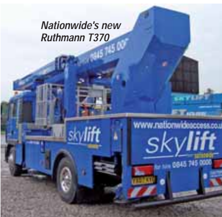
Nationwide's new Ruthmann T370