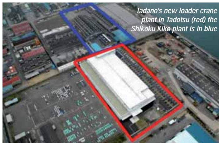
Tadano's new loader crane plant in Tadotsu (red) the Shikoku Kiko plant is in blue

The new plant is part of a major re-organisation and investment by Tadano that sees all construction/mobile crane production centred on the company's Shido plant and aerial work platforms at its Takamatsu facility. The overall aim of these changes is to boost mobile crane production by 50 percent.