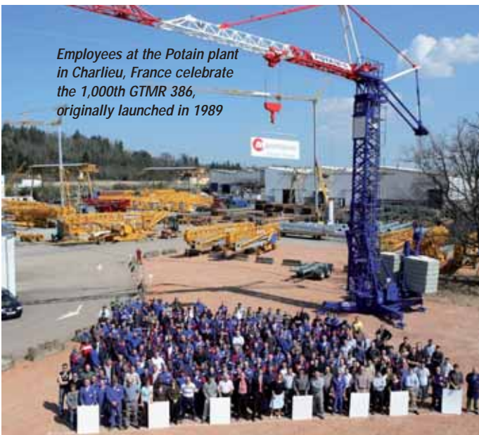
Employees at the Potain plant in Charlieu, France celebrate the 1,000th GTMR 386, originally launched in 1989