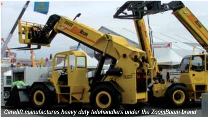
Carelift manufactures heavy duty telehandlers under the ZoomBoom brand

The current product range includes machines with 10 to 19 metre lift heights and lift capacities up to 14,500kg. The deal is a share purchase and is subject to ongoing due diligence. Skyjack announced that its plans to enter this market back in February.