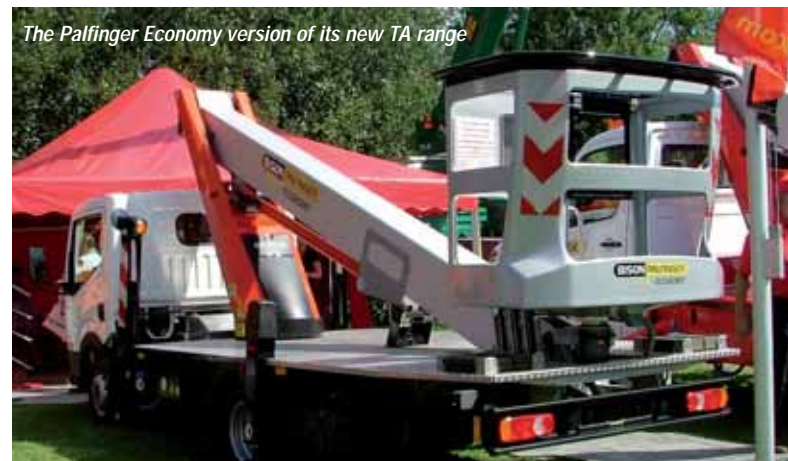
The Palfinger Economy version of its new TA range

those not wearing them were a very notable exception. Sadly two of the offenders were North American companies.