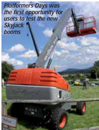
Platformers Days was the first opportunity for users to test the new Skyjack booms

The new boom will be available in October with two new electric scissor lifts following in February. Both are single door (80cm) models with six and eight metre platform heights and are modelled on American/European products. It is possible that these will be