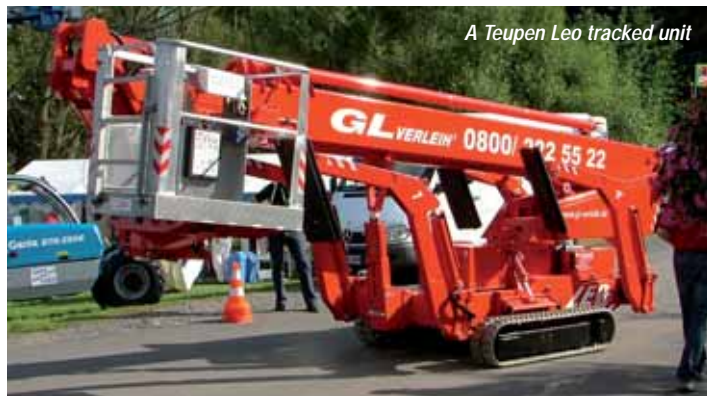
A Teupen Leo tracked unit

Palfinger showed the economy version of its new TA range on a 3.5 tonne chassis - the company launched the 'Business' version at Bauma. The Economy models are much simpler with smaller working envelopes. This is due to the fact