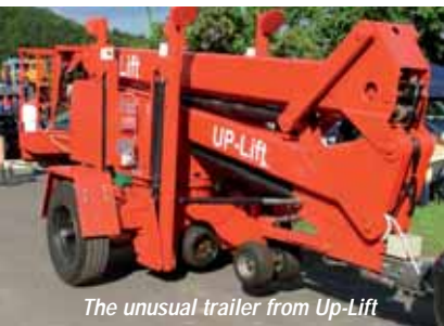
The unusual trailer from Up-Lift

The new boom will be available in October with two new electric scissor lifts following in February. Both are single door (80cm) models with six and eight metre platform heights and are modelled on American/European products. It is possible that these will be