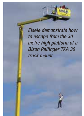
Eisele demonstrate how to escape from the 30 metre high platform of a Bison Palfinger TKA 30 truck mount

higher specification upper controls and a better choice of chassis. The Economy is fitted to Nissan or Renault chassis while the Business range can be mounted either to a Mercedes or VW.