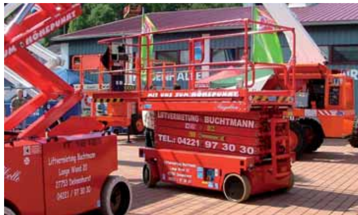
Iteco's 12151 indoor/outdoor electric scissor (L) and its 12122 indoor only model. Note the chassis differences.

For many it was also the first chance to put the new Skyjack SB45J boom lift through its paces. Sadly the dry weather did not allow it to really show off its 4x4 capability. Merlo had one of its MP30 road going self propelled booms on display, although it was a purely static display, so no chance to see this exciting new machine in action.