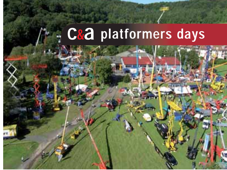
Platformers Days 2007

IPAF has certainly made an impact over the past 12 months and it is very evident that the Clunk Click campaign (Click Clack in Germany)