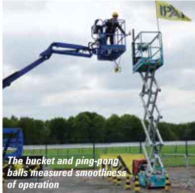
The bucket and ping-pong balls measured smoothness of operation

With a maximum of 45 points available, participants were tasked with manoeuvring a boom lift around a course with a water-filled bucket topped with 10 floating ping-pong balls attached beneath the boom's basket. The course included driving the machine over a set of timbers/humps and parking the machine between two cones before slewing the platform around to ring an elevated bell for 10 points. Reversing to the original starting position, participants then