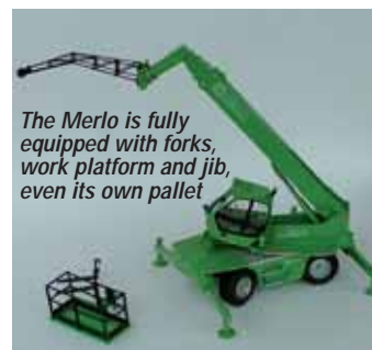
The Merlo is fully equipped with forks, work platform and jib, even its own pallet

The model also comes fully equipped, not only with the optional crane jib and work platform, but also