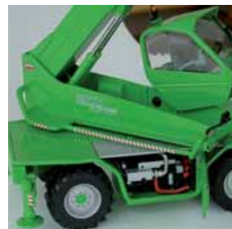
Attention to detail is excellent.

The model also comes fully equipped, not only with the optional crane jib and work platform, but also