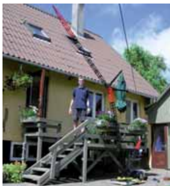
The AK850 fully erected with builder Anders Gaasedal

Since this is the heavy lift issue it seemed appropriate to look at models of big cranes. Spurred on by information provided by three of our readers we were very surprised to find three model enthusiasts around Europe that have built highly detailed scale models of the 1,200 tonne Gottwald AK912, lattice truck crane using standard Lego materials.