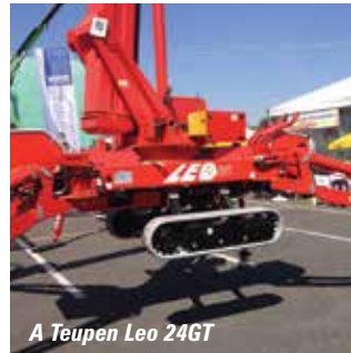
A Teupen Leo 24GT