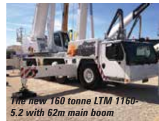
The new 160 tonne LTM 1160-5.2 with 62m main boom