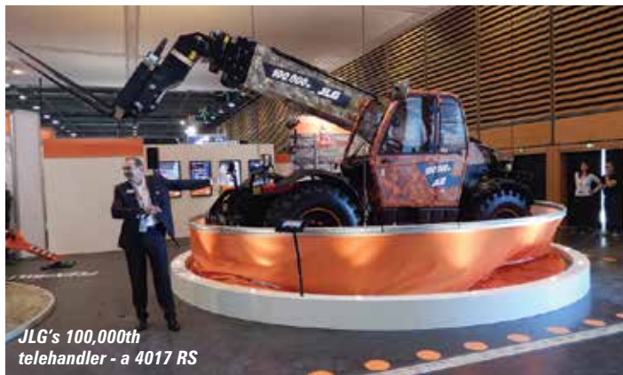
JLG's 100,000th telehandler - a 4017 RS

The new 700 metre/tonne 710 HC-L with 50 or 64 tonne maximum capacities has a new stacked counterweight and a slim tower system - see Tower cranes page 17. The first two cranes have been delivered and erected in downtown Manhattan.