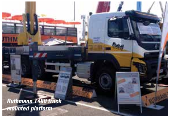
Ruthmann T480 truck mounted platform