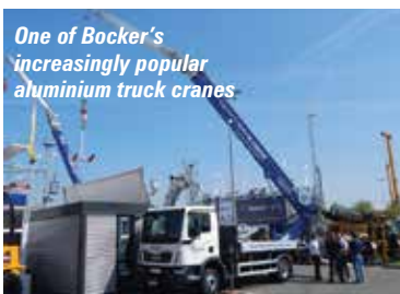
One of Bocker's increasingly popular aluminium truck cranes