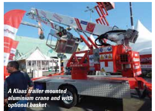
A Klaas trailer mounted aluminium crane and with optional basket