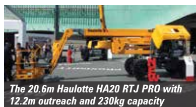
The 20.6m Haulotte HA20 RTJ PRO with 12.2m outreach and 230kg capacity