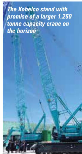
The Kobelco stand with promise of a larger 1,250 tonne capacity crane on the horizon