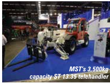
MST's 3,500kg capacity ST 13.35 telehandler