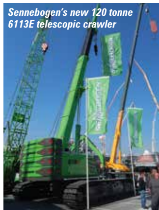
Sennebogen's new 120 tonne 6113E telescopic crawler