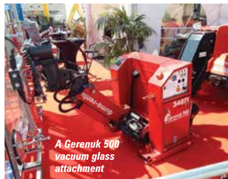
A Gerenuk 500 vacuum glass attachment