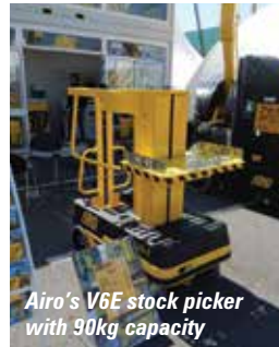
Airo's V6E stock picker with 90kg capacity