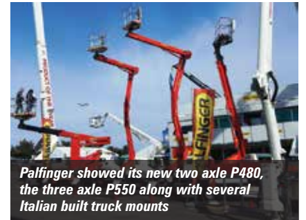
Palfinger showed its new two axle P480, the three axle P550 along with several Italian built truck mounts