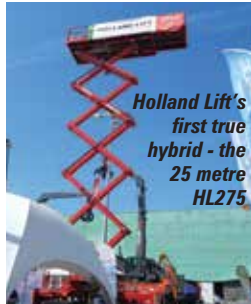
Holland Lift's first true hybrid - the 25 metre HL275