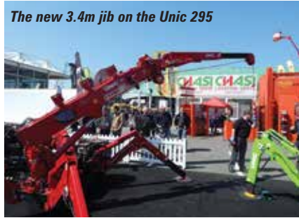
The new 3.4m jib on the Unic 295