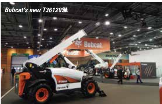
Bobcat's new T36120SL