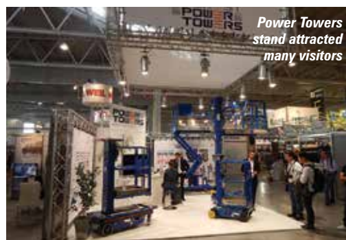
Power Towers stand attracted many visitors