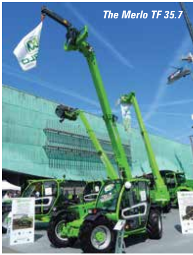
The Merlo TF 35.7