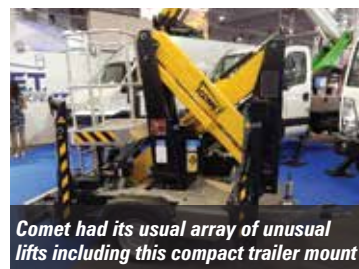
Comet had its usual array of unusual lifts including this compact trailer mount