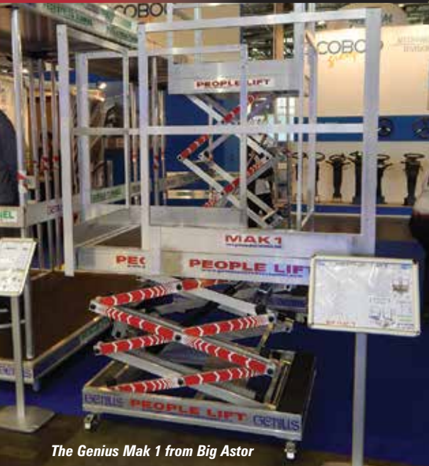
The Genius Mak 1 from Big Astor