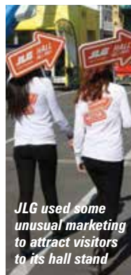
JLG used some unusual marketing to attract visitors to its hall stand