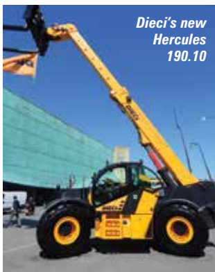
Dieci's new Hercules 190.10