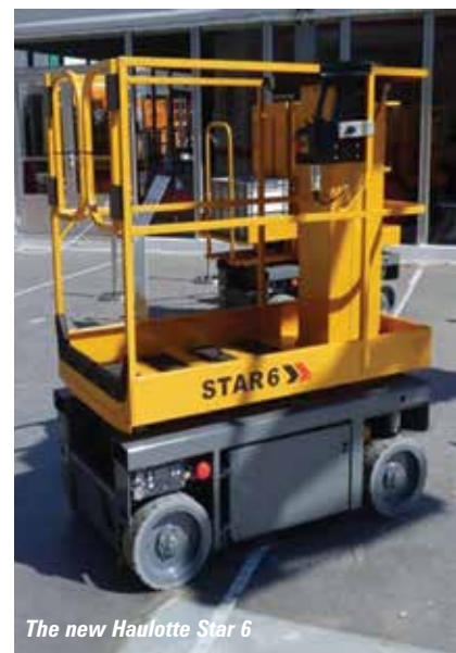
The new Haulotte Star 6

concept, but offers several new twists. A stock-picking version is also available.