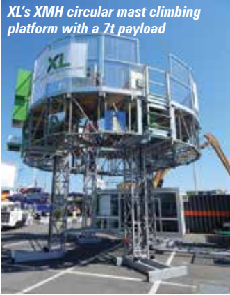
XL's XMH circular mast climbing platform with a 7t payload