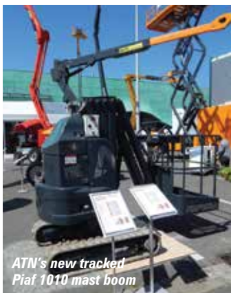
ATN's new tracked Piaf 1010 mast boom