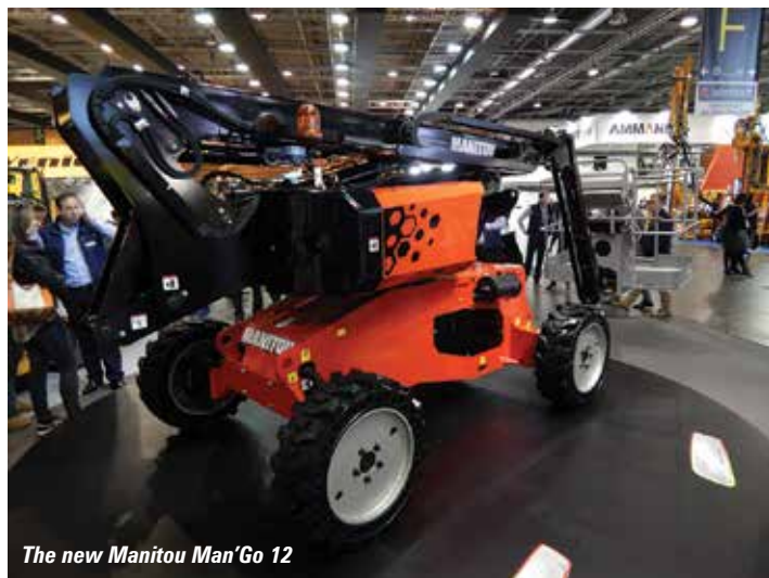
The new Manitou Man'Go 12

The Man'Go12 will also have to compete with the Niftylift HR 12 4x4, JLG 340 AJ as well as the ATN. It uses a chassis mounted Kubota diesel, and in a major departure for Manitou -hydraulic wheel motors rather than drive axles. Outreach is around 6.5 metres and platform capacity 230kg