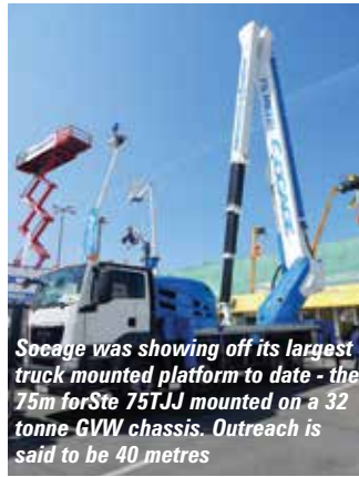
Socage was showing off its largest truck mounted platform to date - the 75m forSte 75TJJ mounted on a 32 tonne GVW chassis. Outreach is said to be 40 metres