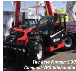
The new Farasin 9.30 Compact VPS telehandler