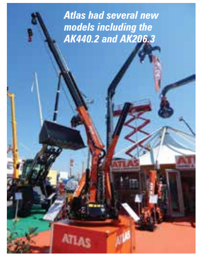
Atlas had several new models including the AK440.2 and AK206.3