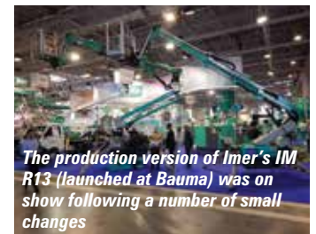
The production version of Imer's IM R13 (launched at Bauma) was on show following a number of small changes