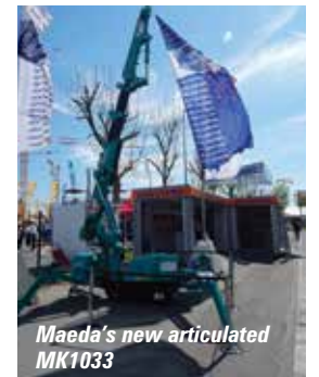
Maeda's new articulated MK1033