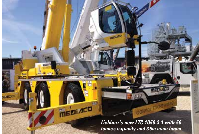
Liebherr's new LTC 1050-3.1 with 50 tonnes capacity and 36m main boom

In addition to unveiling its version of Hinowa's new 26 metre spider lift, the X26J Plus, JLG theatrically unveiled the 100,000th telehandler built since it acquired Gradall in 1999 and Skytrack and Lull in 2003. The anniversary model has been covered in 100,000 tiny JLG logos and will go on tour until October,