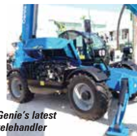
Genie's latest telehandler