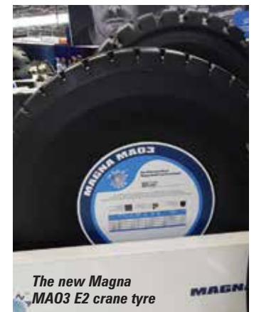
The new Magna MA03 E2 crane tyre