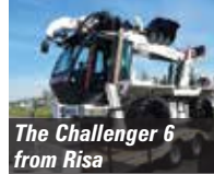
The Challenger 6 from Risa