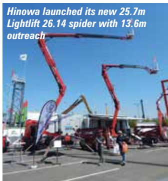
Hinowa launched its new 25.7m Lightlift 26.14 spider with 13.6m outreach