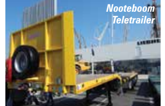
Nootboom Tele trailer