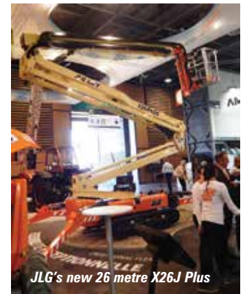
JLG's new 26 metre X26J Plus