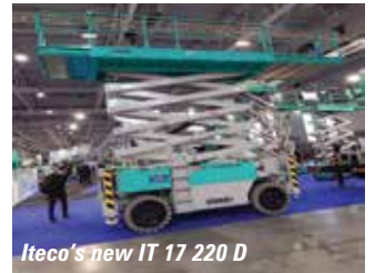
Iteco's new IT 17 220 D