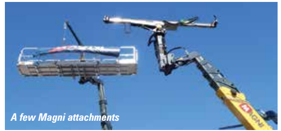
A few Magni attachments