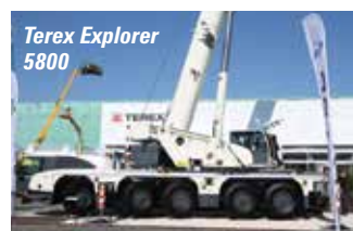
Terex Explorer 5800