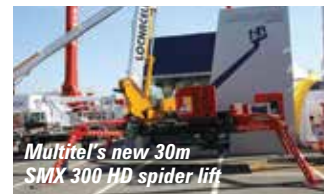
Multitel's new 30m SMX 300 HD spider lift