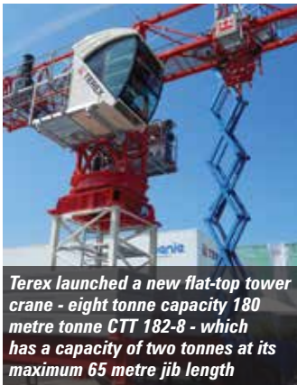
Terex launched a new flat-top tower crane - eight tonne capacity 180 metre tonne CTT 182-8 - which has a capacity of two tonnes at its maximum 65 metre jib length