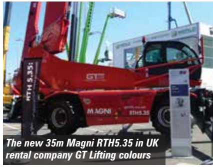
The new 35m Magni RTH5.35 in UK rental company GT Lifting colours