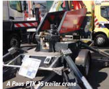
A Paus PTK 25 trailer crane