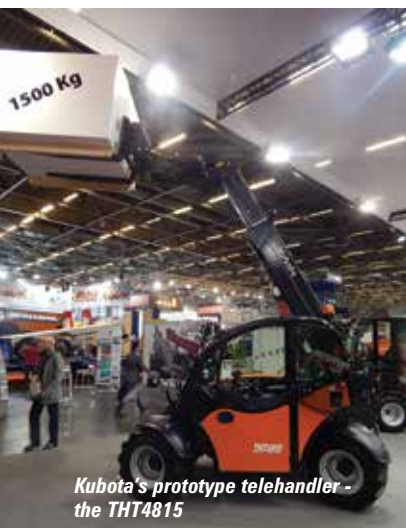
Kubota's prototype telehandler - the THT4815

A new telehandler prototype was tucked away on Kubota's indoor construction equipment stand - its first toe in this market. The machine on show - called the THT4815 - has a 4.8 metre lift height and a capacity of 1,500kg. It has hydrostatic transmission, four wheel drive and four wheel steer and weighs just under three tonnes. The plan is to make it lighter so that it can be transported on a standard two-axle equipment trailer.