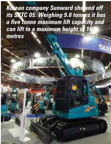
Korean company Sunward showed off its SYTC 05. Weighing 9.8 tonnes it has a five tonne maximum lift capacity and can lift to a maximum height of 16 metres