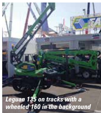
Leguan 135 on tracks with a wheeled 160 in the background