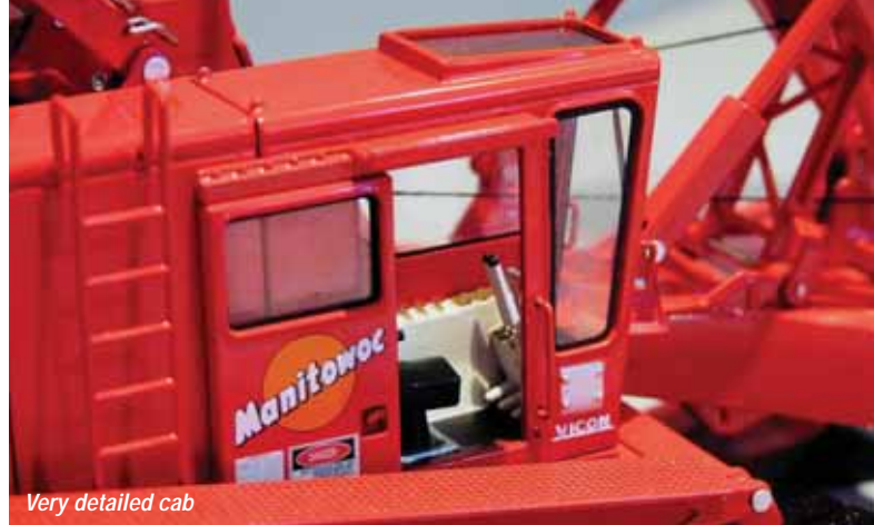
Very detailed cab

Turning to the booms, they are very well made with the main chord members cast to replicate the