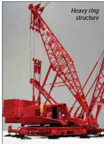
Heavy ring structure

To read the full review of this model visit www.cranesetc.co.uk