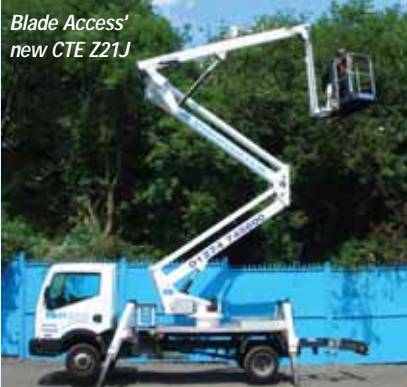
Blade Access' new CTE Z21J

Fast growing Yorkshire-based truck mounted aerial lift rental company Blade Access has added a 70 metre Wumag WT700 to its fleet, its biggest lift yet. The new lift was handed over at Vertikal Days and follows quickly on the heels of a 45 metre Wumag WT450, and a 53 metre WT530 delivered at the end of May.