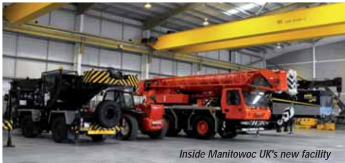
Inside Manitowoc UK's new facility

but rather due to the financial ratio impact of lower sales volumes and reduced profitability during these challenging economic times. The new agreement not only gives us the flexibility to manage our businesses during this downturn, but also enables us to strongly position the company to take full advantage of the next upturn."