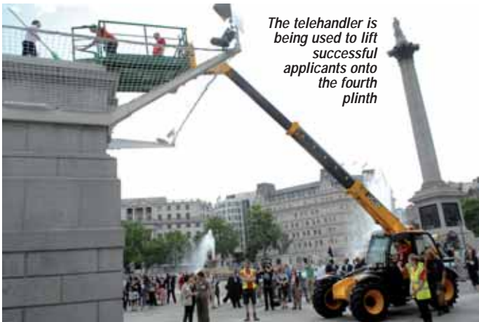
The telehandler is being used to lift successful applicants onto the fourth plinth

Gormley's 'One and Other' has so far attracted more than 15,000 applications from across the UK from people wanting to participate. All 2,400 participants are chosen randomly by computer and can do anything they want as long as it is legal. Registration via the website www.oneandother.co.uk is open until 1st September.