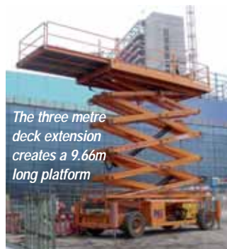
The three metre deck extension creates a 9.66m long platform

The platform - a 34 metre working height, Rough Terrain Megastar G-320 - went straight to work on the Media City project at Salford Quays in Manchester. The order included two, 22 metre and two, 34 metre Megastars. The G-320 features a 9.66 metre extended platform, 1,000 kg lift capacity and 35 percent gradeability.