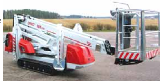
The new Dinolift 185XTC

The 185XTC uses the heavy duty XT dual parallelogram linkage from the company's wheeled self propelled models, while the spider outriggers are capable of lifting the machine up to a metre off the ground, for excellent levelling capability on slopes or rough ground, while also allowing it to self load onto a flat bed truck.