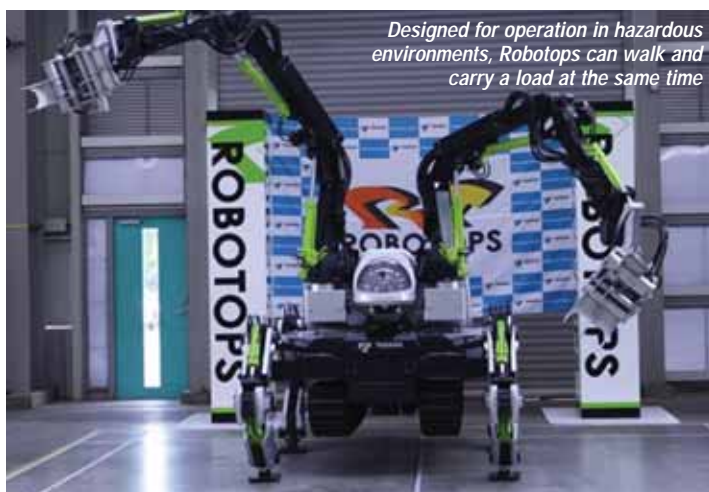
Designed for operation in hazardous environments, Robotops can walk and carry a load at the same time