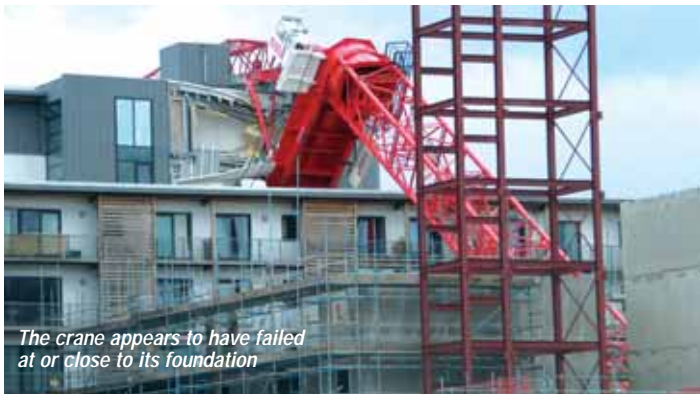
The crane appears to have failed at or close to its foundation