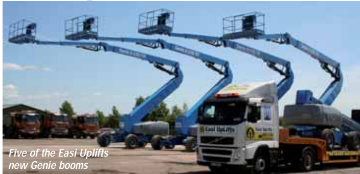
Five of the Easi Uplifts new Genie booms

Irish-based Easi Uplifts has placed an order with Genie that includes 10, 135ft Z135/70 self propelled articulated boom lifts.