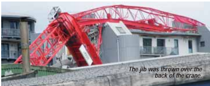
The jib was thrown over the back of the crane.

A luffing jib tower crane collapsed onto a block of flats in Chandler's Wharf, Liverpool, on July 6th. Although the crane's five tonne counterweight dropped from roof to basement, only the crane operator was injured and is reportedly in a stable condition.