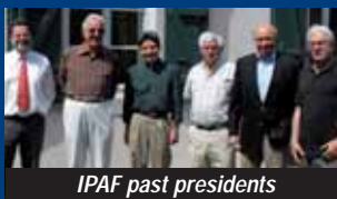
IPAF past presidents

• The second annual meeting of IPAF past presidents was held in Jurançon near Pau, France in mid June.