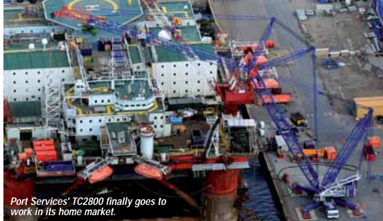
Port Services' TC2800 finally goes to work in its home market.