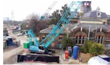
Q-Plant's new 135 tonne Kobelco CKE1350 at the Abbey Mills pumping station in East London.