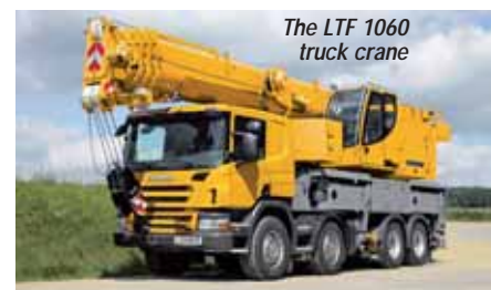
The LTF 1060 truck crane

More information and pictures from the 40th anniversary celebrations - including how to track the LTR 11200 over a six metre wide void - visit www.Vertikal.Net