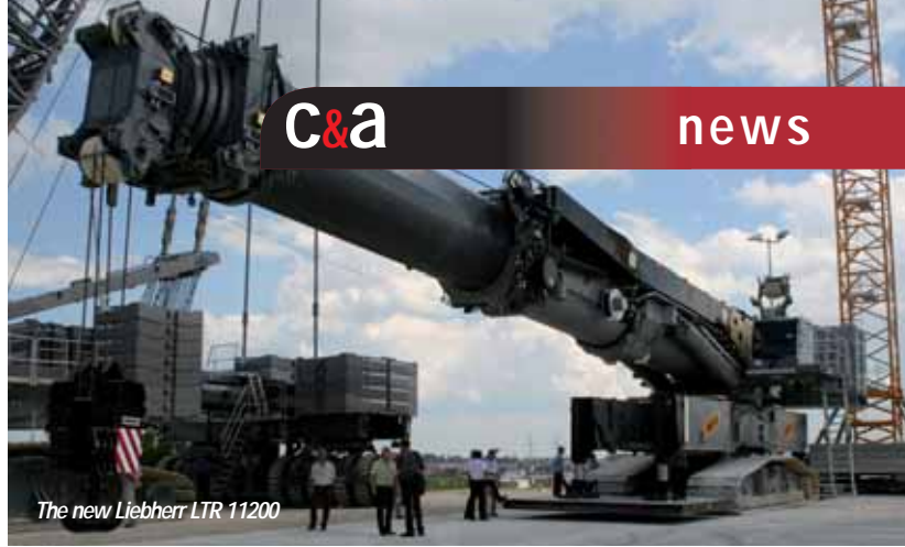
The new Liebherr LTR 11200