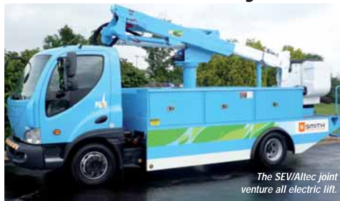
The SEV/Altec joint venture all electric lift.

Smith Electric Vehicles (SEV) of Kansas City, has teamed up with Altec to offer America's first all-electric utility truck and aerial lift. Unveiled at the Electric Utility Fleet Managers Conference in Williamsburg, Virginia, the truck is a battery powered Smith Newton 7.5 tonne truck produced by SEV in partnership with Tanfield's SEV UK, while the work platform - an insulated Altec AT37-G articulated telescopic boom - has a working height of 37.8 ft (11.5m) and an outreach of 28.3ft (8.5m).