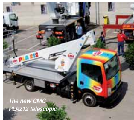
The new CMC PLA212 telescopic

CMC says that the compact outrigger base, 12 metre outreach PLA212 is a result of closer working co-operation between its engineering and sales teams, with feedback from its distributors and users.