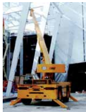
The Broderson IC80 has arrived in the UK.

Broderson, the Lenexa, Kansas-based pick and carry crane specialist, has appointed South-Yorkshire based Cranes UK to distribute and support its products in the UK and Ireland.