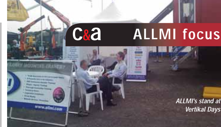
ALLMI's stand at Vertikal Days