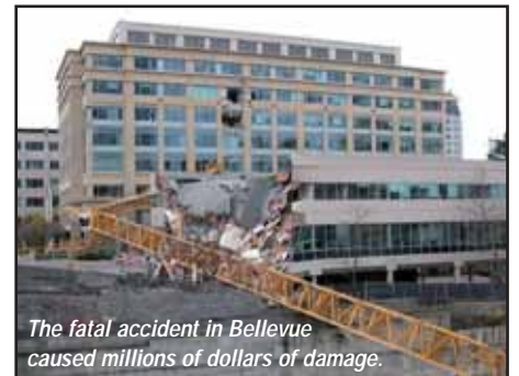
The fatal accident in Bellevue caused millions of dollars of damage.

The official report on the accident says that the cause was clearly related to the inadequate design of the H-shaped I-Beam base which had, it says, less than 30 percent of the required structural strength. (for the full report see vertical.net )