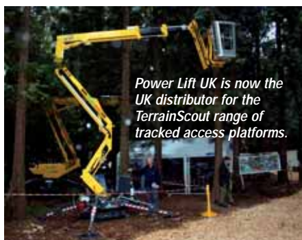
Power Lift UK is now the UK distributor for the TerrainScout range of tracked access platforms.

Power Lift UK has been appointed UK distributor for the Leader Jumper range of tracked access (spider lift) platforms marketed under the TerrainScout brand. Leader has three models in its range with working heights of between 14 and 18 metres.