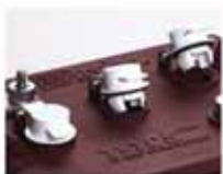
Convenient SureVent™ flip-top caps

Trojan's Plus Series offers the same premium performance you have come to expect from Trojan, plus the added features you asked for.