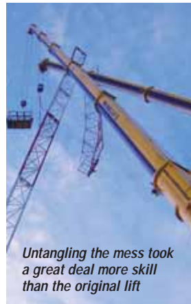
Untangling the mess took a great deal more skill than the original lift

a 250 tonner and a 100 tonne crane to the site. A detailed lift plan and method statement were drawn up and the jib was removed safely from the 500 tonner later that evening.