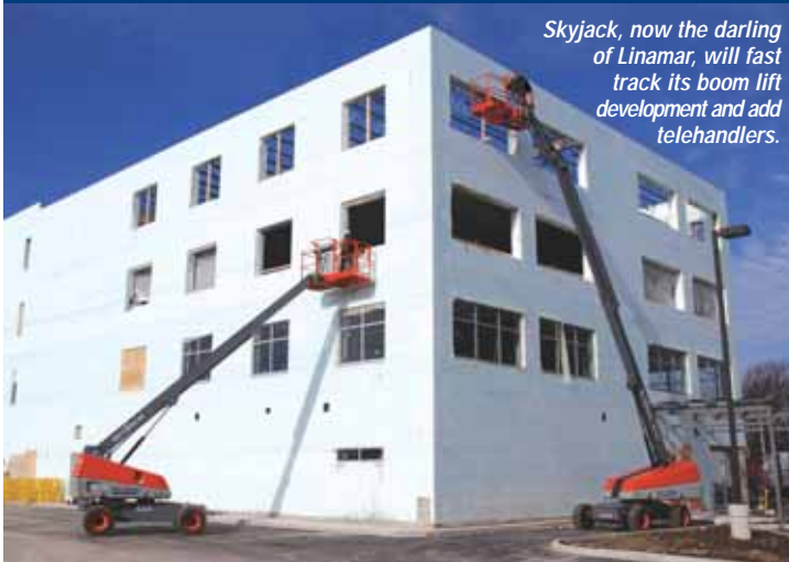
Skyjack, now the darling of Linamar, will fast track its boom lift development and add telehandlers.

Linamar has announced that it is spending C$24.79 million (£11.4 million) in research and development at its Skyjack division. The investment will fund the ongoing development of Skyjack's new boom lift line as well as an all new range of telescopic handlers.