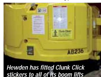
Hewden has fitted Clunk Click stickers to all of its boom lifts

The Platform Company, one of the first companies to promote the use of harnesses has also made the wearing of harnesses in its yards compulsory.