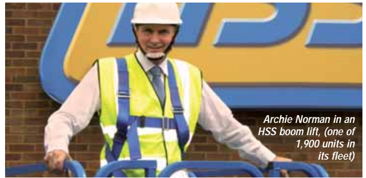
Archie Norman in an HSS boom lift, (one of 1,900 units in its fleet)