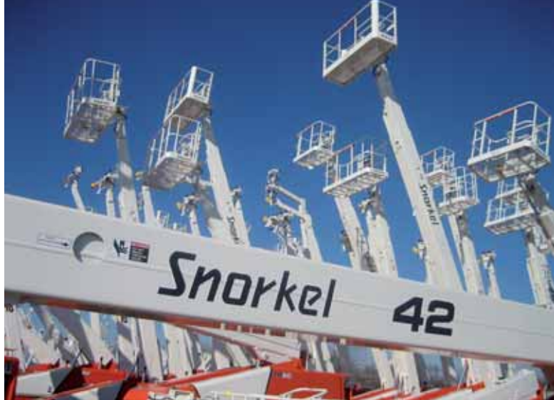
Snorkel brings a well respected boom line.

Tanfield has issued new equity in order to raise £115 million to cover the acquisition as well as covering the freehold of two Snorkel plants and fund the move of SEV electric vehicles into the North American market.