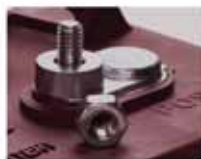
Durable embedded terminals