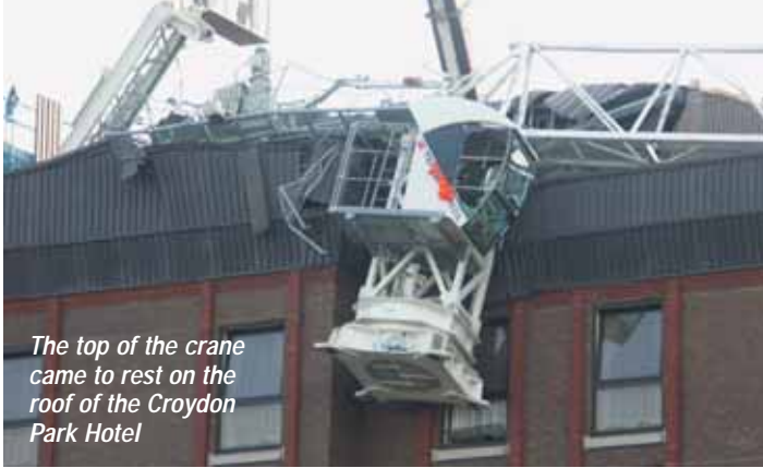
The top of the crane came to rest on the roof of the Croydon Park Hotel