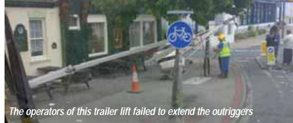
The operators of this trailer lift failed to extend the outriggers

Panther Platform Rentals, the Luton-based rental company now an independent part of the Lavendon group, has spent a further £12 million in new aerial lifts, including scissors from Skyjack, booms from Nifty and truck and track mounted lifts from Oil&Steel.