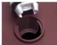
Precise maximum water level indicator