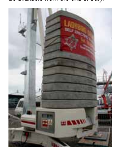
The CBR 32 Plus now features the controls within the ballast. Look out for the CBR26 Plus in July.

Distributor for Terex Comedil in the UK and Ireland, Ladybird Crane Hire showed the new CBR 32 Plus - the Plus indicating the control panel being integrated into the ballast. The CBR26 now has single or three phase power and 2,000kg maximum capacity with 800kg at 26 metres. The CBR 26 Plus will be available from the end of July.