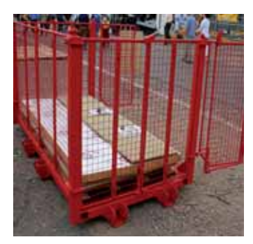
This novel sheet/materials handler (for crane or telehandler) was spotted on the Nethergate Developments stand.

roadwheels at their narrowest position and stabilisers removed, it can pass through a single doorway.