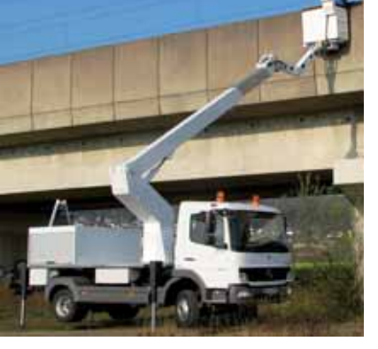
Mounted on a Merc 7.5 tonne chassis, the Esda TG1800 has an 18 metre working height narrow operational width.

New machines included: The Esda TG1800 mounted on a Mercedes Benz 7.5 tonne chassis with 18 metre telescopic boom, 180 degree rotating jib and 280kg lift capacity. Main features include vertical jacks and the ability to drive with the boom extended.