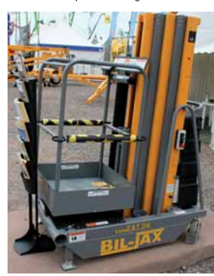
The Bil-Jax tomCat 24 is fully CE marked.

redevelopment areas where over-sailing adjacent airspace is a problem. The new crane can be mounted on a tower, used on its own feet at ground level, be bolted onto steelwork or on a rooftop base on the top of a building.