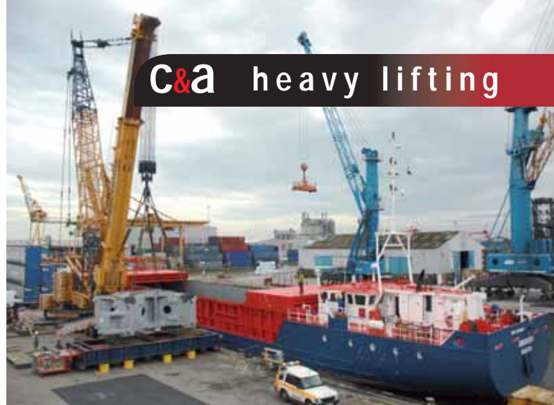
After transporting the 299 tonne steel casting from Sheffield, Colletts used its SPMT to reposition the casting alongside the ship destined for Germany.