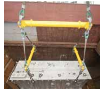
The DNV Approved 400 tonne Spreader System

Modulift also offers a spreader system manufactured to a design approved by DNV and witnessed by DNV surveyors throughout the fabrication process and proof load testing.