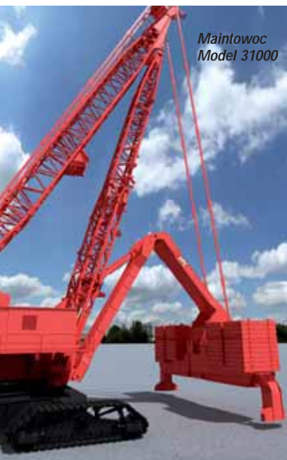
Manitowoc Model 31000

Following the tragic collapse of two of the largest 'bespoke' cranes in North America last year - the VersaCrane TC36000 owned by Deep South Crane and Rigging of Baton Rouge, Louisiana and a Lampson Translift working at the Black Thunder Mine in Wyoming - the initiative in the large capacity,