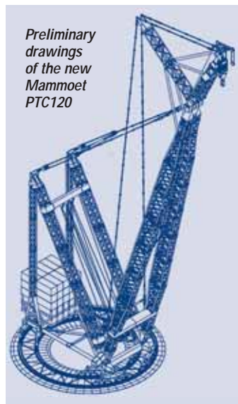
Preliminary drawings of the new Mammoet PTC120

Earlier this summer, Mammoet also unveiled plans for new mega lift cranes, this time a 100,000 tonne/metre plus version of its Platform ringer Twin boom Containerised (PTC) crane - the PTC120DS. A month or two later it followed it