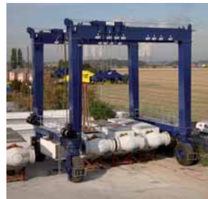
The company has recently taken delivery of a bespoke design Wise RTG/straddle carrier with a lift capacity of 110 tonnes.