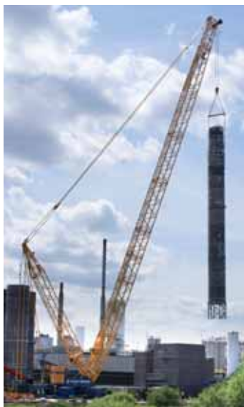
The Demag places the columns on top of the air separation facility