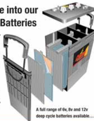
A full range of 6v, 8v and 12v deep cycle batteries available...

Manufactured to exact standards to deliver the longest runtime and battery life.