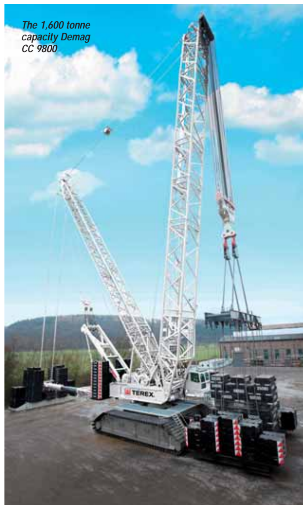
The 1,600 tonne capacity Demag CC 9800

eyes are now on the Dutch. Mammoet has been developing big lifting machines in partnership with offshore crane specialist Huisman since 1997. The last of its PTC ringer cranes was delivered in 2007. With the increasing demand for cranes to handle larger components, ALE Heavy Lift kicked off a new spurt in development unveiling its first machine - the