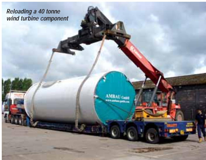
Reloading a 40 tonne wind turbine component

Collett has been in the general haulage and heavy transport industry for more than 40 years, during which time it has evolved