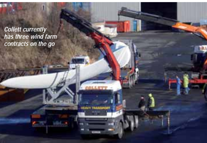
Collett currently has three wind farm contracts on the go

Collett also works regularly with international shipping companies and forwarders providing transport to and from heavy lift ships.