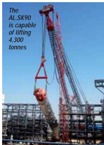
The AL.SK90 is capable of lifting 4,300 tonnes

alternative crane sector is clearly moving into the hands of ALE and Mammoet.