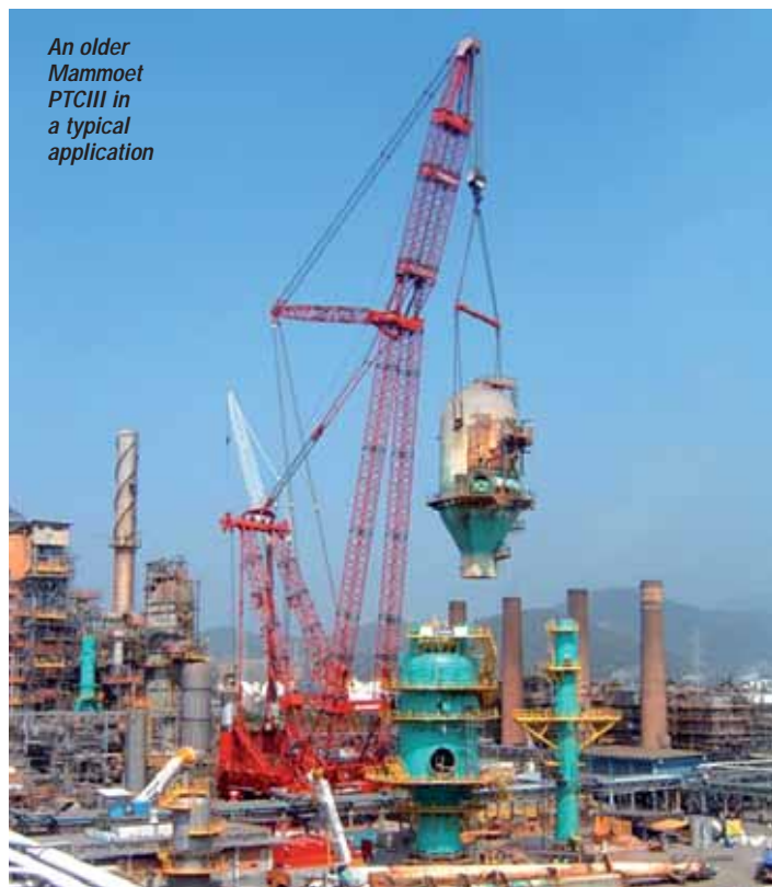
An older Mammoet PTCIII in a typical application

up with plans for a larger 160,000 tonne/metre version, the PTC160DS. The two cranes have the same boom and jib configuration, the same counterweight and the same winches. However the main difference is the footprint - the PTC160DS will have a 54.5 metre diameter ring, almost 10 metres larger than the 120. Maximum main boom is 130 metres plus a 43 metre jib.