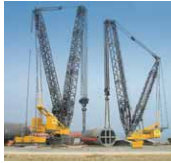
Currently Liebherr's largest - LR11350

With a little modification - basically widening the base - the crane's capacity can be increased to 5,000 tonnes, making it an AL.SK120. The