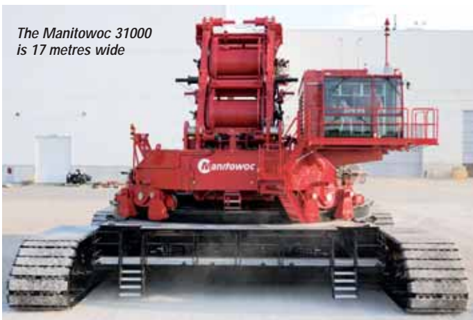
The Manitowoc 31000 is 17 metres wide

Manitowoc says that by keeping the load centre within the 17 by 20 metre footprint of its four tracks it will allow it to pick & carry its full rated chart as well as helping reduce the ground preparation required.