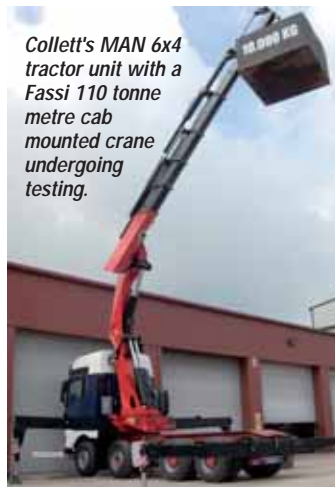
Collett's MAN 6x4 tractor unit with a Fassi 110 tonne metre cab mounted crane undergoing testing.