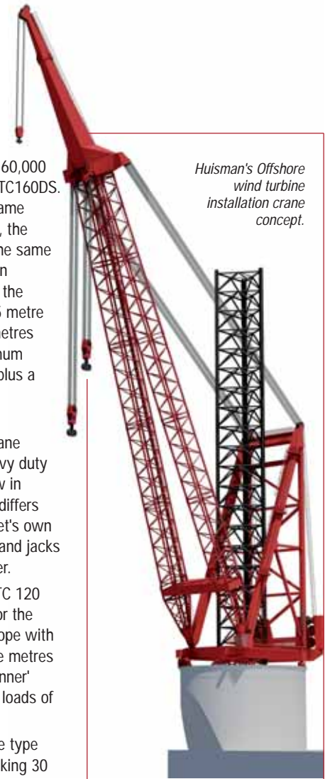
Huisman's Offshore wind turbine installation crane concept.

Although similar looking, comparing the ALE and Mammoet cranes is difficult given the fact that the ALE machines do not have a traditional slew ring, the company uses outreach - the distance from the heel pin of the boom - rather than radius as the principle measure in its load charts. However taking the centre point of rotation, maximum counterweight and maximum main boom as the key parameters provides a reasonably accurate comparison.