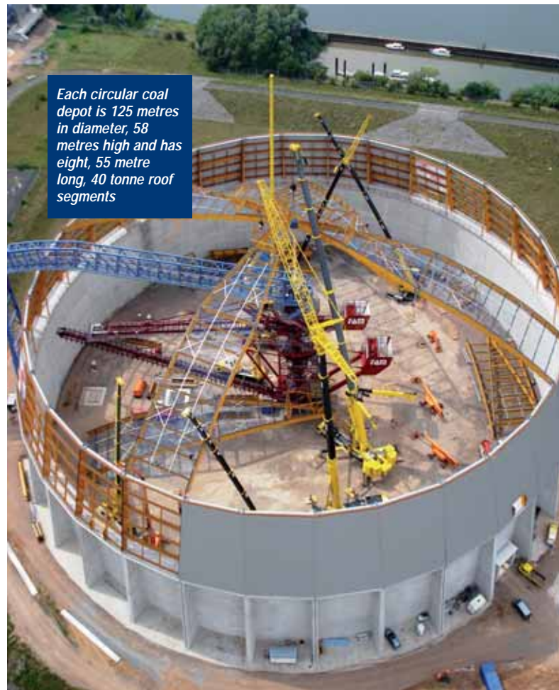
Each circular coal depot is 125 metres in diameter, 58 metres high and has eight, 55 metre long, 40 tonne roof segments