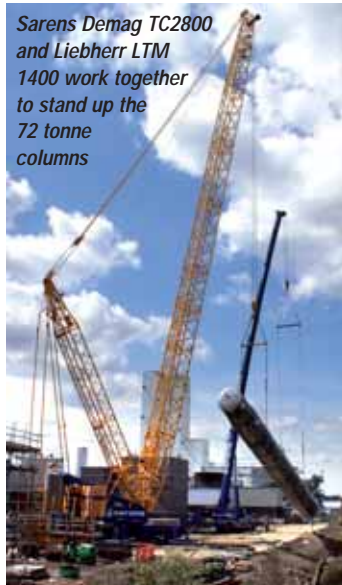
Sarens Demag TC2800 and Liebherr LTM 1400 work together to stand up the 72 tonne columns

Rigged with 90 metres main boom, its maximum 160 tonnes standard counterweight, 150 tonnes of Superlift ballast (300 tonnes maximum) and 10 metre by 10 metre outriggers, the Demag TC2800's first lifts involved lifting 56 tonne boxes. The more difficult lift involved the Liebherr LTM 1400 with 56.6 metre main boom and 100 tonnes of counterweight lifting columns weighing 71.83 tonnes onto the roof of the air separation building. The Demag TC2800 is Terex's only lattice boom truck crane and has the advantage of a reduced number of transport units compared to a similarly sized lattice boomed crawler crane. The basic crane with all drums and A frame is roadable within 12 tonne axle loads. Its outrigger base of up to 14 metres gives good lifting capacities and maximum boom length up to 180 metres.