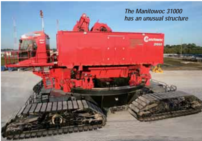
The Manitowoc 31000 has an unusual structure

The largest crane ever built by Manitowoc is a step closer to completion with the base of the crane being shown off at a recent open day at its Wisconsin plant.