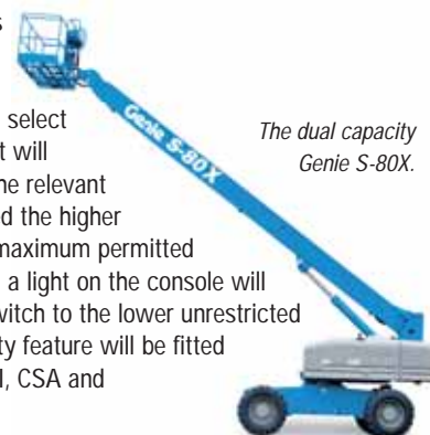
The dual capacity Genie S-80X.

The maximum number of occupants in the platform has also been increased to three. The units will have an additional control switch to select the required capacity before the unit will operate, which automatically sets the relevant working envelope. If, having selected the higher capacity, the operator reaches the maximum permitted outreach, the machine will stop and a light on the console will flash. To continue he will have to switch to the lower unrestricted capacity or retract. The dual capacity feature will be fitted as standard on models built to ANSI, CSA and Australian standards.