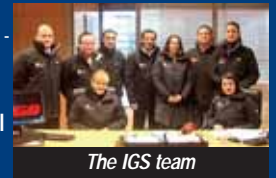
The IGS team

Independent Parts & Service - (IPS) has formed a partnership with Icari Global Solutions (IGS) in Spain and Portugal.