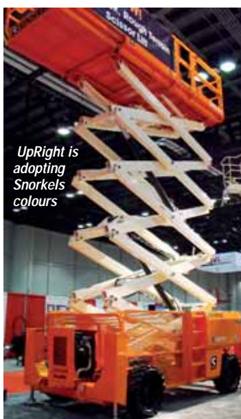
UpRight is adopting Snorkels colours

UpRight Powered Access is to drop the blue livery that it has used for more than 25 years, in favour of the orange and white livery used by Snorkel in order to mark the adoption of a global product range. Since acquiring UpRight in 2006 and Snorkel in 2007, the Tanfield Group has kept the two as distinct brands. While the colours are changing the UpRight name will remain...at least for now. UpRight started producing machines in the new colours this month and will complete the transformation by the end of April.