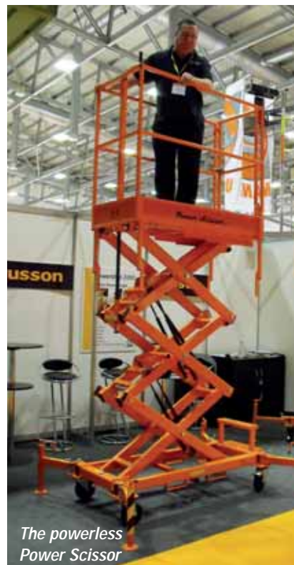
The powerless Power Scissor

Russon Access has launched two brand new non powered platforms - a push around scissor lift and an extendable step platform - neither requires batteries, hydraulics or an external power source. The scissor lift, interestingly dubbed the Power Scissor, weighs less than 300kg, offers a platform height of up to three metres, has indoor and outdoor ratings and is fitted with a set of short, swing-out outriggers to level the unit and provide additional stability. The platform is elevated by gas springs with final control by a simple hand crank. Tests have been carried out using a power drill for elevation and descent. Price for a multiple order is expected to be in the region of £2,700 and is targeted as an alternative to a scaffold tower.