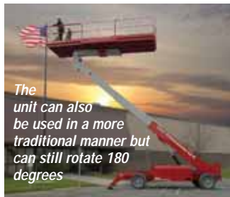
The unit can also be used in a more traditional manner but can still rotate 180 degrees

The unusual machine combines a scissor type chassis and platform with a three section telescopic boom and heavy jib that runs under the platform - mounting to the centre of the platform via a slew ring. Weighing 10.9 tonnes, the unit is powered by a Kubota diesel with four wheel drive, four wheel steer and automatic frame and stabiliser levelling. The platform can travel up and down the jib via a rack and pinion drive, rotates a full 180 degrees and is approved for up to four people plus more than 1,350 kg of material.