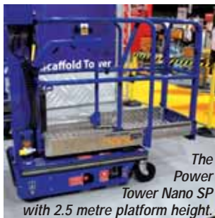
The Power Tower Nano SP with 2.5 metre platform height.

Ian Rollins of Lavendon said: "The original Power Tower has been an unqualified success and is our most sought after model. Our customers are now asking us for smaller footprint machines without sacrificing platform size."