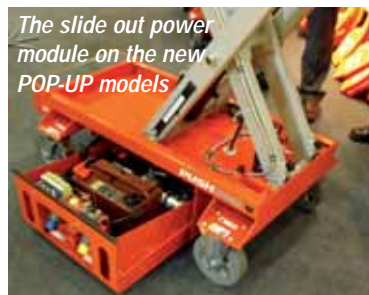
The slide out power module on the new POP-UP models

The fit and finish on the new models is a substantial leap forward with wiring to the platform routed inside stainless steel ducting, slide out power module with Trojan deep cycle battery, large non-marking castors and automatic braking on elevation.