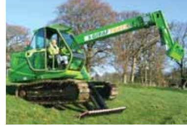
The Giraf Track with optional V blade slope levelling and anchoring system.

Chesterfield-based Ranger Equipment has been appointed UK and Ireland distributor for Giraf Track crawler-mounted boom lifts. Based on a Caterpillar excavator undercarriage and a Merlo 16 metre telescopic boom, the Giraf has a choice of customised platforms.