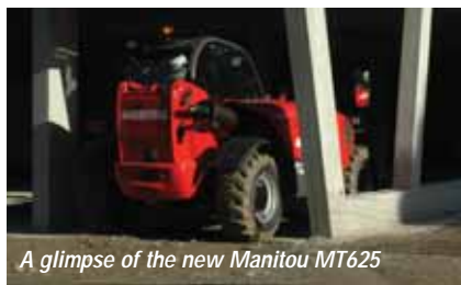
A glimpse of the new Manitou MT625

Manitou is keeping details of its new compact telehandler close to its chest until its launch at Bauma. The 2,500 kg capacity MT625 will have a 5.85 metre lift height, side mounted Kubota engine, two-speed hydrostatic transmission and will replace the current MT620 at the bottom of the MT range.