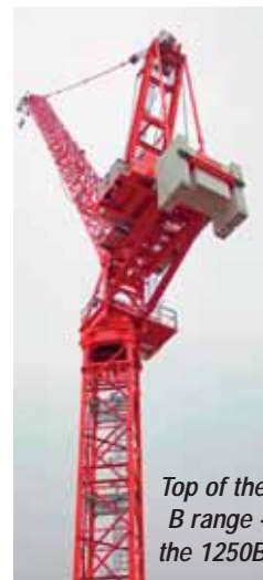
Top of the B range - the 1250B

Both incorporate the technology and features first seen on the 355 B including the innovative counterweight design and lighter weight components for easier transportation and erection. One of the cranes will be displayed on the new system 23 compact tower which can be shipped in a standard container and incorporates higher strength steel and redesigned connection points. It offers a free standing height of 112 metres for cranes up to 700 metre/tonnes and includes a new climbing frame.