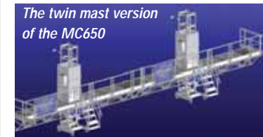
The twin mast version of the MC650

German hoist, aluminium crane and aerial lift manufacturer Böcker is entering the mast climber market, launching its Maxi-Climber product range at Bauma in April. The new mast-climbing system will use