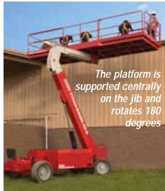
The platform is supported centrally on the jib and rotates 180 degrees

MEC has finally unveiled its new 40ft mega platform boom lift, dubbed the Titan Boom 40-S. The unit was demonstrated in Orlando during the ARA as part of a travelling road show. The company says the new boom combines the strengths of three machines, with the capacity of a telehandler at 1,800kg, the platform of a large heavy duty scissor lift at 6.7 x 2.28 metres and the reach and rotation of a boom lift.