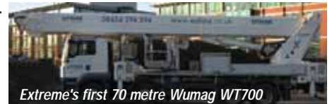
Extreme's first 70 metre Wumag WT700

UK-based Extreme Access Hire has ordered a second 70 metre Wumag WT700 for delivery in May.