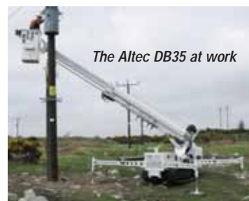
The Altec DB35 at work

Jason Seddon of Aerial Platforms said: "We are continually looking for new and innovative products. The versatility of the Altec DB35 ensures our customers can reduce manual handling, overall cost and the number of machines on site."