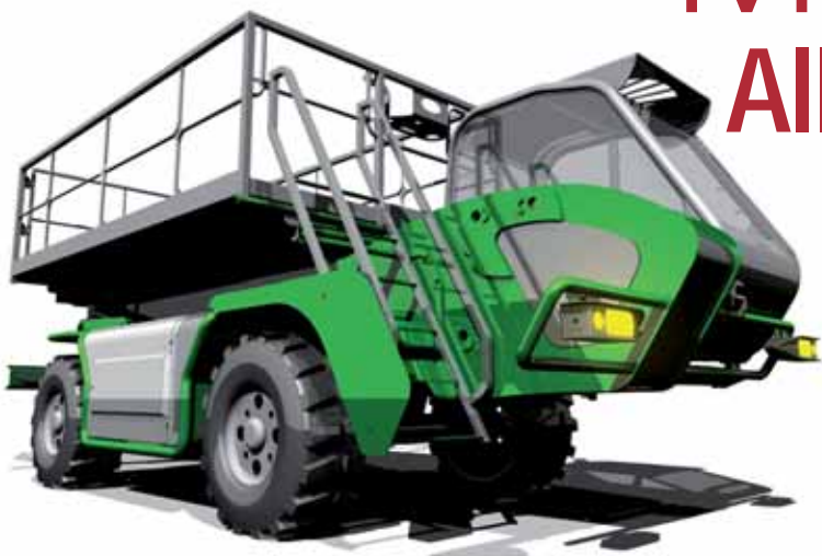
Merlo is launching a new All Terrain aerial lift.

Italian telehandler manufacturer Merlo says it will unveil a host of new products and concepts at Bauma in April including a new All Terrain aerial lift; a 14 metre spider lift; a heavy duty, fixed frame telehandler and a higher capacity Roto telehandler.