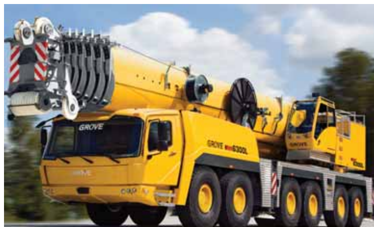
The Grove GMK6300L

A bi-fold swingaway adds 29 metres of height for a 112 metre maximum tip height, offset is up to 40 degrees and capacity on the fully extended swingaway with boom fully extended is 3.3 tonnes.