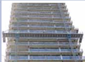
Two MBP02/150 mastclimbers were used, first on the long façades and then the ends. Platforms are 23 metres long with two metre wrap around cantilevers

Italian manufacturer Maber won the contract to supply the equipment, which consisted of a large dual mast MB C 3500/120 mastclimbing transport platform with three metre by five metre loading platform, capable of lifting up to 3,000kg. The company says that the platform saved at least one tower crane and avoided the need for landing platforms on each of the 25 floors.