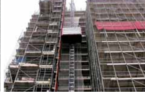
The West elevation material and passenger hoist runs from the basement to the 16th floor