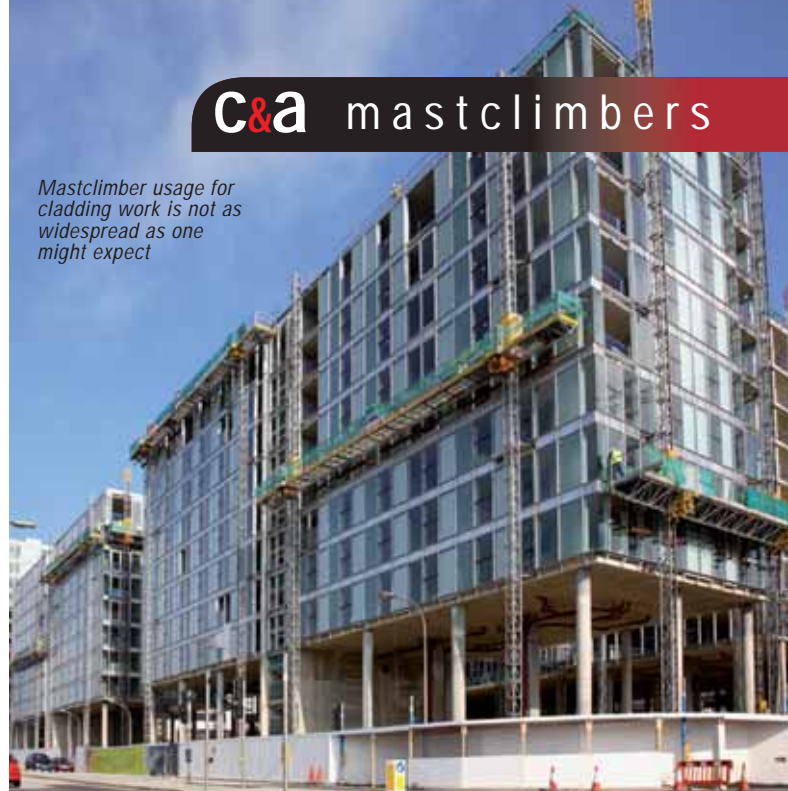
Mastclimber usage for cladding work is not as widespread as one might expect

level and a basement level below. All of the shortlisted painting contractors quoted for the work with a full façade scaffold itemised separately at £22,500 and above.