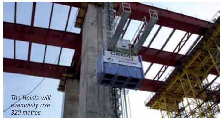
The Hoists will eventually rise 320 metres