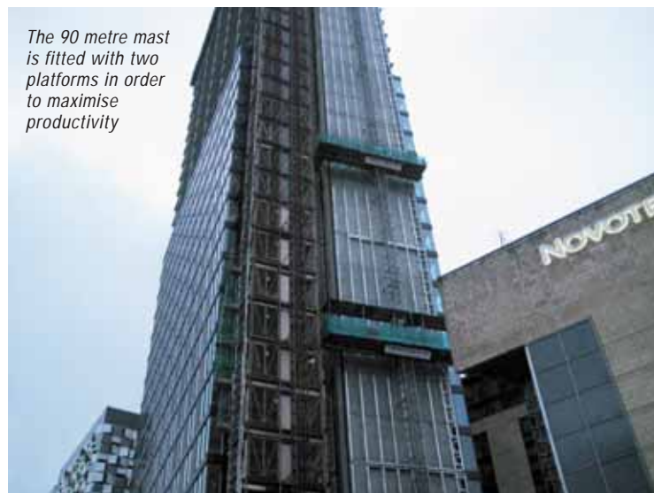
The 90 metre mast is fitted with two platforms in order to maximise productivity

A 90 metre high single mast dual platform mastclimbing work platform has proved ideal for all façade works on a 32 storey new build structure in Sheffield, England. City Lofts is located in St Paul's and will be the tallest tower in Sheffield, designed specifically as an iconic landmark for the city centre. When completed it will incorporate some 22,000 square feet/2,100 square metres of retail and restaurant space, as well as 316 one and two bedroom apartments, set in two interlinking 12 and 32 storey towers.