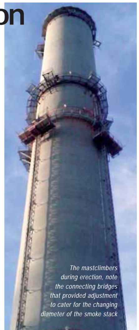
The mastclimbers during erection, note the connecting bridges that provided adjustment to cater for the changing diameter of the smoke stack