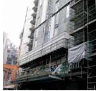
A single mast 40 metre high mastclimber runs from the first floor, leaving the ground floor unobstructed.

On another part of the building a 26 metre high twin mast mastclimber