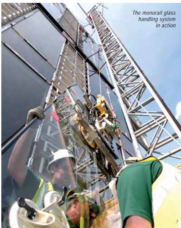
The monorail glass handling system in action

"The combination of the monorail with the mast-climbing work platform helped us get early completion of the building envelope and improve productivity by up to 300 percent. The system itself is far quicker to install than traditional scaffolding, in this case it took only about a week to install, whereas scaffolding would have taken three or even four weeks."