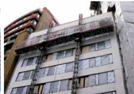
The twin mast, 26 metre high mast climbing work platform is being used for cladding and rendering.

was provided along with a single mast, 40 metre high mastclimber to the Harbet Road elevation. The mast on this unit runs from a first floor cantilever deck, leaving street level unobstructed. The two mastclimbers provide access for