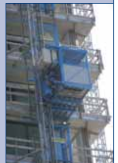
The MBA1400-R passenger and material hoist with 25 landings

Finally two twin mast MB P 02/150 mastclimbers with 23 metre platforms plus two metre wrap around extensions on each end, were chosen for the regular façade work such as the installation of window frames and glass panels. The mastclimbers were initially set up to cover two sides and then relocated to the ends.