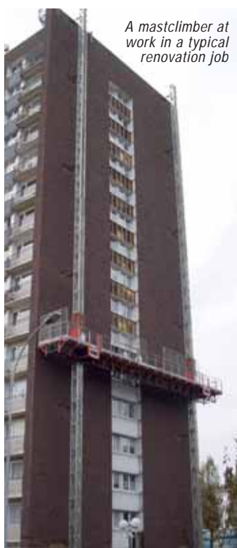
A mastclimber at work in a typical renovation job

Take the recent case involved the repainting the windows and some minor façade repairs on a historic five story Georgian apartment building in the UK. The façades included four floors above street