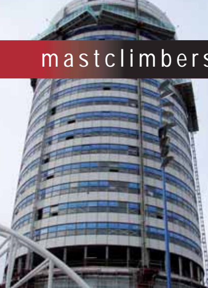
Mastclimbers can be adapted to fit all manner of shapes.

Mastclimbers are also considerably safer to erect - something that safety authorities are increasingly focusing on and are faster and less expensive to put up. At night and weekends the platform can be disabled to prevent potential intruders climbing it to reach upper floors and finally it is less prone to wind damage. Every year in every country there are numerous cases of large expanses of façade scaffold collapsing into the street in the face of strong winds.