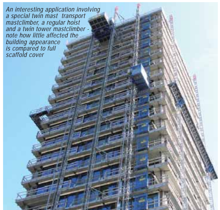
An interesting application involving a special twin mast transport mastclimber, a regular hoist and a twin tower mastclimber - note how little affected the building appearance is compared to full scaffold cover

The fact is that particularly for larger jobs, mastclimbers can dramatically reduce the cost of the job while offering other benefits such as being aesthetically more attractive during the contract, reducing the amount of climbing to the work zone, greater levels of safety and can save the rental of a separate hoist.