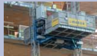
The MBC3500 transport platform offers a 3mx5m lift platform with 3,000kg capacity.

Maber also supplied an MB A 1400/150 - R single mast passenger and materials hoist with 1,400kg lift capacity, although it was selected for its 60 metres per minute hoist speed. The system was installed with a sophisticated call system and landings on each of the 25 floors.