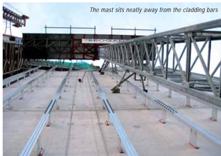
The mast sits neatly away from the cladding bars

A 90 metre high single mast dual platform mastclimbing work platform has proved ideal for all façade works on a 32 storey new build structure in Sheffield, England. City Lofts is located in St Paul's and will be the tallest tower in Sheffield, designed specifically as an iconic landmark for the city centre. When completed it will incorporate some 22,000 square feet/2,100 square metres of retail and restaurant space, as well as 316 one and two bedroom apartments, set in two interlinking 12 and 32 storey towers.