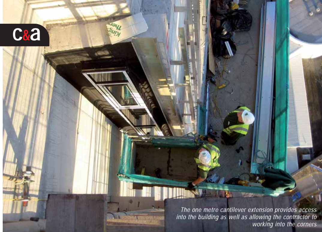
The one metre cantilever extension provides access into the building as well as allowing the contractor to working into the corners

With pressure on contract prices contractors ought to be investigating the adoption of more efficient methods of working which would, one assumes, provide an opportunity for mastclimbing companies. And yet the opposite seems to be the case, with contractors now afraid to try what they don't know! There is surely a case for the industry to do something here to spread the word.