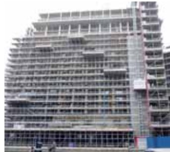
The canal side elevation showing the materials and passenger hoist and some of the extensive system scaffolding.