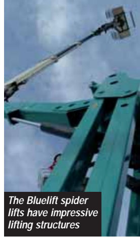
The Bluelift spider lifts have impressive lifting structures