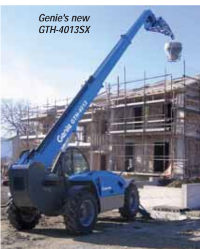
Genie's new GTH-4013SX

Genie will show its recently launched GTH-4013SX with lifting capacity of 4000 kg and maximum lift height of 13 metres.