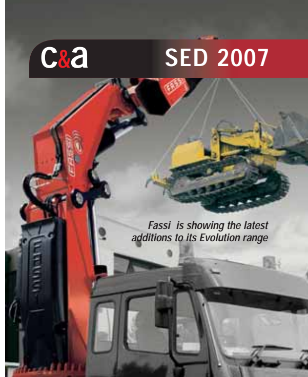
Fassi is showing the latest additions to its Evolution range