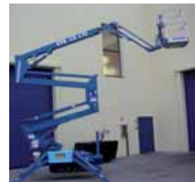
CTE will show two new Spider lifts.

The Italian manufacturer is now the UK market leader when it comes to small truck mounts. It will be showing the popular Z-20, a 20 metre articulated telescopic truck mount on a Bremach 4x4 chassis, along with one of the recently introduced Bizzocchi 15 metre straight telescopic truck mounts, most likely branded as CTE. Stars of the show though will be the two new tracked spider lifts, from the Traccess range with 13.5 and 17 metre work heights.