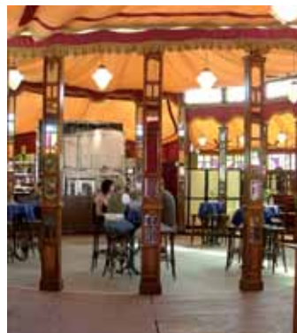
If the Arcomet stand does make it to the show do stop and have a look, you might have to buy a crane to go inside?

to SED. The highly unusual original structure is a 1930's mobile dance hall that used to travel from town to town in Belgium, if it does make it to Rockingham, forget the cranes and feast your eyes on this beautifully restored treasure.