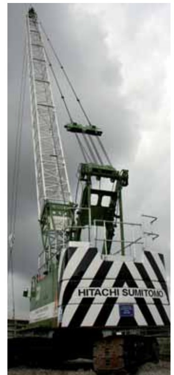
The Hitachi Sumitomo SCX800 is proving to be a popular crane.

NRC will show its popular SCX800HD-2, 80 tonne crawler crane, the company has sold 10 units since last year. It will also have its 40 tonne telescopic boomed crawler mount, the SCX400T.