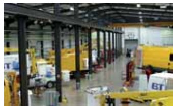
Versalift is organizing open days and plant tours at its nearby production facility.

Local company Versalift is not only exhibiting its new 2007 models with 265kg lift capacities but will be hosting an open house at its Burton Latimer plant just seven miles from the show ground. The company will be running a double decker shuttle bus back and forth between the plant and Rockingham, so that visitors can see the plant extension that is underway.