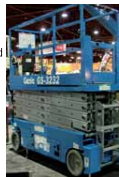
The first UK showing of the new innovative Genie GS3232

SED will be the first opportunity for many to see the two new Genie products launched at this years ARA in February. The GS3232 which will almost certainly spawn a new category of narrow aisle high reach electric scissor lifts by using levelling jacks to help the lift achieve greater working heights without the normal requirement for a large amount of additional weight. The new model will auto level itself on slopes of up to five degrees. As the GS3232 can only rise above 22ft when perfectly level, it is not much heavier than the company's 26ft narrow model and is therefore able to use all of the same componentry as the rest of the GS line, saving costs and providing fleet owners with parts commonality. The second new model on the stand will be the Z40/23NRJ a new narrow aisle electric articulated boom lift with a direct AC drive system. The new models shares components with the popular Z45 range.