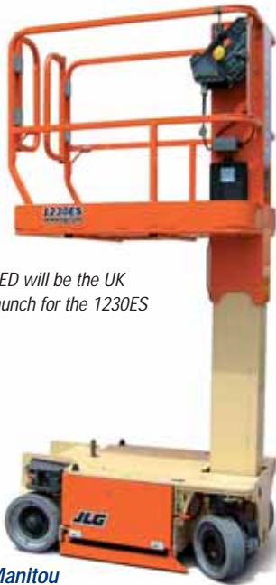
SED will be the UK launch for the 1230ES

A range of the company's booms and scissors will also be on display.