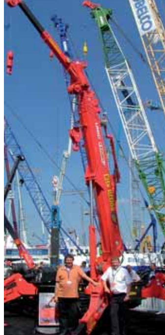
Hopoevly the UNIC 706, the worlds largest Spider crane, sold to City Lifting at Bauma, will be on display.

The Belgian company is hoping to show its MCT AF38 three axle mobile self erecting tower crane. As the Potain distributor for the UK it will also show an IGO50 self erector along with either a smaller self erector or possibly a Potain MC88 city crane. In addition to the cranes, Arcomet is hoping to bring the same stand that is had at Bauma