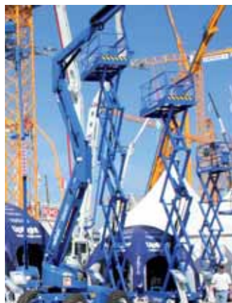
UpRight is re-launching its AB46 range

At last year's SED the Aerial stand was quickly converted to an UpRight stand, even though the acquisition of UpRight powered access by Tanfield had not been completed.