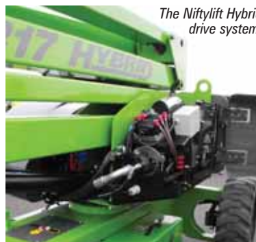
The Niftylift Hybrid drive system.