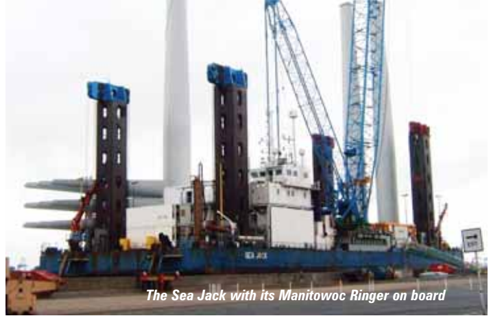
The Sea Jack with its Manitowoc Ringer on board

Platform Sales & Hire of Leighton Buzzard, UK has acquired Bucks Access Rentals (BAR) of Milton Keynes which operates more than 80 lifts, primarily Niftylifts. Platform Sales focuses on selling access equipment to end users and has a 30 unit rental fleet plus a training operation. BAR will retain its Milton Keynes base along with the local staff.