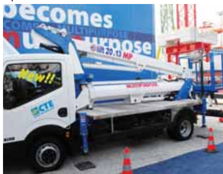
The new CTE 20:13MP will be on display at Vertikal Days.

You can see and try the 20:13MP at Vertikal Days June 16th/17th at Haydock Park.