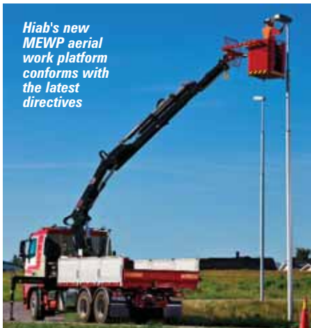
Hiab's new MEWP aerial work platform conforms with the latest directives

Hiab MEWP cranes are also fitted with stabiliser lights and an upgraded operator protection system (OPS). MEWP mode is activated by means of a key switch. The Hiab XS HiPro crane retains full capacity in this mode but speeds are optimised for comfort, safety, and precision.