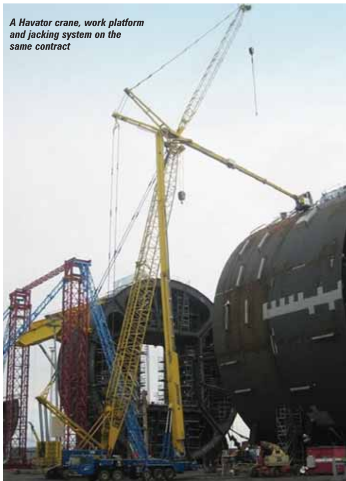
A Havator crane, work platform and jacking system on the same contract

Finnish-based international rental company Ramirent, has acquired the self propelled powered access business of fellow Finnish crane and access group Havator, signing a five year rental and cooperation agreement with the company covering Finland, Sweden and Norway. Havator will retain its truck-mounted aerial lift fleet which will remain alongside its mobile crane rental operation. Ramirent says that the agreement strengthens its position within the industrial sector and on large investment projects. The price of the acquisition has not been disclosed.