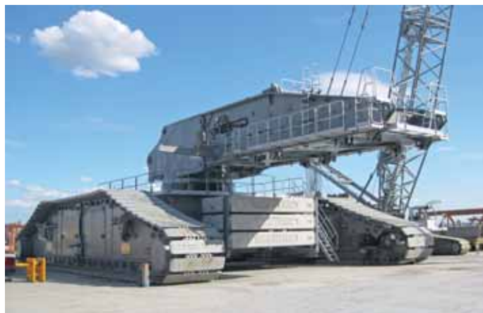
Liebherr's massive LR13000 starts to go together.

The standard superstructure counterweight ranges from 400 to 750 tonnes, while a suspended superlift counterweight system of up to 1,500 tonnes is available with a 54 metre derrick boom. The 52mm hoist ropes are 2,000 metres long and the main hoists have a line pull of 62 tonnes. All winches are driven by several independent motors which can continue working if one fails and has to be replaced. No single component on the LR13000 weighs more than 70 tonnes and most have a transport height of under 3.6 metres and four metres of width. The modular main hook block weighs 111 tonnes and is 9.7 metres high.