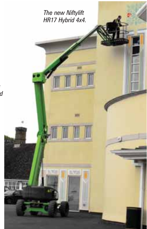
The new Niftylift HR17 Hybrid 4x4.