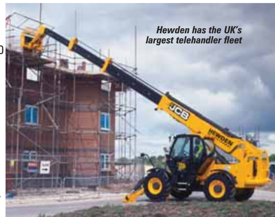
Hewden has the UK's largest telehandler fleet