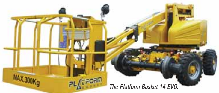
The Platform Basket 14 EVO.

that it can dismount from the tracks in the event that the main engine fails. The unit is also equipped with interlocks to allow it to travel under live overhead power lines and mechanical locks to eliminate the risk of slewing into the space of live railway lines.