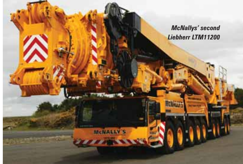
McNallys' second Liebherr LTM11200

ideal crane for large turbine erection work with its 100 metre main boom and superlift device. McNallys and its affiliate Windhoist, have carved