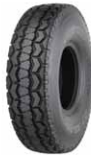
The new Dunlop ER50 All Terrain crane tyre.

Testing in the UK has been carried out with Coussens crane hire of Bexhill on a new Terex AC-120, equipped with 27 tonnes of counterweight and frequently run with 16.5 tonne axle loads. Director Paul Coussens, said: "The Dunlop ER50 was quiet and strong and regardless of the axle loads the tyre side walls sit straight. I was very impressed." The new tyre will be on display at Vertical Days in June.