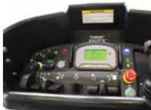
Niftylift's enhanced control panel.

to operate a function to free himself. In the event that he fails to do so within a specific time period, a message is transmitted from the base warning that the operator may require assistance, supported by a flashing blue light. The working envelope is similar to the model it replaces, in spite of its lower weight, although the revised lift geometry has reduced outreach by 500mm to 8.5 metres to the edge of the platform, but it is still only beaten by 51ft models that weigh up to three tonnes more and are 250mm wider. The company has also added some further enhancements to the platform controls with a digital screen that incorporates the battery charge and platform load indicator.