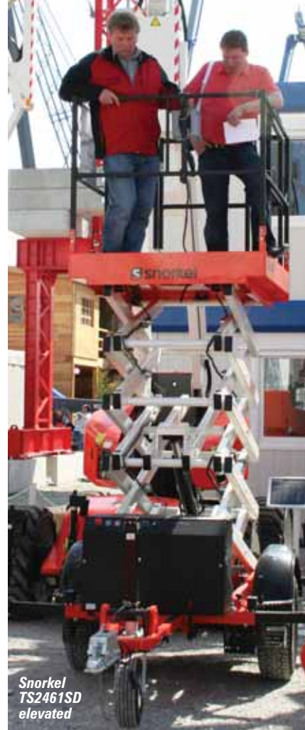
Snorkel TS2461SD elevated

Straight telescopic trailers are often lighter, faster and have greater outreach