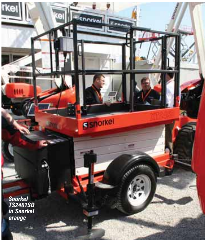
Snorkel TS2461SD in Snorkel orange