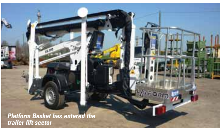
Platform Basket has entered the trailer lift sector

Over the past year or two, Cranes&Access has been predicting the rise and rise of the spider lift as the access industry's 'jack of all trades', and increasing sales figures certainly appear to back this up. Yes its crawler undercarriage and often narrow dimensions can get the