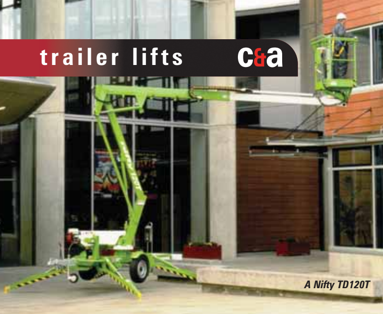
A Nifty TD120T

platform into almost any position under its own steam, and yes most can be transported easily on a two axle plant trailer, but it does have several disadvantages when compared to a trailer lift.