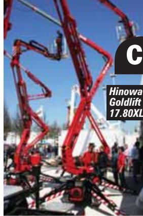
Hinowa Goldlift 17.80XL