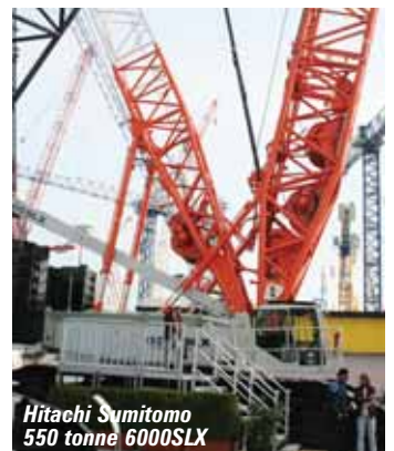
Hitachi Sumitomo 550 tonne 6000SLX

Italian truck and spider lift manufacturer Oil&Steel launched its new 27 metre working height truck mounted lift mounted on a 3.5 tonne chassis. The Snake 2714 Compact is unusual in that it mounts the platform onto a connected third axle trailer and not directly onto the truck chassis. By mounting this way it can be driven on B and E driving licenses and is particularly suitable for the Dutch and German markets.