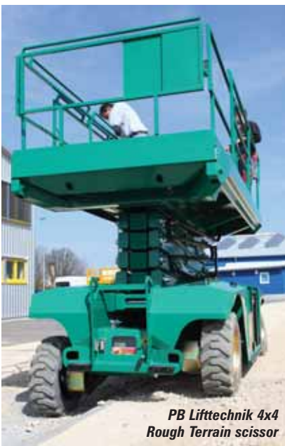
PB Liftechnik 4x4 Rough Terrain scissor