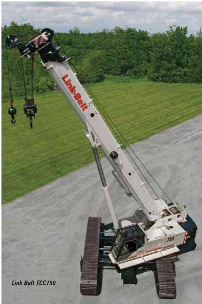
Link Belt TCC750