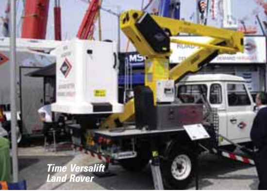
Time Versalift Land Rover