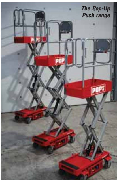
The Pop-Up Push range

Pop-Up will show the production versions of its excellent new push