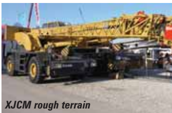
XJCM rough terrain

Unfortunately, the stand personnel did not make it from China, but these two cranes including 30 tonne Rough Terrain QRY30 did.