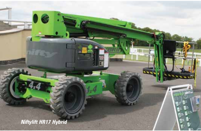
Niftylift HR17 Hybrid