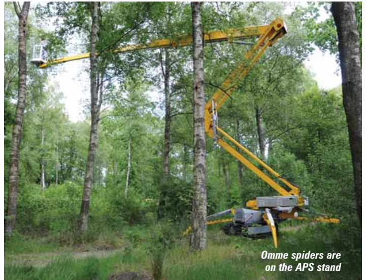
Omme spiders are on the APS stand

A Paus aluminium trailer crane will be on the GGR stand.