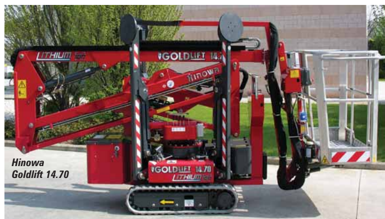
Hinowa Goldlift 14.70