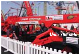
Unic 706 sale

Unic Cranes had a good show taking several orders including this for one for its largest mini cranes, a Unic 706 to Lift Ltd.