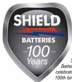
Shield Batteries is celebrating its 100th birthday

Shield Batteries is celebrating its 100th year as a UK manufacturer. Founded in London in 1910 to