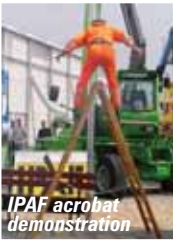
IPAF acrobat demonstration

IPAF had an excellent interactive stand with demonstrations to highlight the problems of not using the right equipment for a job using a highly skilled acrobat to reinforce the message to the many stand visitors.