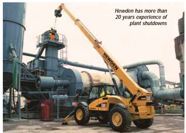
Hewden has more than 20 years experience of plant shutdowns

At Hewden we have more than 20 years experience with plant shutdowns, and Hewden Industrial Accounts, formerly Hewden Services, offers customers a solution that not only removes the burden of managing third party equipment suppliers, but also delivers cost savings and efficiency benefits, while ensuring full compliance with health, safety and environmental standards.