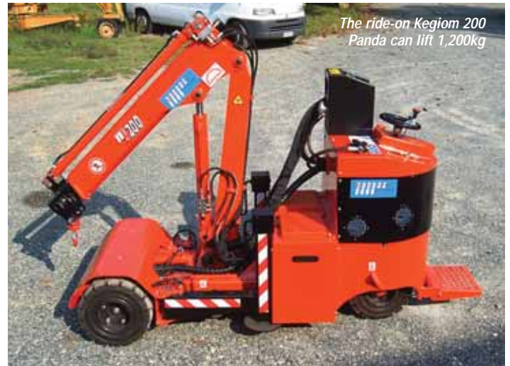
The ride-on Kegiom 200 Panda can lift 1,200kg

Latest offering from Wemotec is the SMK320.67, a versatile long boom specialist spider crane. The company has teamed up with and uses a Palfinger loader boom to produce a machine with stowed dimensions of 4.87 metres long by 1.75 metres wide with an overall height of 1.98 metres, yet is capable of a 32 metre hook height and 6.7 tonne maximum lift capacity. Its articulated boom has two main arms with over-centre articulation, plus a telescopic jib, making it amazingly versatile for reaching difficult areas particularly with a 29 metre outreach. A four-axis manipulator arm has also