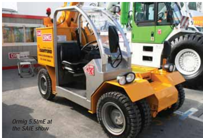
Ormig 5.5tmE at the SAIE show

hoists/winchers and extension jib attachments making them a viable small crane option.