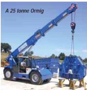
A 25 tonne Ormig