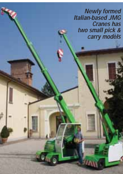
Newly formed Italian-based JMG Cranes has two small pick & carry models