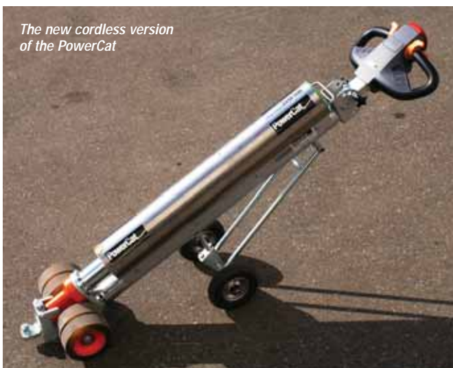
The new cordless version of the PowerCat