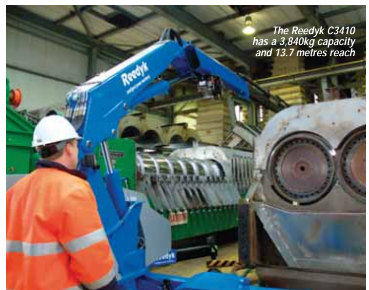
The Reedyk C3410 has a 3,840kg capacity and 13.7 metres reach

Measuring 2.4 metres long by 860mm wide and 950mm high at its most compact, additional stability can be gained from the rearwards moveable water tank counterweight system and rolling outriggers/stabilisers that are swung into the forward position for maximum outreach. The compact crane also features a boom mounted winch, single sheave