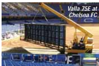
Valla 75E at Chelsea FC