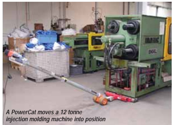
A PowerCat moves a 12 tonne injection molding machine into position