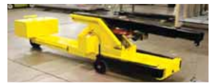
The Smart-Rig crane has decent lifting duties for its size.

At first glance, these three machines would appear similar.