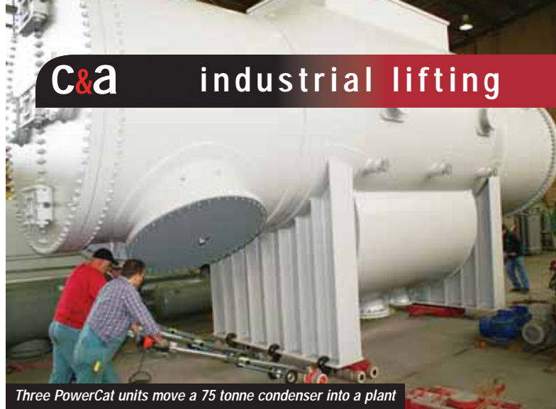
Three PowerCat units move a 75 tonne condenser into a plant

movement of a 12 tonne injection molding machine to a new position and shifting large machining centres.