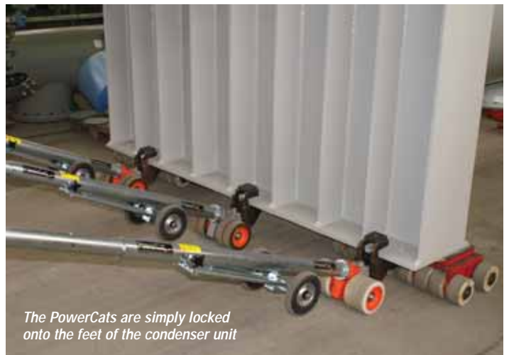
The PowerCats are simply locked onto the feet of the condenser unit