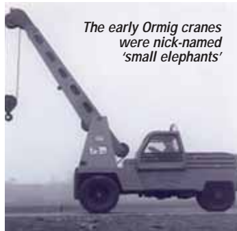
The early Ormig cranes were nick-named 'small elephants'