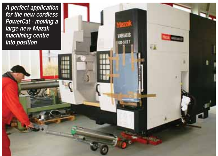
A perfect application for the new cordless PowerCat - moving a large new Mazak machining centre into position