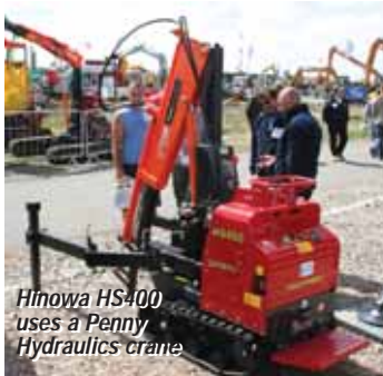
Hino HS400 uses a Penny Hydraulics crane

A newly formed Italian company – JMG Cranes – has also introduced a range of compact capacity pick & carry cranes. It was thought that the cranes would be launched last year at either the SAIE exhibition or more recently at Bauma. Unfortunately the cranes made a 'no show'. Valla says that it has taken legal action against the company 'to protect its business and goodwill in respect of unfair competition' so until this has been sorted, we will not be seeing the cranes in Europe. Several other lifting machines use loader boom technology. Although more spider crane than pick & carry,