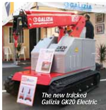
The new tracked Galizia GK20 Electric

electronic steering system and two position boom nose to minimise head room requirements.