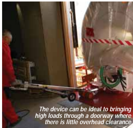
The device can be ideal to bringing high loads through a doorway where there is little overhead clearance