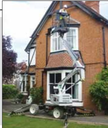
The Nifty SD120 with GT Access.

Bromsgrove and Gloucester, UK-based GT Access has purchased the new Niftylift SD120T lightweight 12 metre working height boom lift. The SD120T utilises the same boom and lift mechanism from the Nifty 120T trailer lift and Height Rider 12 self-propelled boom, but combines it with the company's all-wheel drive 'Self Drive' chassis. Hydraulic outriggers allow levelling on uneven ground as well as keeping the overall weight below 2,500kg. The power pack includes a Bi-Energy option.