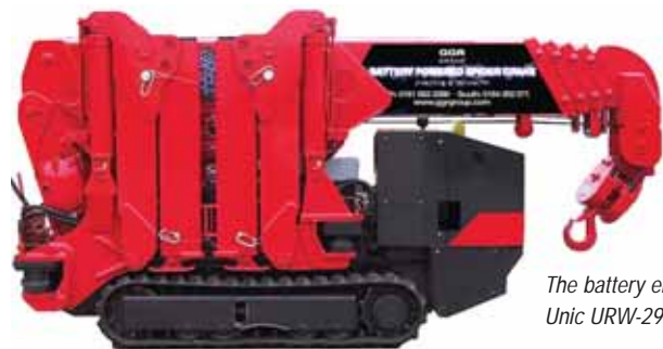
The battery electric Unic URW-295.

GGR has launched a new 2.9 tonne capacity battery electric Unic URW-295 spider crane. The new model is based on the standard Unic URW-295 which is available with diesel, petrol, LPG or dual power with AC electric drive. It features an 8.4 metre boom, radio remote controls, spider-type outriggers and an overall stowed width of just 600mm.