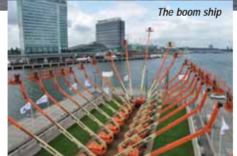
The boom ship