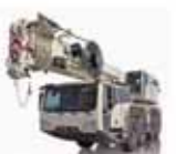
Road Mobile Cranes