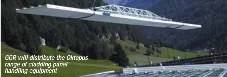
GGR will distribute the Oktopus range of cladding panel handling equipment

UK-based GGR has taken over distribution of the Oktopus range of cladding handling equipment. The company will market the products under the GGR Cladding brand, offering its customers the option to purchase or rent the equipment which is used for installing large-format roofing, wall, ceiling and façade panels made of sandwich, profiled sheeting and glass.