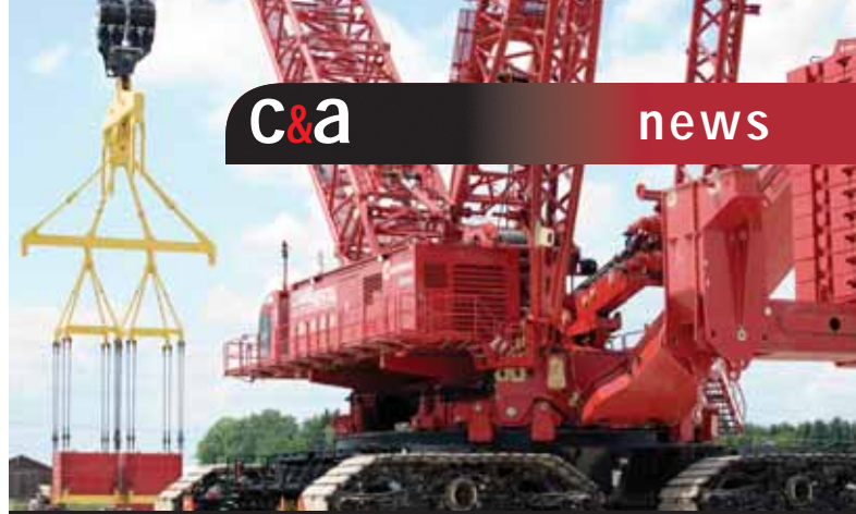
The new 2,300 tonne Manitowoc 31000 is going through its final load testing before shipping to its launch customer Bulldog Erectors