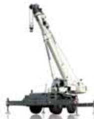
Rough Terrain Cranes