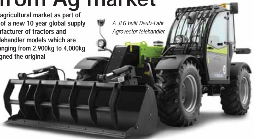
A JLG built Deutz-Fahr Agrovector telehandler.

The company says that the decision to withdraw the JLG brand from the agricultural market was not one that was taken lightly due to the considerable investment it has made promoting the brand to farmers. It now believes that the greatest opportunity for growth in the sector remains with the recognised and established brands and distribution networks. This applies to Deutz-Fahr and Caterpillar for agriculture and JLG and Caterpillar for the construction and rental market.