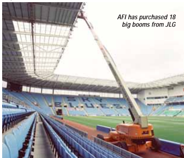
AFI has purchased 18 big booms from JLG

UK-based access rental specialist AFI-Uplift has purchased 18 large JLG boom lifts to expand its top end range. The investment includes six 80ft/24m 800 AJs, six 86ft/26m 860 SJs, three 125ft/38m 1250 AJPs and three 135ft/ 41m 1350 SJPs – the largest models in the AFI fleet.