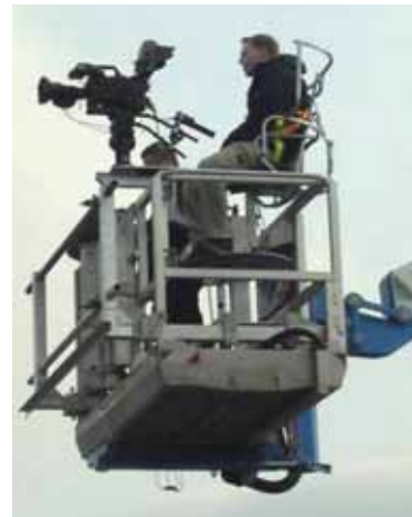
The Campod assembly fits into a standard platform.