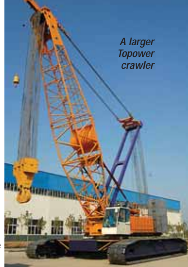
A larger Topower crawler

Terex has also agreed a 60 percent share in a joint venture in Quanzhou, China, to produce mobile materials processing equipment with Fujian South Highway Machinery.