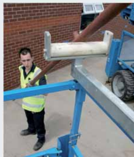
Lavendon offers a range of material handling attachments for scissor and boom lifts enabling the quick and safe installation of materials (up to 600kg) of varying lengths.