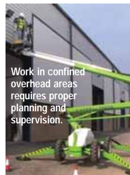
Work in confined overhead areas requires proper planning and supervision.

Straightforward guidance on how to prevent rare but dangerous accidents that could happen when mobile elevating work platforms (MEWPs) are used in confined spaces is now available.