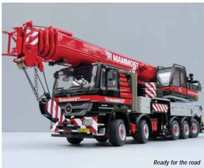
Ready for the road

The crane functions work well with the hoist operated by a supplied key. The main boom cylinder is not particularly stiff and bleeds down