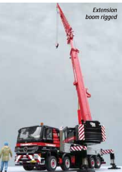
Extension boom rigged

The five stage telescopic boom is metal and the base section has a metal spool, a pair of lights and supports for the boom extension. The boom sections lock into place when extended, and as the extension is pinned to the main boom side it does not fall off when the boom is raised.