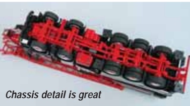
Chassis detail is great