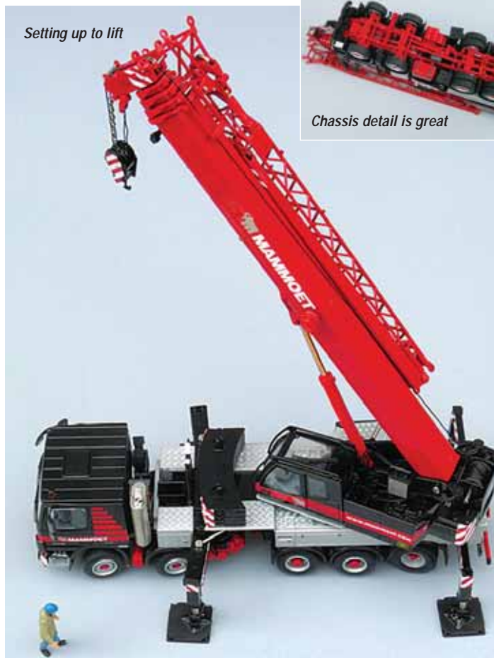
Setting up to lift

Detail on the crane superstructure is excellent with a mass of hydraulic cabling running to the various motors and cylinders, while the counterweight is made up of five plates like the real crane. It is detachable and can be either stowed on the carrier deck or attached to the superstructure in its working position. The crane engine has also been modelled and this is revealed by lifting two opening panels.