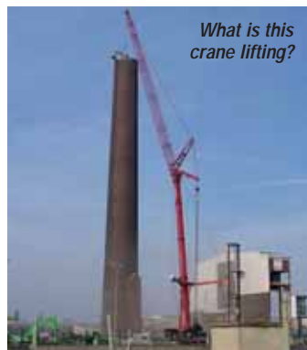
What is this crane lifting?