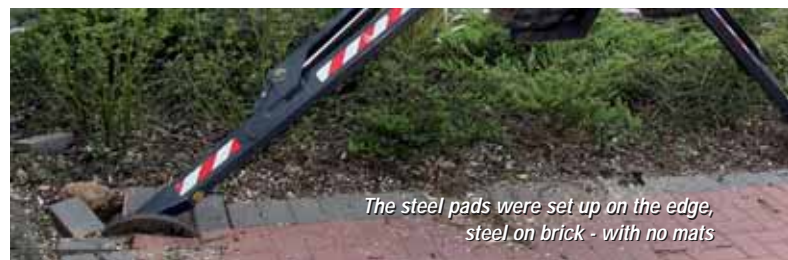
The steel pads were set up on the edge, steel on brick - with no mats