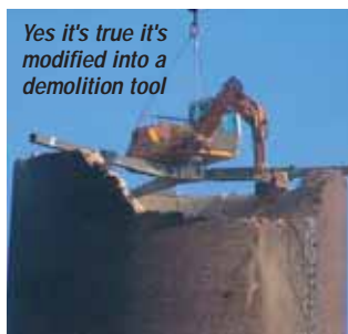
Yes it's true it's modified into a demolition tool