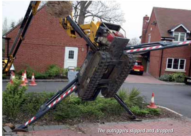
The outriggers slipped and dropped

called to conduct an investigation. On the surface of it the operator had set his outriggers right on the edge of a brick paved drive, the outrigger pad - metal on stone - slipped into the adjacent flower border. While it looked like an outrigger problem, this lift is fitted with switches to limit the outreach to just over six metres. The unit was at the very least working at the extreme of its outreach. It might have been a tip that then set off the outrigger collapse. A properly trained operator would never have set up so close to a loose edge and would have used a wood or polypropylene outrigger mats.