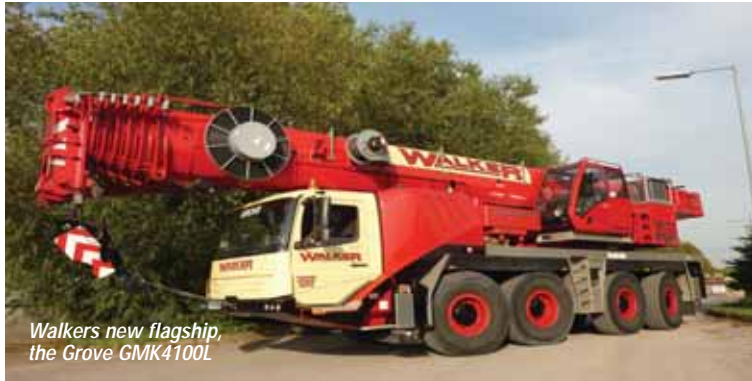
Walkers new flagship, the Grove GMK4100L