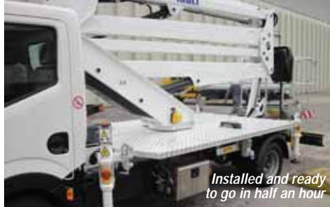
Installed and ready to go in half an hour