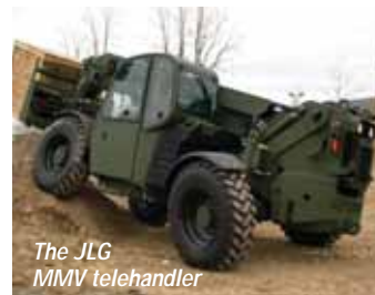
The JLG MMV telehandler

JLG has won a $40 million contract to supply 280 telehandlers to the US Marines. The units will be built at the company's McConnellsburg, Pennsylvania facility over the next two years.