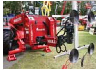
The Guerenuk 500 telehandler mounted glass handler on the Heli stand.

control, while two rotators add a wrist action to the vacuum frame.