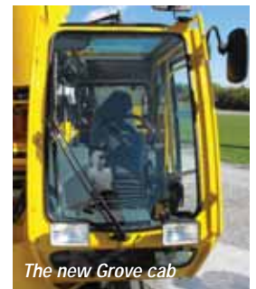
The new Grove cab

The cranes outriggers and counterweight can both be self-removed/ installed for transport. Both cranes are also equipped with new, quieter, cleaner Tier 4 engines for North America and Europe. Tier 3 power units are available for markets where low sulphur diesel is not yet available.