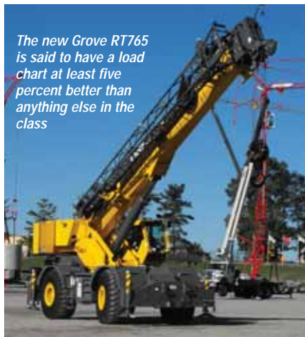
The new Grove RT765 is said to have a load chart at least five percent better than anything else in the class