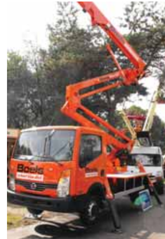
A 20 metre CMC TB200, one of 18 new truck mounts ordered by Boels

Kraan en Truck Service showed one of 18 CMC new truck mounts that it has sold to rental company Boels. The order, which follows six units that it acquired last year, includes four TB200 articulated booms, 10 PL 210/212 straight telescopics and four PL190 straight booms.