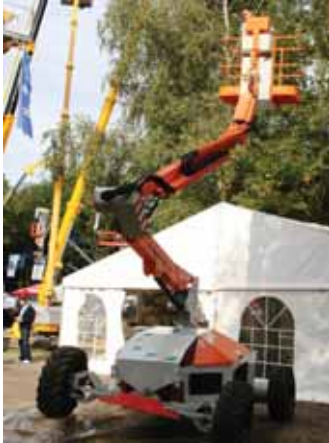
The impressive new 16 metre Mecaplus ME16SL demonstrated its capabilities.

New products included MEC's 40ft/12.2 metre Titan 40S in Rival colours fresh from Elevarte in Spain; scissor and vertical mast lifts from Chinese manufacturer Dingli; the Guerenuk 500 glass manipulator telehandler attachment and two platforms specifically designed for tree work - a 26 metre truck mounted platform built by Custers for the City of Maastricht and the new 16 metre Mecaplus ME16SL self-propelled boom.