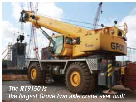
The RT9150 is the largest Grove two axle crane ever built

The RT9150 - the largest two axle Grove ever - combines the chassis of the 130 ton RT9130E with the basic superstructure of the Grove GMK5130-2 All-Terrain crane. It is said to offer substantial lift capacity improvements over the 9130, while the 60 metre Twin Lock pinned boom (a Grove RT first) is almost 12 metres longer. Maximum tip height is more than 95 metres when fitted with inserts and the hydraulically luffed bi-fold swingaway extension. The new model will come into