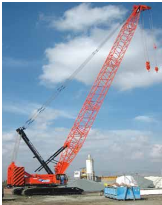
Kobelco will produce cranes up to 250 tonnes in both China and India.

The new venture follows Kobelco's recently announced $12.7 million crane production facility in Sri City Special Economic Zone in India which will build crawler cranes from 90 to 250 tonnes capacity. Kobelco claims a 17.4 percent share of the worldwide crawler crane market.