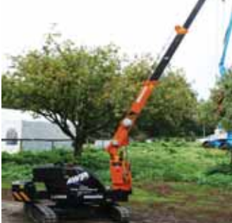
The Komatsu LC08M-1 mini crane's tracks extend from 850 to 1,580mm while the counterweight extends hydraulically.

An unusual exhibit was a 1,590kg Komatsu LC08M-1 mini crane. While no longer in production the 800kg crane sported a range of impressive features for its size, including a 5.1 metre all hydraulic boom and hoist with 43 metres of cable storage.