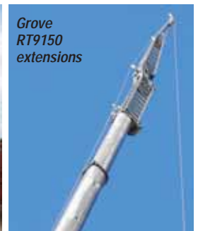
Grove RT9150 extensions

its own on large sites or plants where high reach is required and a long and complex AT chassis a disadvantage.