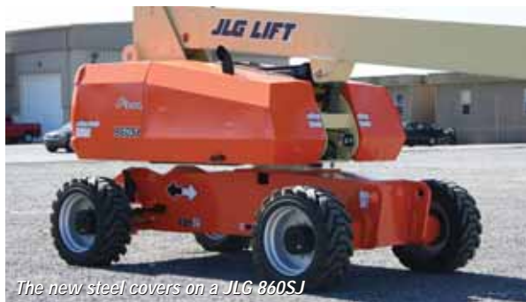
The new steel covers on a JLG 860SJ

JLG is switching from composite moulded covers on its diesel boom lifts sold in the Americas to steel. The move is driven by customer requests for covers that are more rugged and easier to repair, as well as being less costly. The first units to feature the new covers are the 600S, 800S and 800A models.