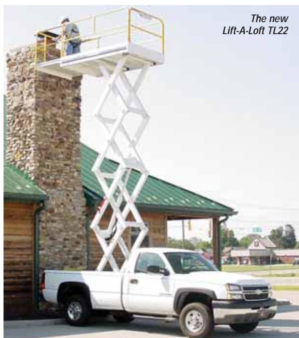
The new Lift-A-Loft TL22

US-based Lift-A-Loft has introduced a new pick-up mounted scissor lift that can be removed in around 10 minutes. The TL22 has been developed for shorter jobs where speed across site or to the job is of real benefit. The 6.65 metre platform height lift features a 1.34 metre wide platform with 227kg capacity and includes a standard 900mm deck extension which provides outreach to the rear. The TL22 can be mounted in any pickup truck that has 1,250kg of payload and a 2.4 metre bed. It features a self-contained power pack that automatically re-charges from the vehicle's electrical system. The unit meets the requirements of ANSI A92.2, does not require outriggers but is not yet CE approved.