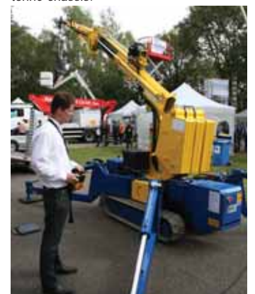
There were several tracked mini cranes including this 17.4 metre reach, 4 tonne maximum Hoeflon C610.