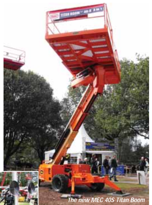
The new MEC 40S Titan Boom