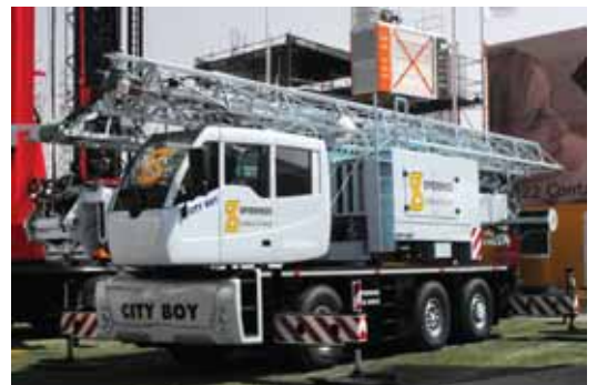
The Spierings City Boy at Bauma earlier this year.