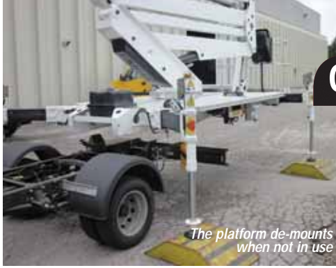
The platform de-mounts when not in use

The Italian customer says that this system has the advantage of reduced insurance and tax by using a single chassis for two purposes.