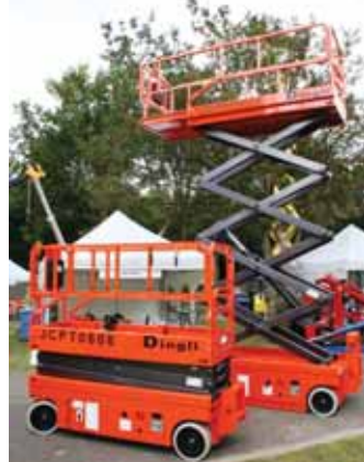
The 20ft Dingli JCPT0808 and JCPT1012 narrow scissor lifts on the Alp Lift stand.

Alp Lift which imports Airo scissors and booms has taken on the Dingli scissor lift distribution for Holland and Belgium. The two units on show - a classic 20ft narrow and 26ft/46inch model - looked impressive in terms of quality and finish and as good as any Chinese-built scissor lift we have seen to date.