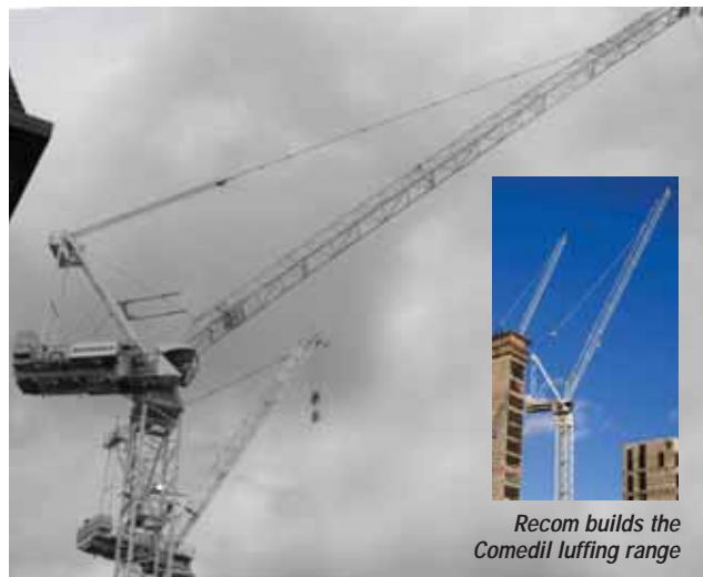
Recom builds the Comedil luffing range