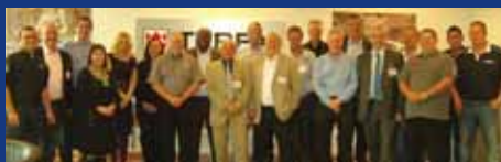
The Access Link

• The UK's Access Link held its autumn meeting at the Terex/Genie assembly plant in Coventry in September.