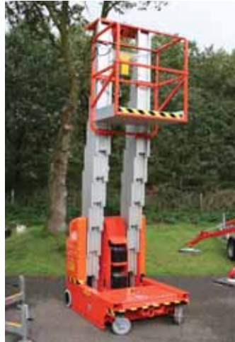
A 14 metre Dingli dual mast self propelled vertical lift on the Faraone Netherlands stand.

Chinese manufacturer Dingli had several aluminium self-propelled machines at the show on different stands and in different liveries.