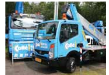
Collé had an impressive stand that included several Palfinger platforms including this P260 on a 3.5 tonne chassis.