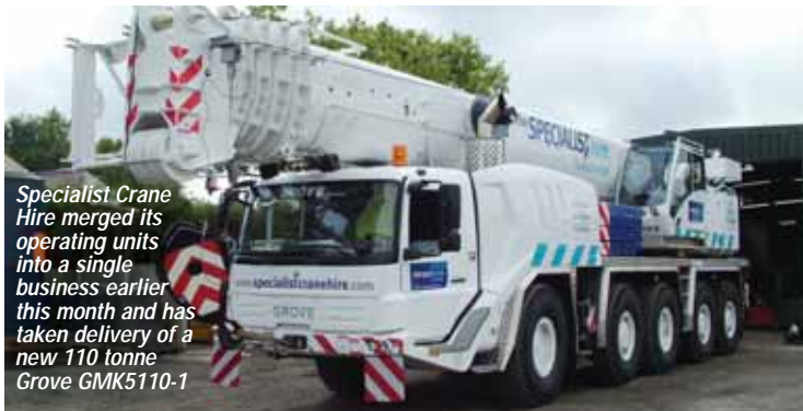
Specialist Crane Hire merged its operating units into a single business earlier this month and has taken delivery of a new 110 tonne Grove GMK5110-1