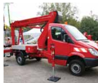
Ruthmann took the opportunity to launch its new TB270 and TBR200 models in Holland.

Other companies reporting sales included Aillift Michielsen which took an unexpected order for three GSR truck mounts and Eurosupply.