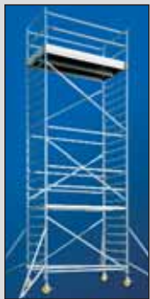
A Custers span tower