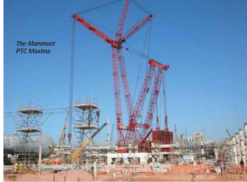
The Mammoet PTC Maxima