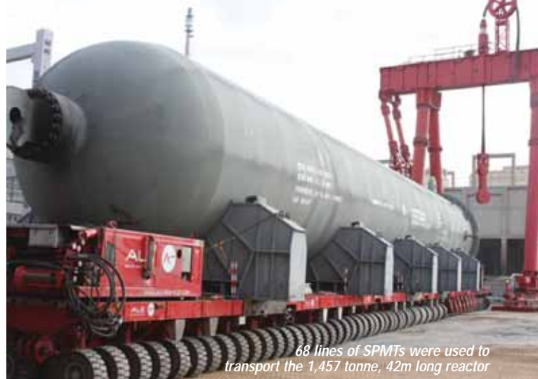
68 lines of SPMTs were used to transport the 1,457 tonne, 42m long reactor

Global heavy transport and lifting company ALE has been making further investments in its large capacity crane fleet. The most recent addition being its second 4,300 tonne AL.SK190 that it claims is the world's largest land-based crane with a load moment of 190,000 tonne/metres. Earlier in the year, the company also added a 1,600 tonne Terex CC8800-1 crawler crane at a cost of €11 million which successfully completed a record breaking inaugural lift at the Galp refinery near Sines, Portugal.