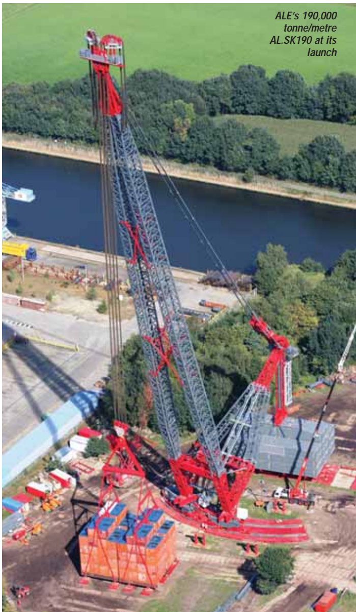
ALE's 190,000 tonne/metre AL.SK190 at its launch

Basically the ALE SK uses its counterweight as its centre of rotation which the company claims provides a much better working envelope, as well as helping reduce the need to track to a different position. Because of the crane's different configuration the model numbering has been changed to reflect the way the industry