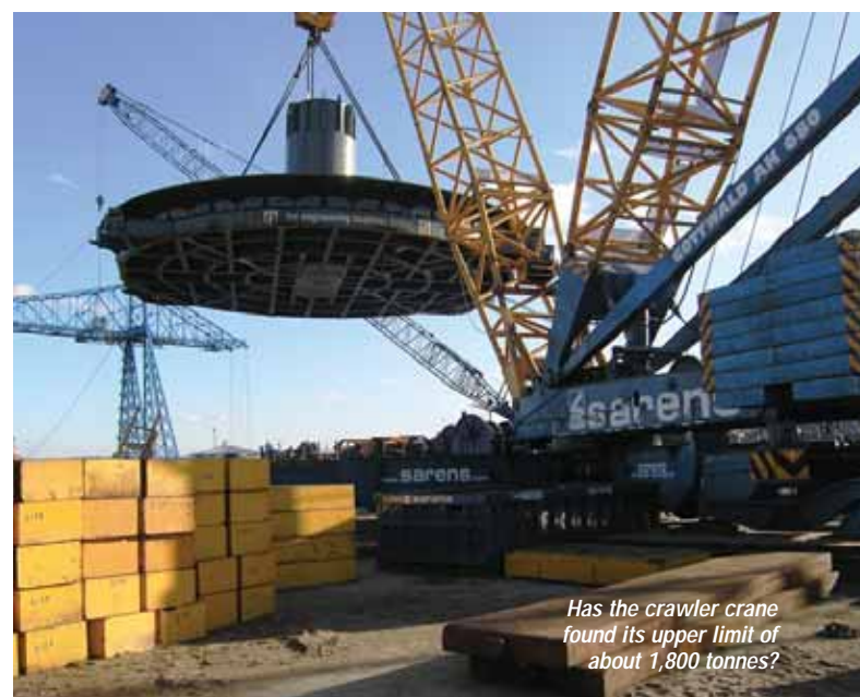
Has the crawler crane found its upper limit of about 1,800 tonnes?