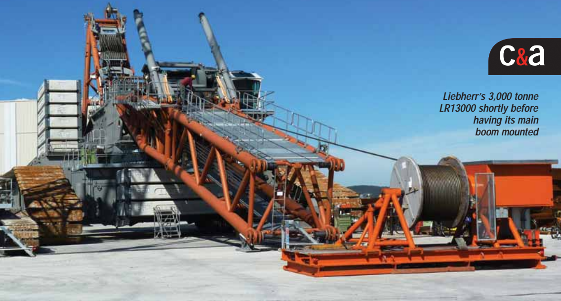
Liebherr's 3,000 tonne LR13000 shortly before having its main boom mounted

crawler crane in the world its projected lift capacity of a little more than 2,800 tonnes is a long way short of the 3,200 tonne Terex 8800-1Twin.