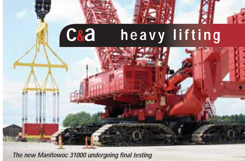
The new Manitowoc 31000 undergoing final testing