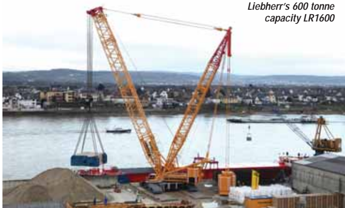
Liebherr's 600 tonne capacity LR1600

at the doors of the majors to get their hands on these big beasts. Quite the opposite in fact with orders for the big crawlers (although never going to be high) lower than expected. This weak demand is more surprising given that most manufacturers developing and building limited edition large cranes tend to develop the machine in conjunction with 'guaranteed' end-user partners i.e. a lead customer that is willing to take at least the first machine. Al Jaber was the design partner and owner of the first Terex Demag CC8800-1 Twin, Bulldog Erectors for the Manitowoc 31000. Liebherr on the other hand appears to have chosen a different course and does not yet have a firm order.