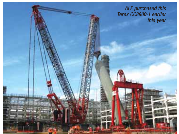
ALE purchased this Terex CC8800-1 earlier this year

Cost and delivery always play an important role in the choice of large lifting equipment. ALE initially decided to design and build its own heavy lifter after a total lack of