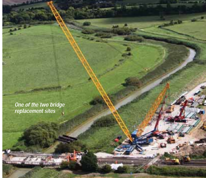
One of the two bridge replacement sites

transporters. More than 13,000 tonnes of locally sourced recycled aggregates were used to construct the raised roads across the flood plain (which included streams and ditches) so that no oils or fuels could contaminate the surrounding area. At the end of the project, the temporary road was removed and the aggregate sold back to the supplier for re-screening and re-use.