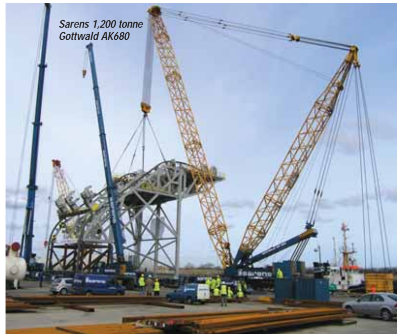
Sarens 1,200 tonne Gottwald AK680

measures performance – so the SK190 and SK350 now mean 190,000 tonne/metre and 354,000 tonne/metre load moments measured from the centreline of rotation. Measured this way, even the smaller SK190 has a load moment about 19 percent and the SK350 more than 120 percent more than its nearest rival - the 160,000 tonne/metre Mammoet PTC-160DS.