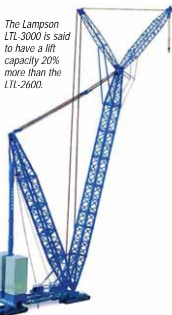
The Lampson LTL-3000 is said to have a lift capacity 20% more than the LTL-2600.

Although Lampson claims that the LTL-3000 will be the largest mobile